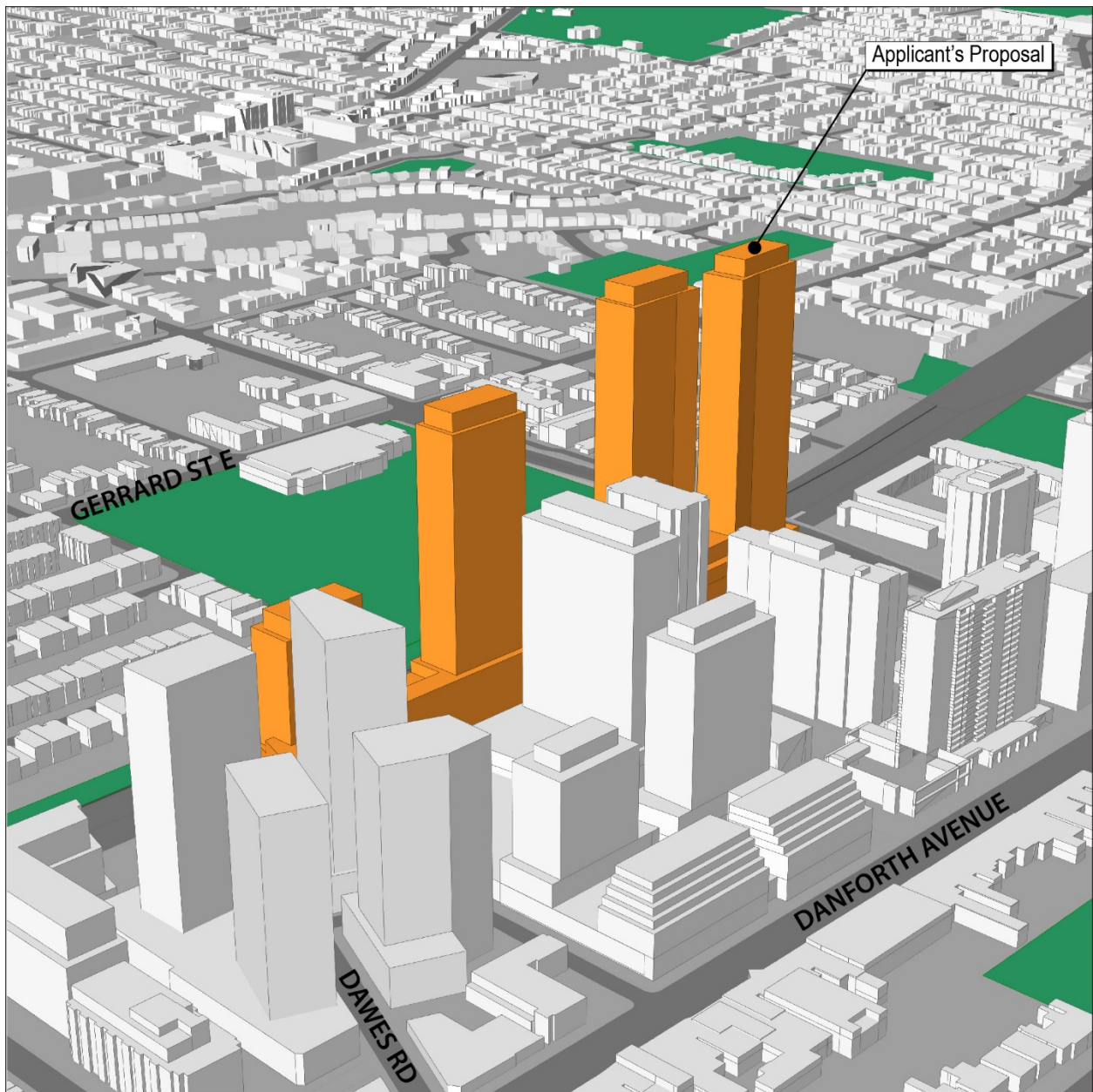
View of Applicant's Proposal Looking Southeast