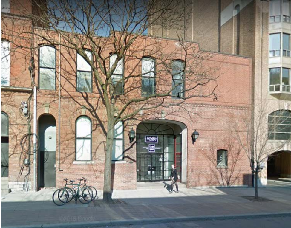
65 George Street – west (George Street) elevation