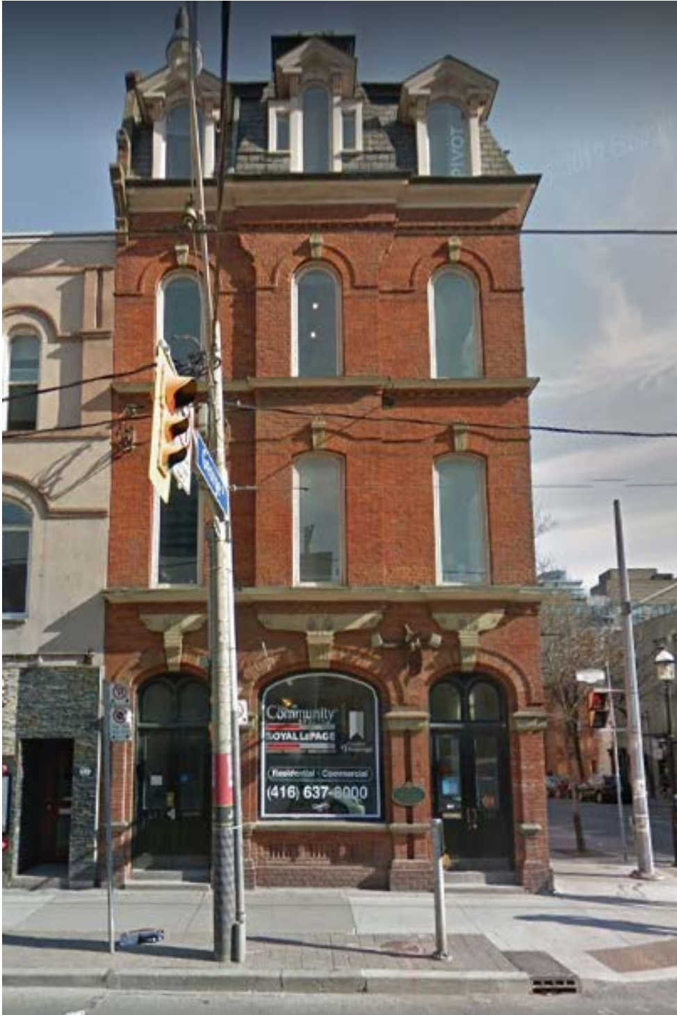
187 King St E – north (King Street) elevation