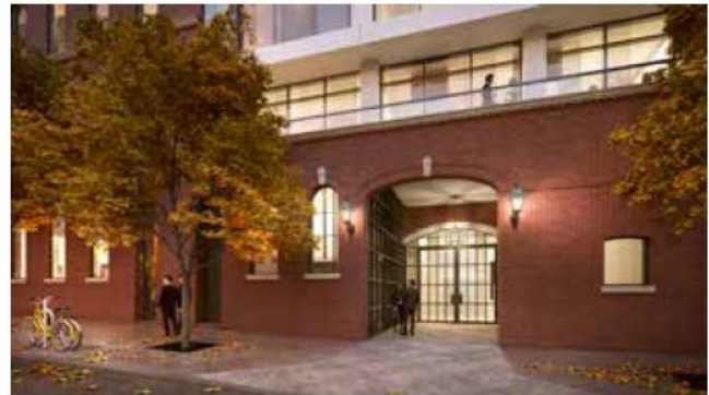
Conceptual renderings of the Site (Core Architects, 2021).

Please note: Image is not exactly as proposed. The image shows a height of 16 storeys, the proposal is for 17 storeys. For illustrative purposes only.