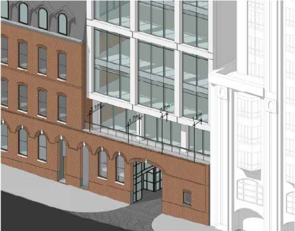
Proposed west elevation