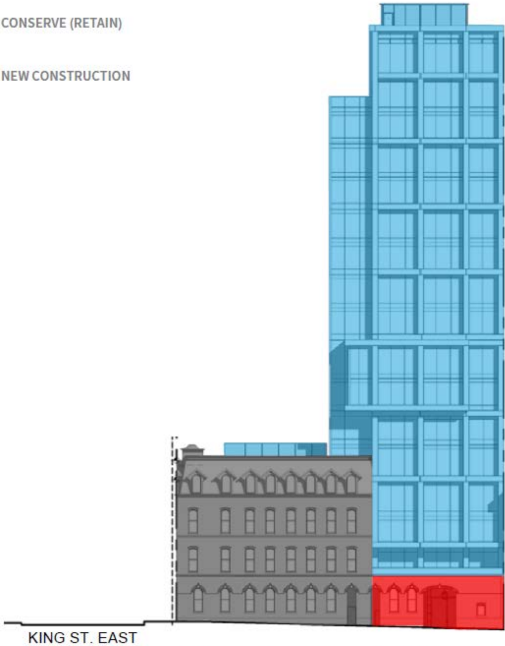
West elevation showing proposed conservation approach (Core Architects, 2021, annotated by ERA).