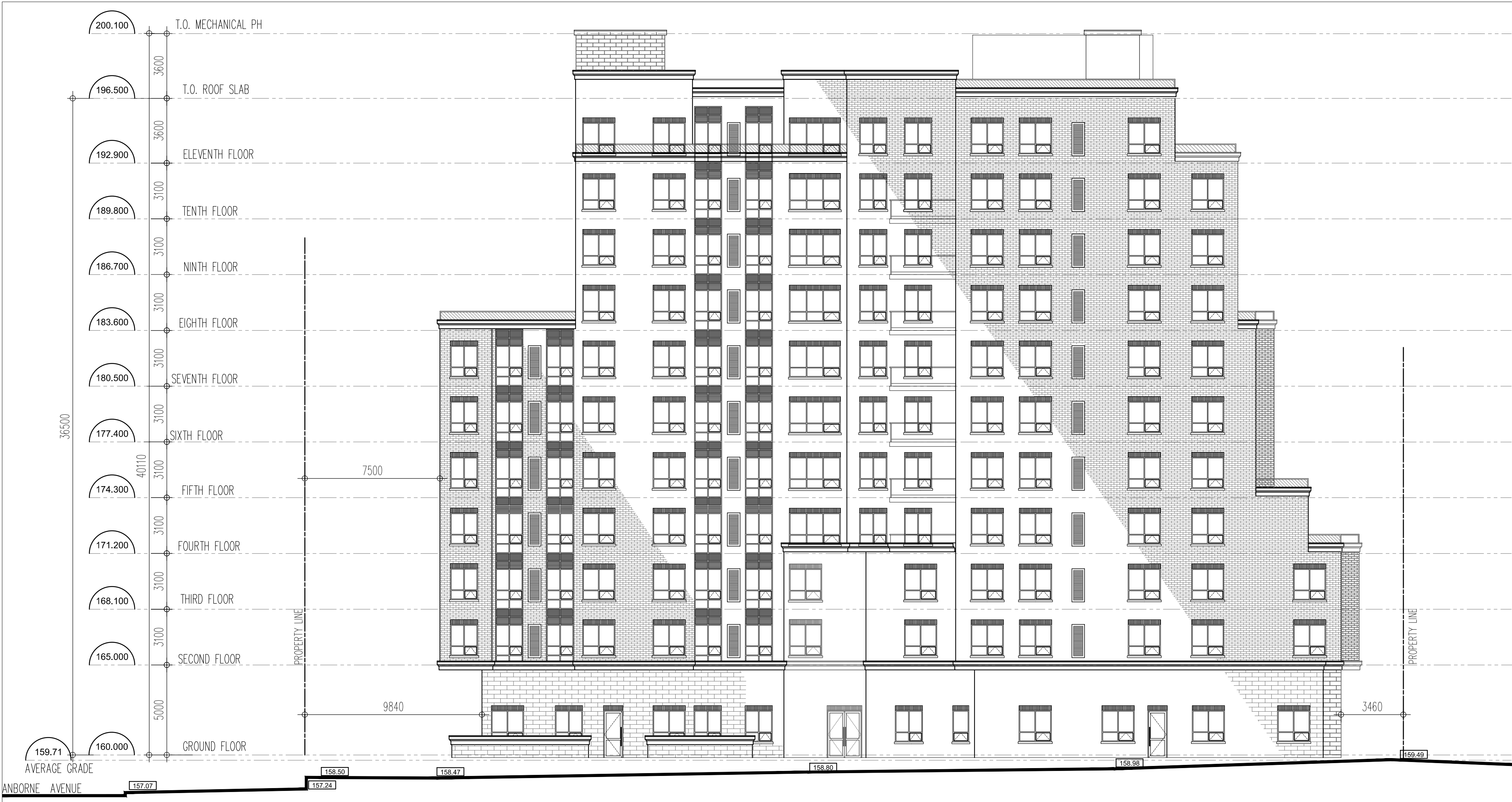
SOUTH BUILDING ELEVATION 3 1:150 SCALE A400