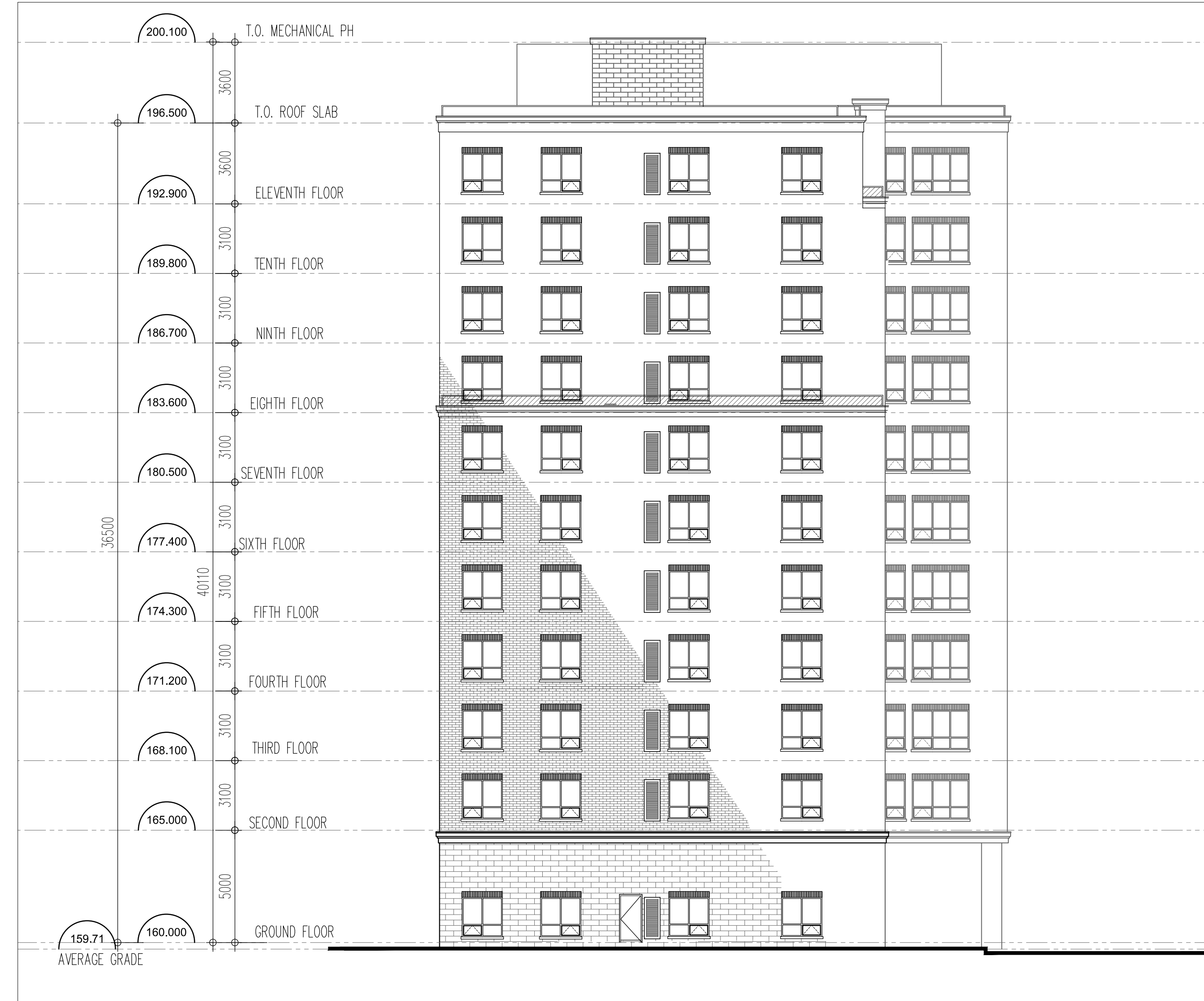
REAR/WEST BUILDING ELEVATION 4 1:150 SCALE A400