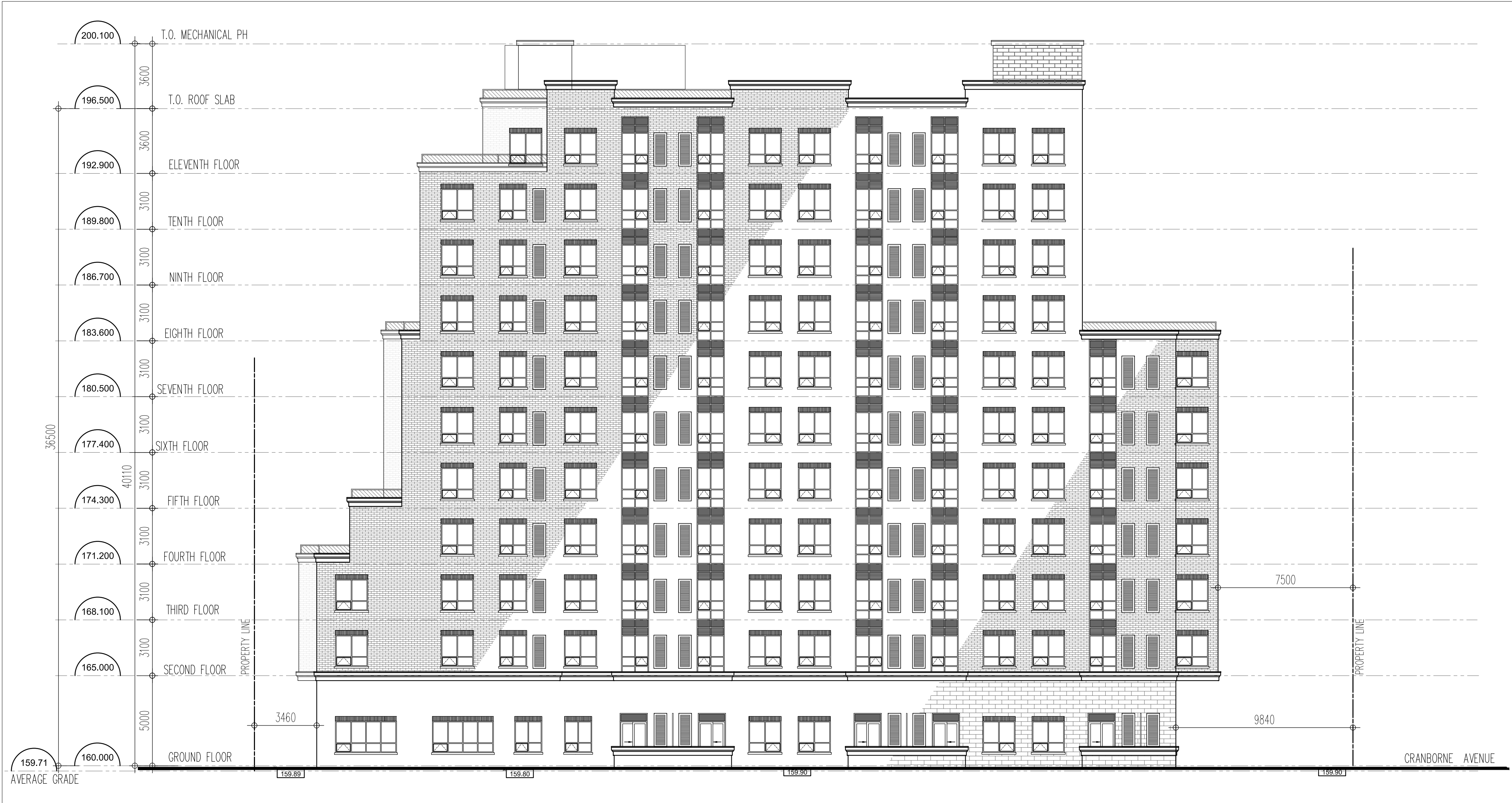
NORTH BUILDING ELEVATION 1 1:150 SCALE A400