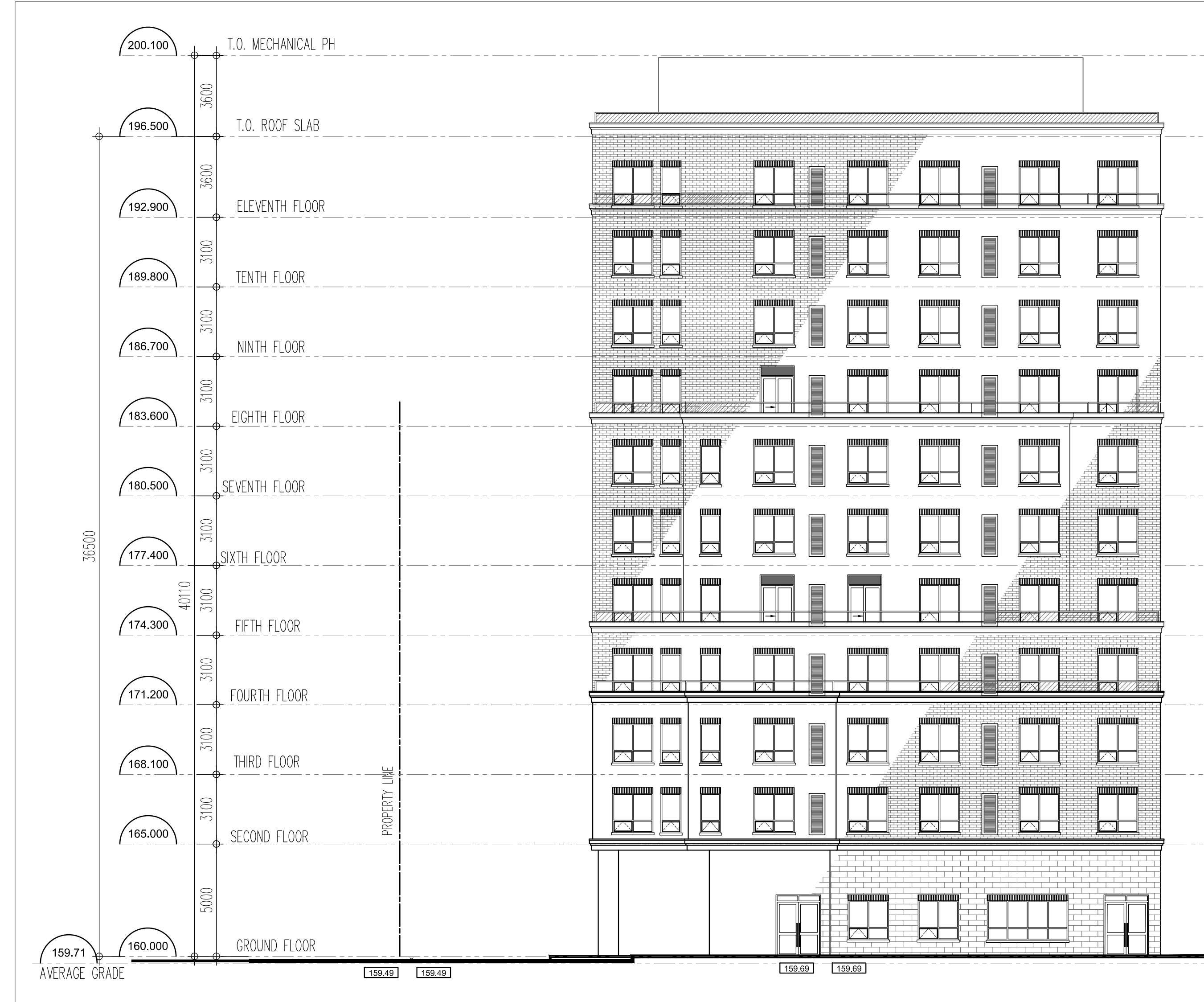
FRONT/EAST ELEVATION 2 1:150 SCALE A400