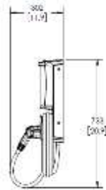
Flo CoRe+ Station Dimension

We therefore recommend that the Committee and Council consider adjusting the proposed by-law amendment in the Report to allow for the easy installation of the broad range of EV charging stations on the market by enabling EV charging infrastructure that extends out to 25-inches to be installed without requiring variance applications. This would provide residents, businesses, and developments with more choice of EV infrastructure providers while promoting the electrification of transportation, saving costs, and reducing greenhouse gas emissions. Moreover, passing a bylaw amendment that provides for roughly 25-inches will result in fewer variance applications for the City of Toronto moving forward.