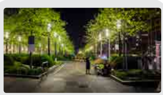
Safety and Wayfinding