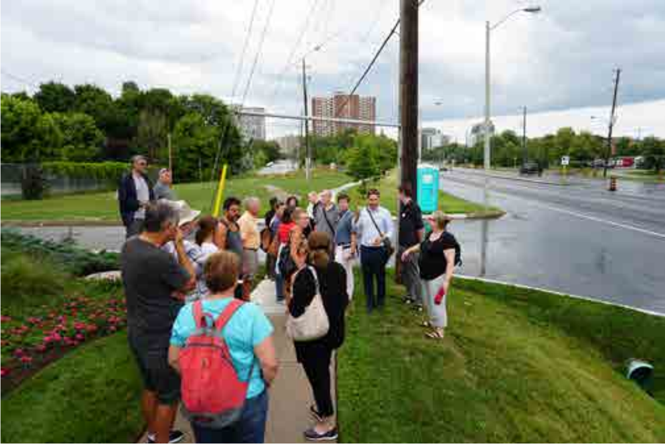
Figure 428. Photos from the walking tour on August 1 2018