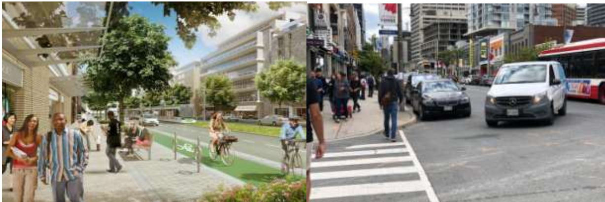
Left: Approved design for Eglinton Connects: safe for all users. Right: Existing unsafe design at Yonge & Erskine: no crossings, cars blocking sightlines, no bike lanes, narrow sidewalks