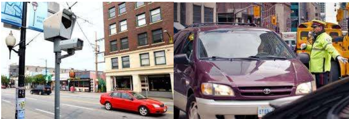
Speeding Cameras in B.C.; Traffic Warden in Toronto

c) request the Ontario government to (a) increase fines and (b) permit municipalities to retain the traffic fine revenue currently directed to the provincial government