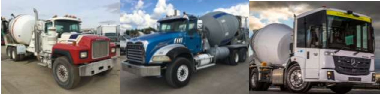
Left: 1970s cement truck. Middle: Typical late 2010s low-visibility truck, soon to be banned in London UK. Right: Modern truck with high-visibility cabin, camera sensor systems, & side guards.

We recommend that the City of Toronto request the Ontario government (in conjunction with the federal government) to mandate safety features designed to protect vulnerable road users to be the required standard for all vehicles