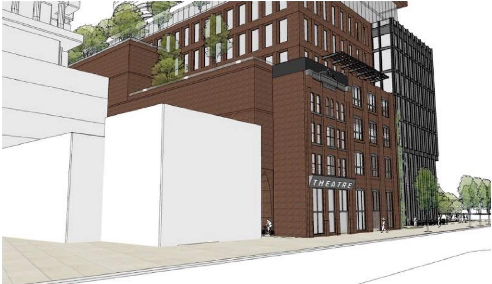
Render of Proposal