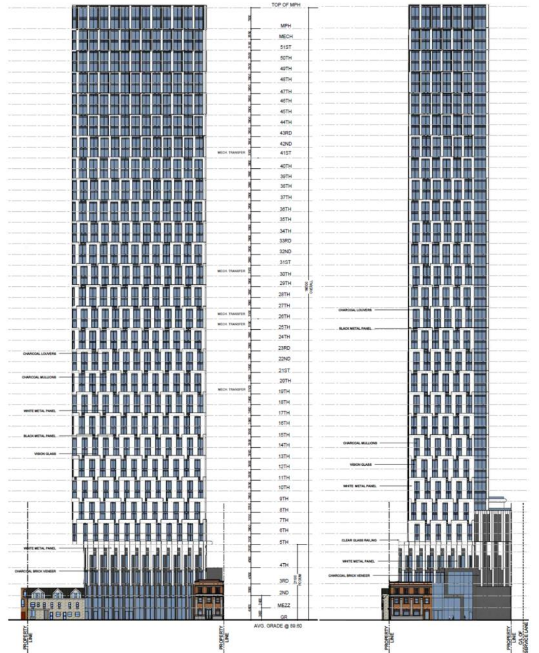
Full East Elevation