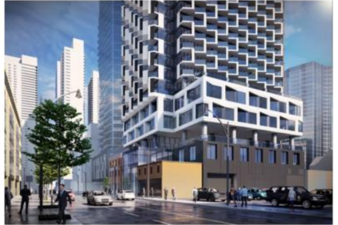
Architectural Renderings - Original Submission