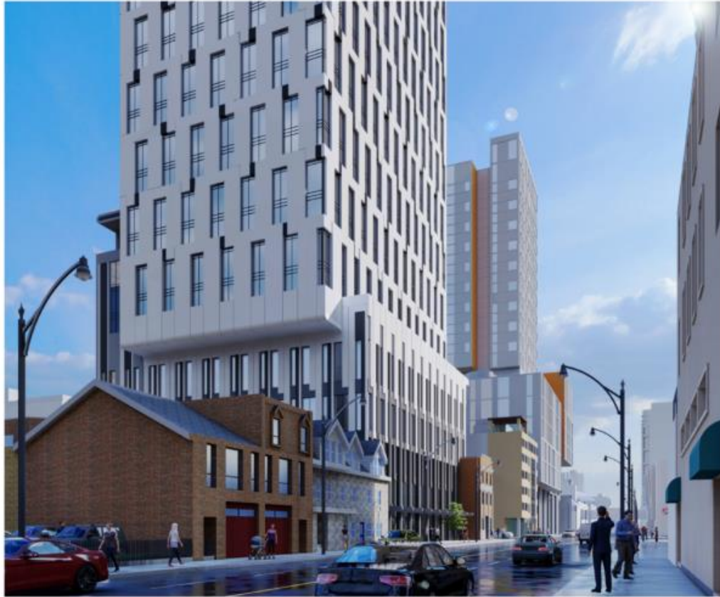
Architectural Rendering - Looking North up Church Street