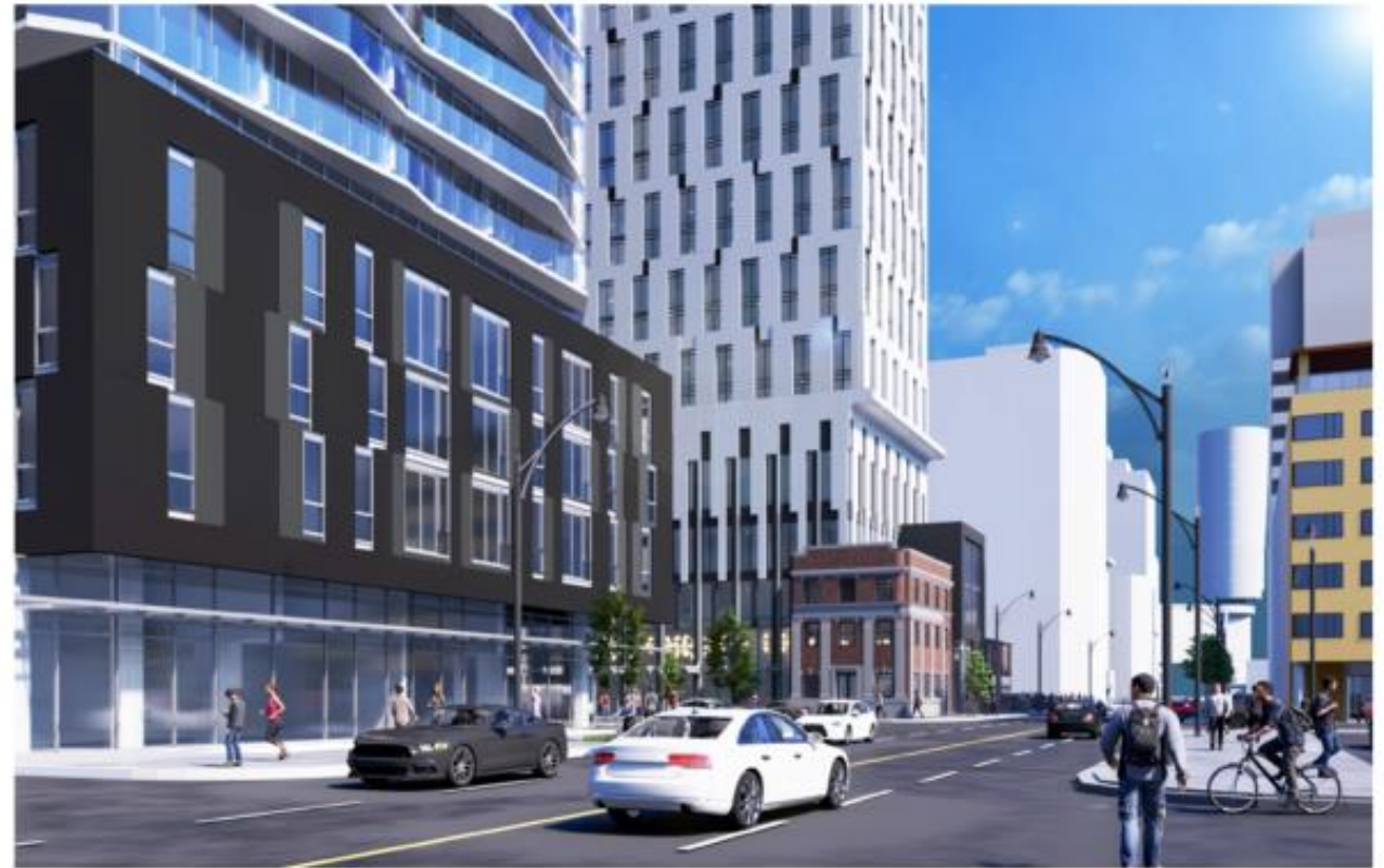
Architectural Rendering - Looking West across Dundas Street