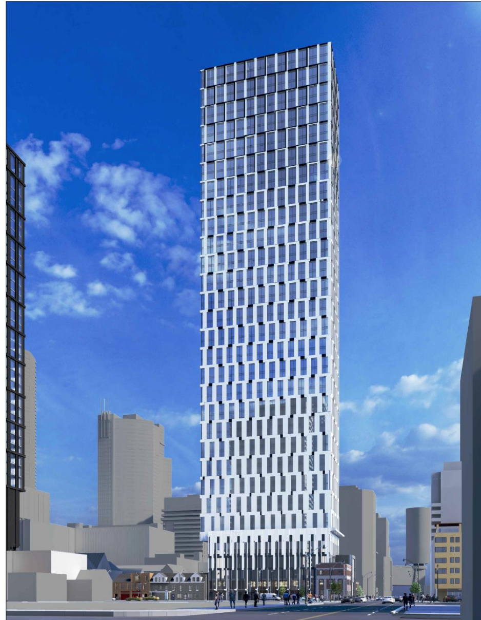
ARCHITECTURAL VISUALIZATION - VIEW LOOKING WEST

Project Rendering (Looking West along Dundas Street)