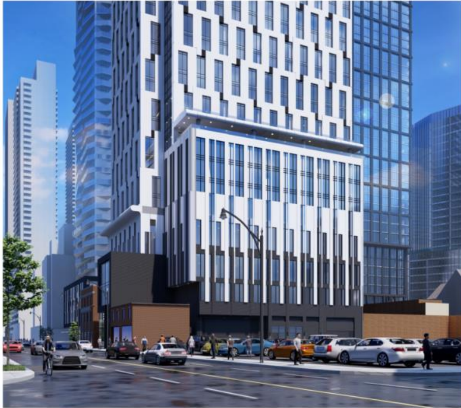
Architectural Rendering - Looking East across Dundas Street