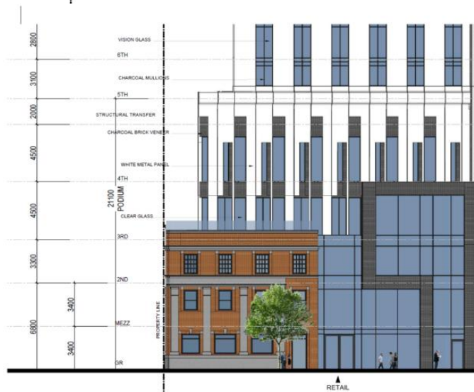
North Elevation Lower Level Detail