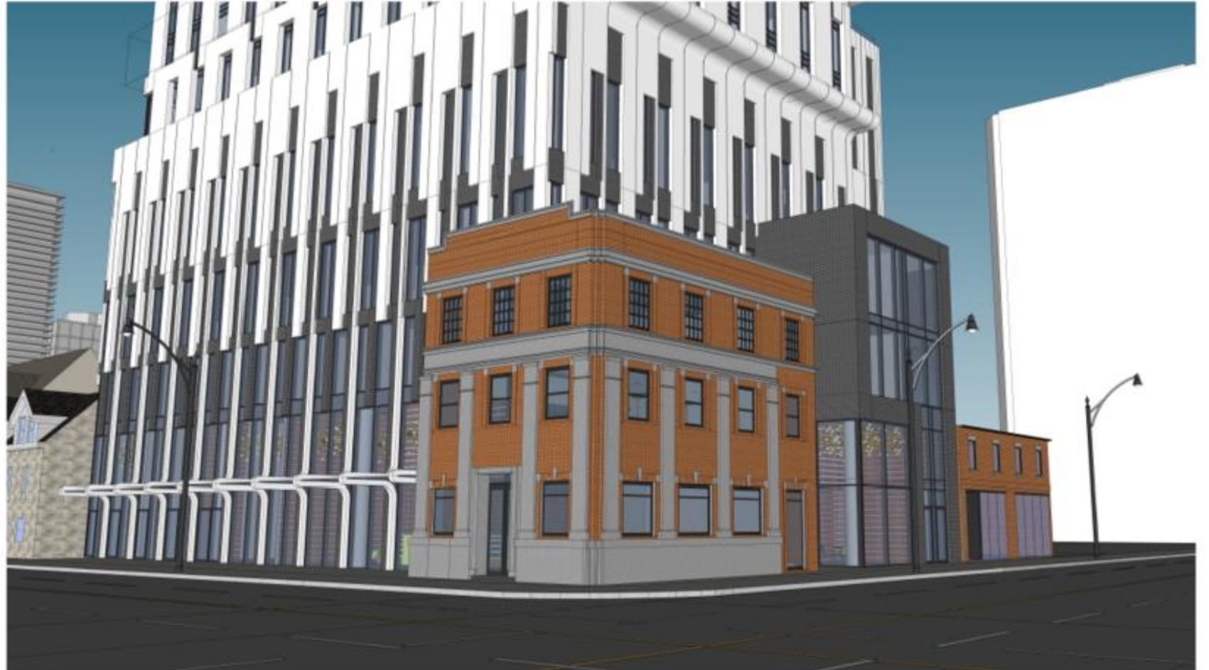
Architectural Rendering - Looking South West across the intersection of Church and Dundas Streets