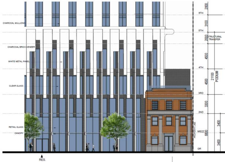
East Elevation - Lower Level Detail