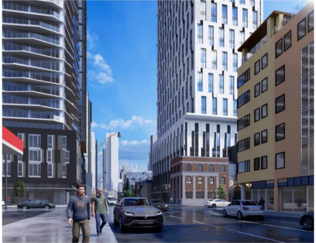
Architectural Rendering - Looking South down Church Street