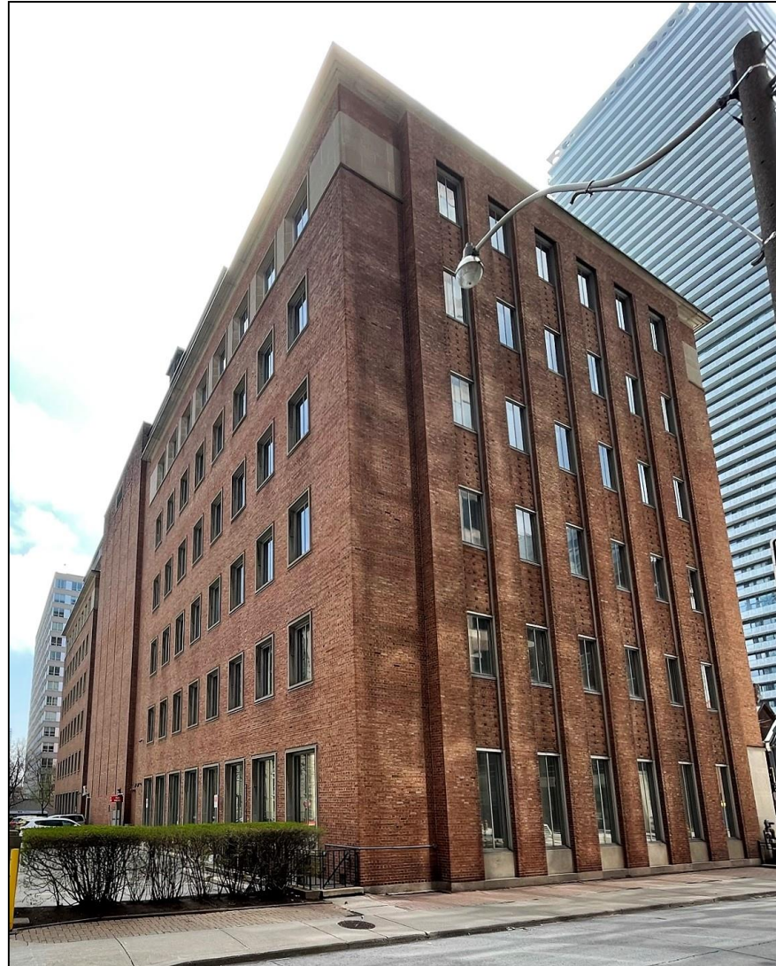
625 Church Street, northeast façade (Heritage Planning, 2021)