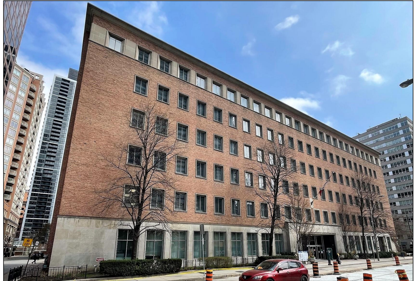
625 Church Street, principal (west) façade (Heritage Planning, 2021)