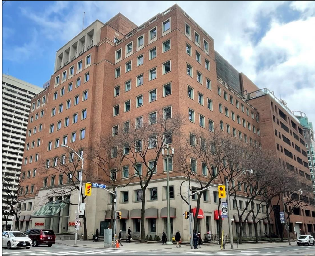
333 Bloor Street East, Confederation Life Insurance Company Building, 1956