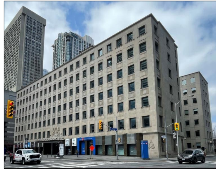
120 Bloor Street East, Crown Life Insurance Building, 1953 (Heritage Planning, 2021)