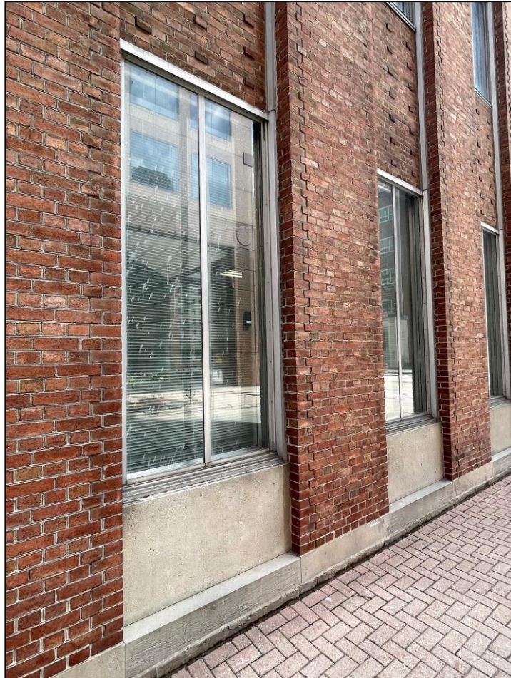
625 Church Street, north façade, detail of brickwork typical on side facades (Heritage Planning, 2021)