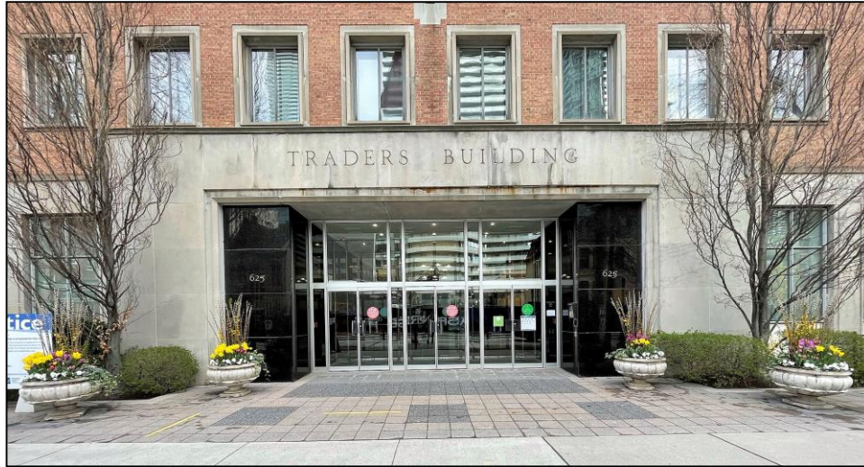
625 Church Street, primary entrance on the principal (west) façade (Heritage Planning, 2021)