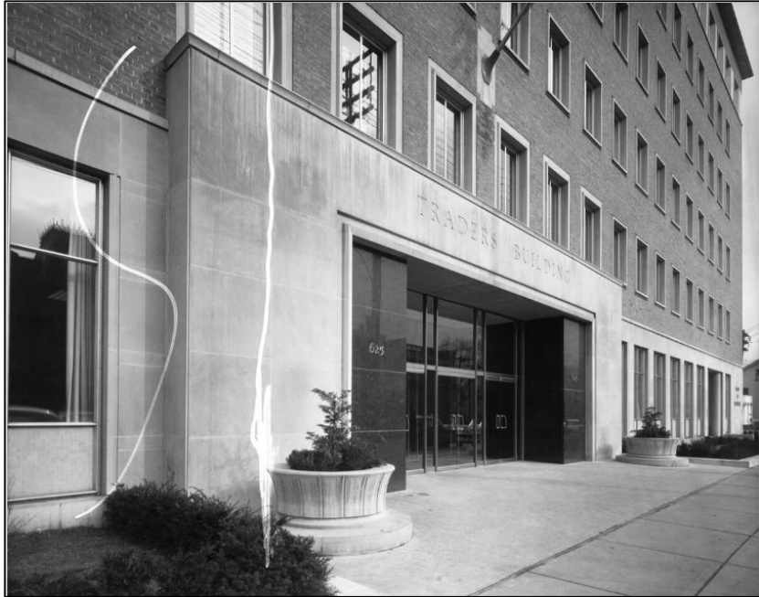
625 Church Street, west façade, entrance detail 1957 (Canadian Architectural Archives, University of Calgary)