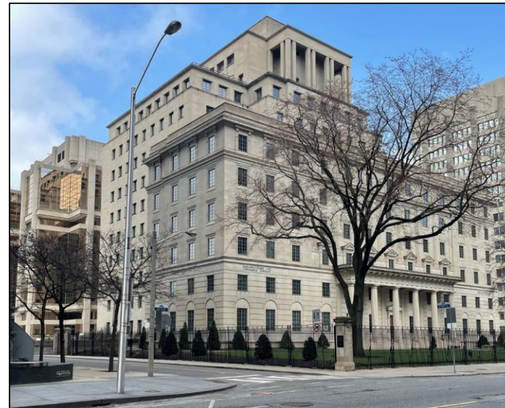
200 Bloor Street East, Manufacturers Life Insurance Building, 1923 with additions in 1953, 1983 (Heritage Planning, 2021)