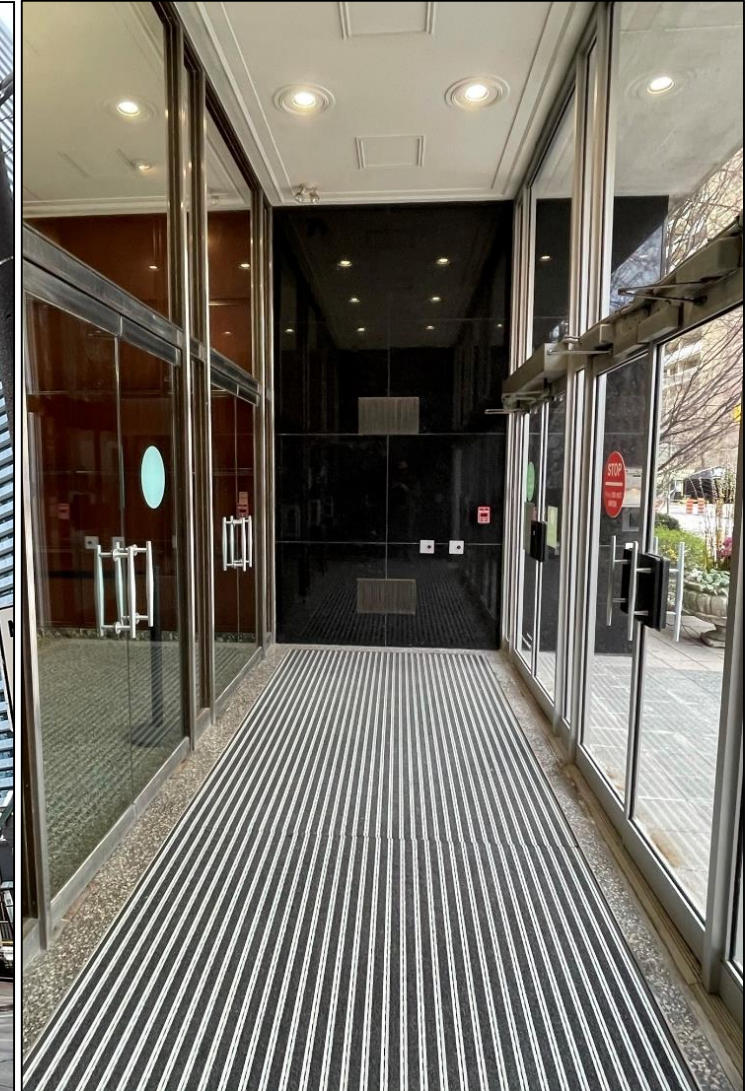
625 Church Street, interior vestibule of the primary entrance showing the return wall of the black granite panelling (Heritage Planning, 2021)