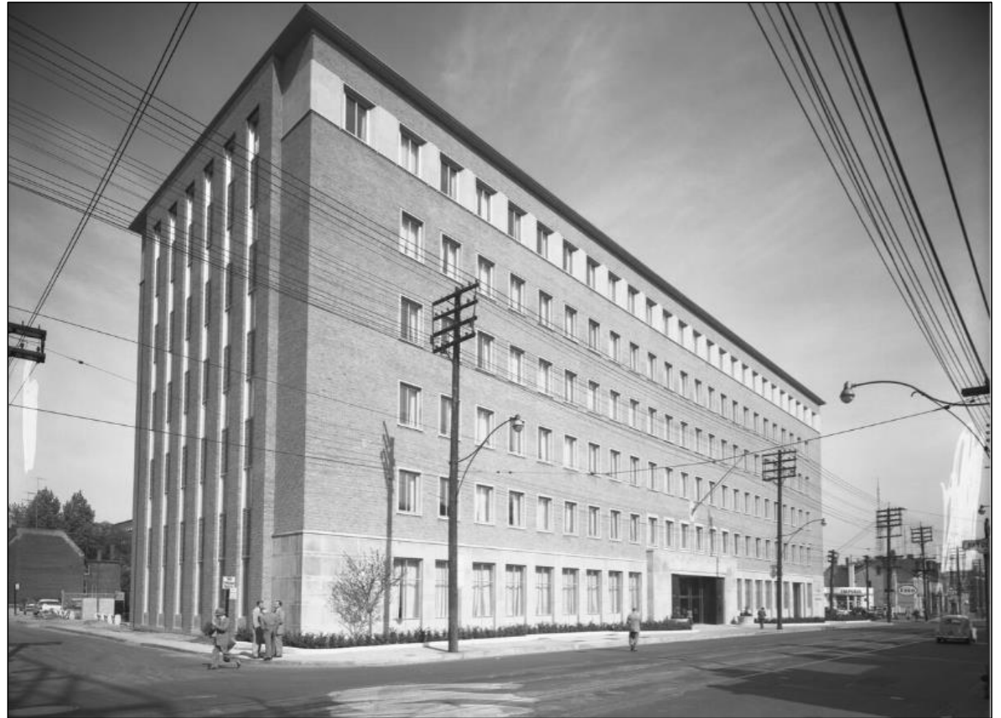
625 Church Street, west façade, 1957