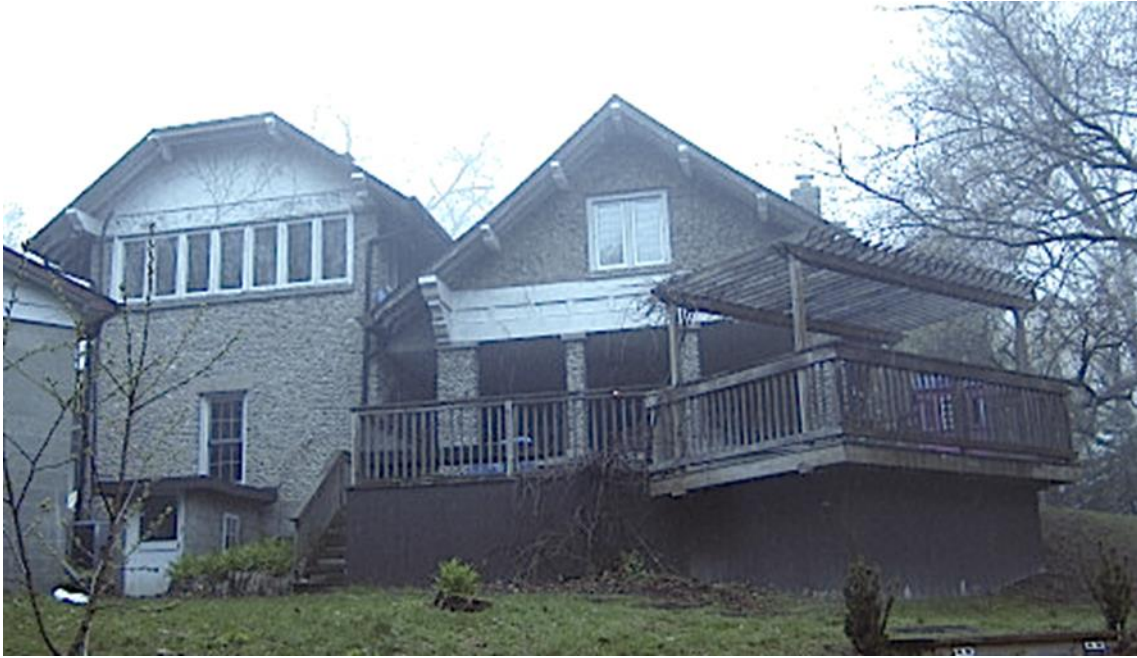
Photograph of the south-east side of the house facing the garden (above) and revealing the slope in the land.