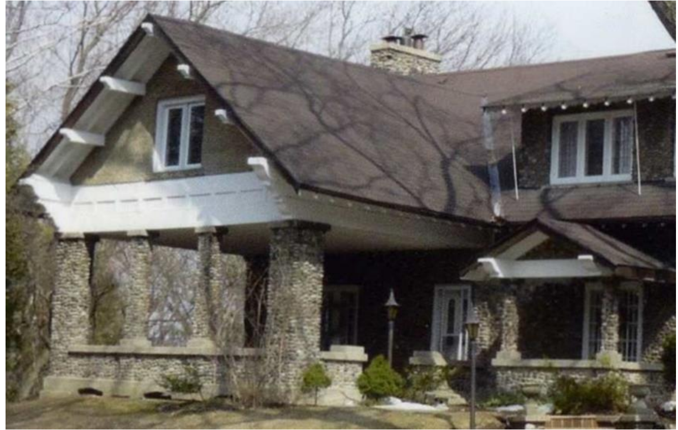
Photograph (right) showing the craftsmanship in the detailing of the rafters and beams supporting the roofs, the pebble cladding and the use of concrete in the base, sills, lintels and other elements