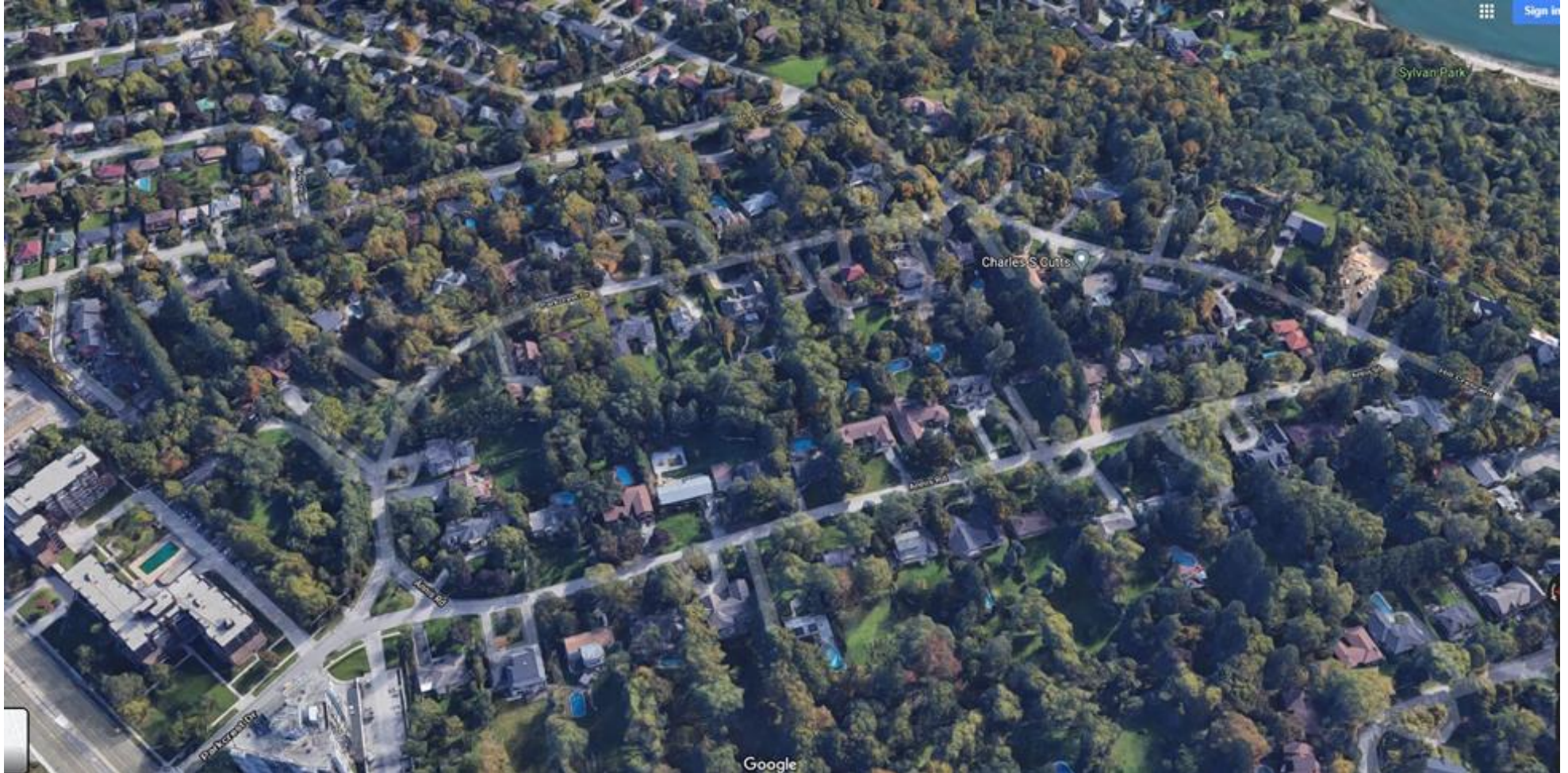
Aerial View of Park Hill, showing the street layout, mature tree canopy, with Kingston Road at the lower left and the Scarborough Bluffs and lake shoreline at the upper right (Google Maps, 2021)