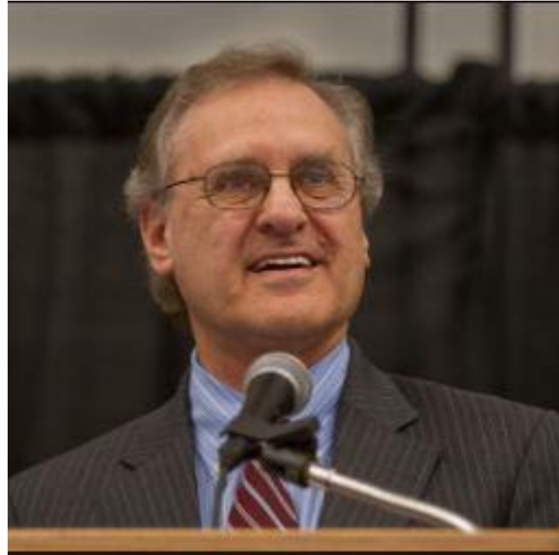
Owners of the property at 19 Parkcrest Drive from 1970-1975: Michele Landsberg, OC and Stephen Lewis, CC