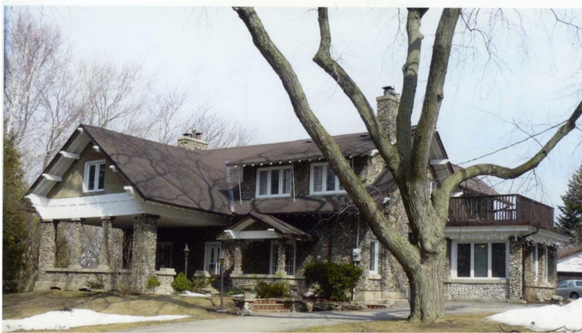
Photograph of the principal (north-west) and side (south-west) elevations of 19 Parkcrest Drive