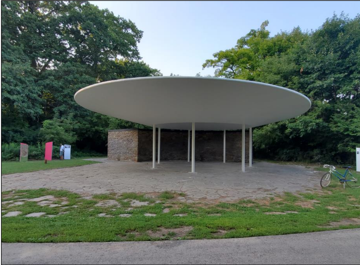
85 Stephen Drive, view of the South Humber Park Pavilion looking north during The Oculus Revitalization project (Heritage Planning, 2021)