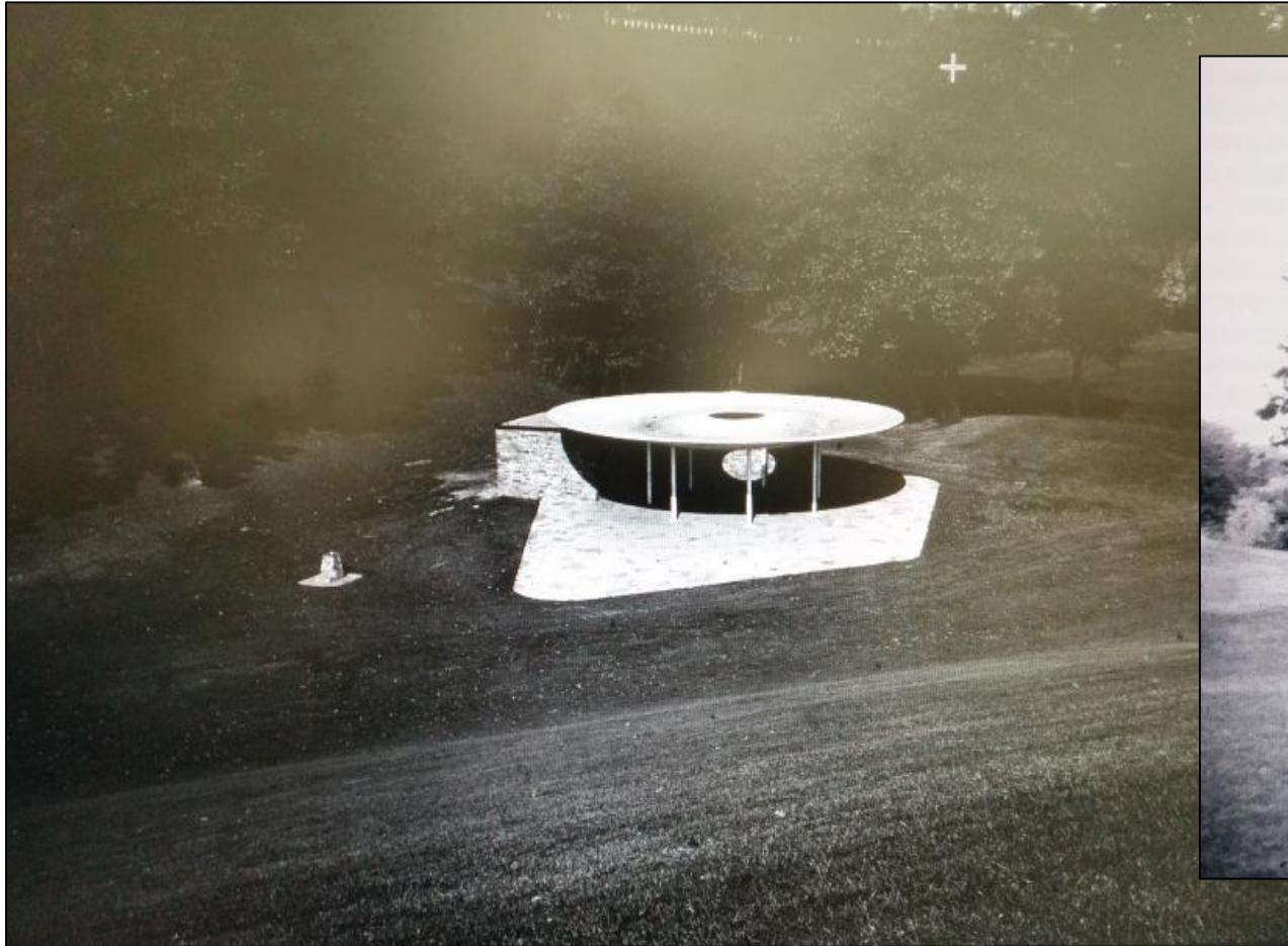
Looking north at the South Humber Park Pavilion in 1961