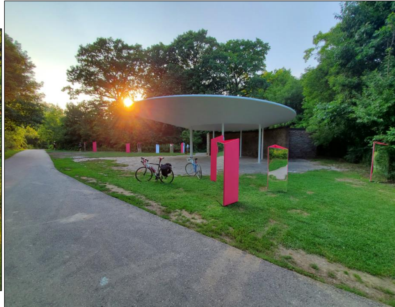
View of the South Humber Park Pavilion walking west on the Humber River Recreational Trail (Heritage Planning, 2021)