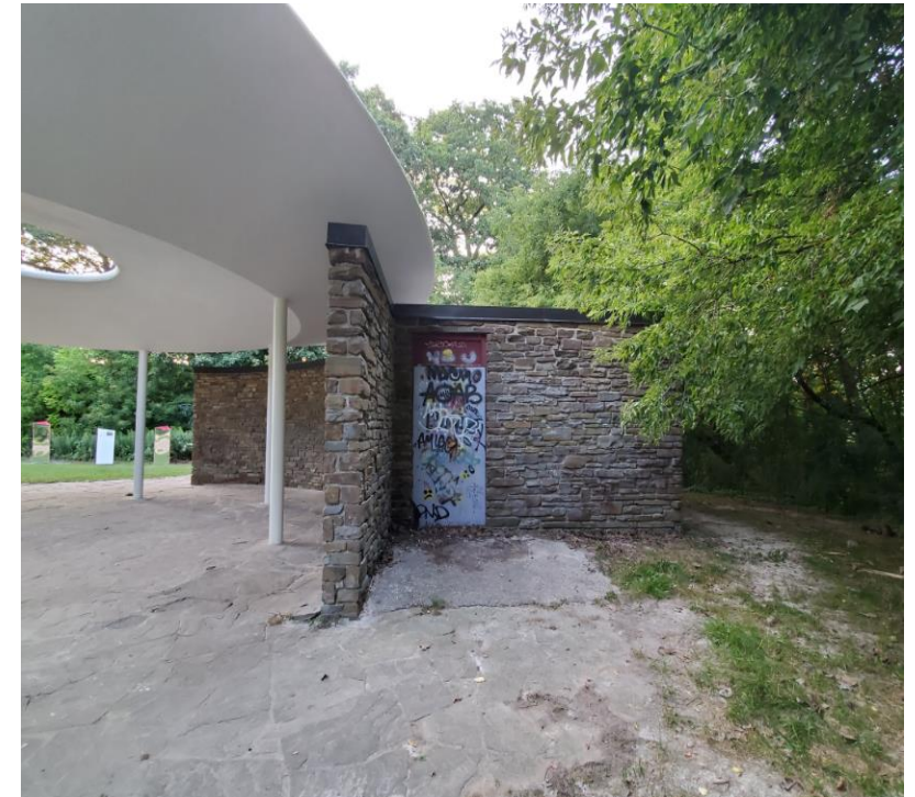
Detail of the women's washroom entrance in the side (east) wall (Heritage Planning, 2021)