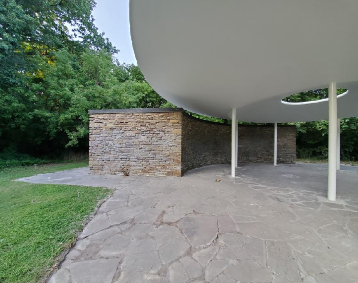
Detail of the washroom structure looking northeast (Heritage Planning, 2021)