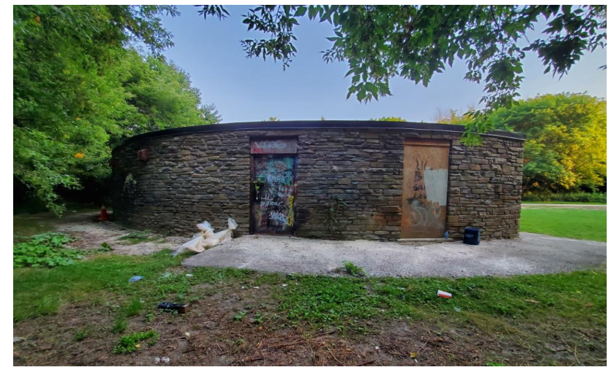
Detail of the men's washroom entrance in the rear (north) elevation (Heritage Planning, 2021)