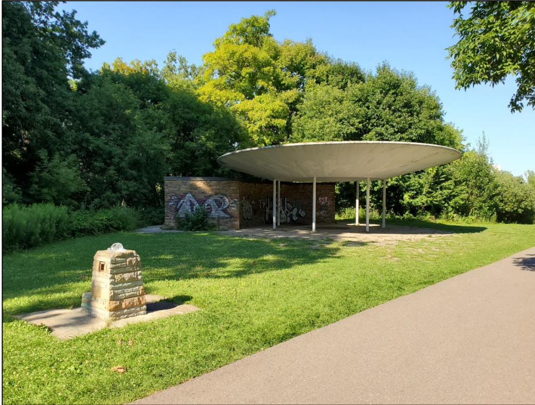
85 Stephen Drive, view of the South Humber Park Pavilion looking northeast