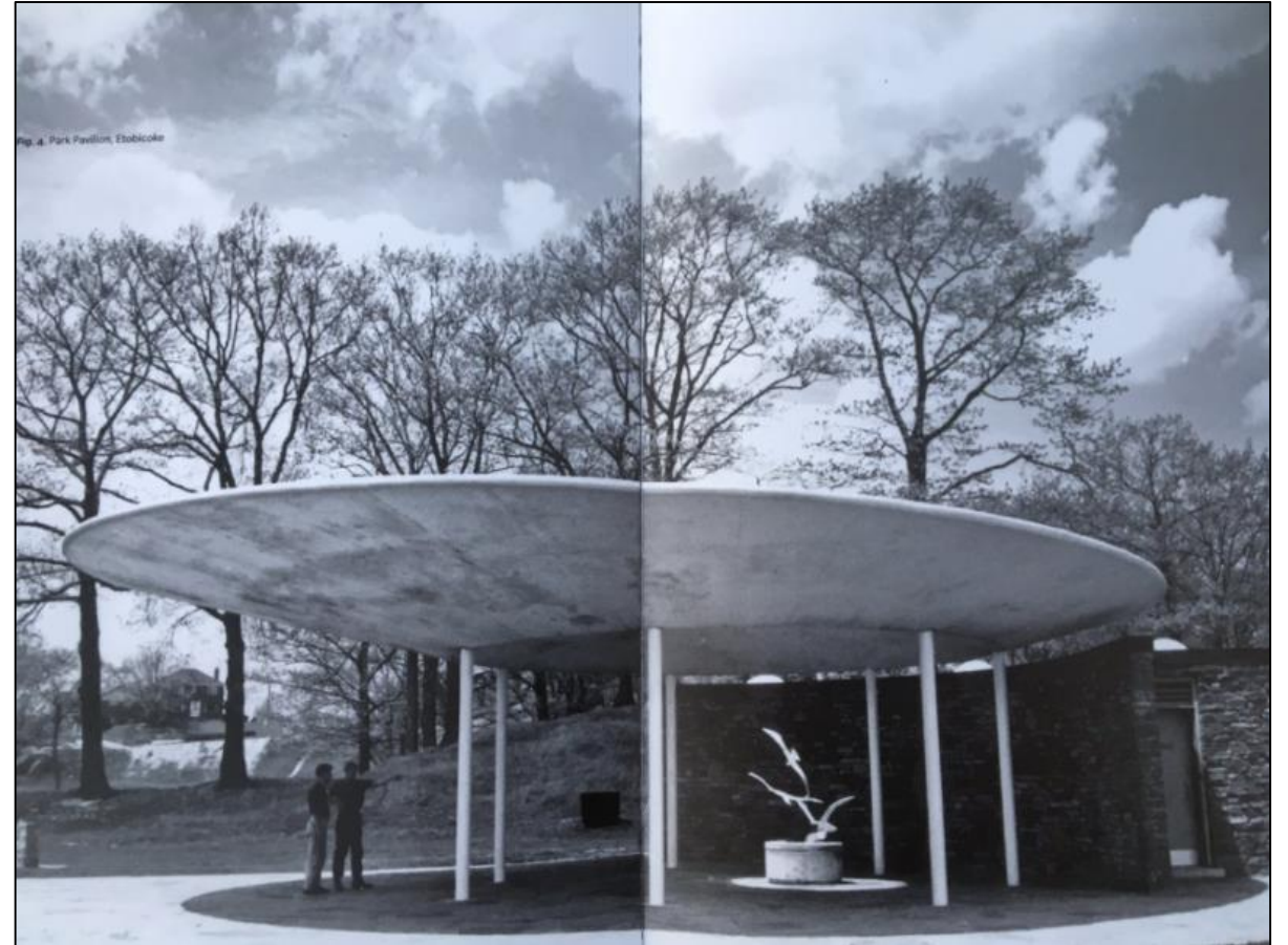
Detail of the birds in flight sculpture that once sat below the oculus