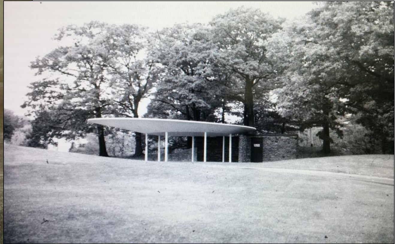
Looking westward at the South Humber Park Pavilion in c.1955-85 (Brown + Storey Architects Inc. South Humber Park Pavilion Heritage Evaluation Report , 2019)