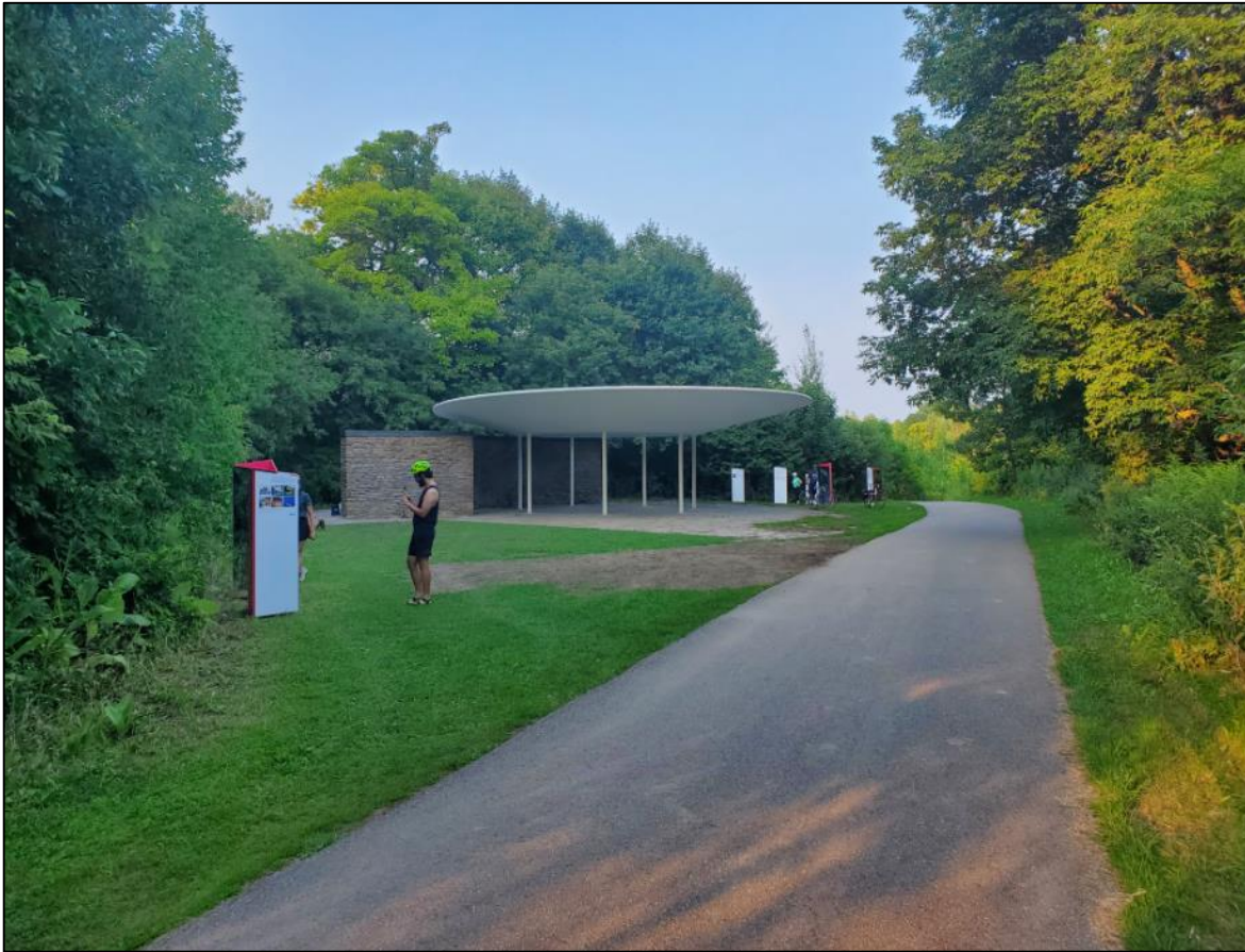
View of the South Humber Park Pavilion walking east on the Humber River Recreational Trail