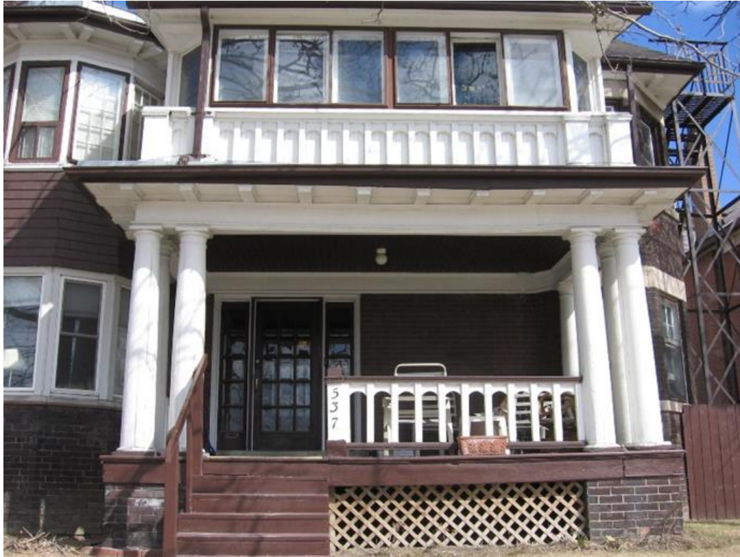
Above: Principal, west façade of the Scott house, showing the details of the verandah, 2009