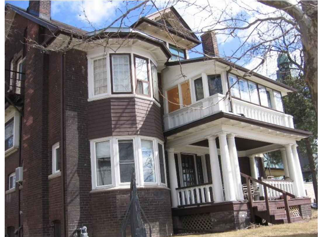
Above: Principal, west elevation of the Scott house, showing the various materials and the details of the eaves and verandah, 2009