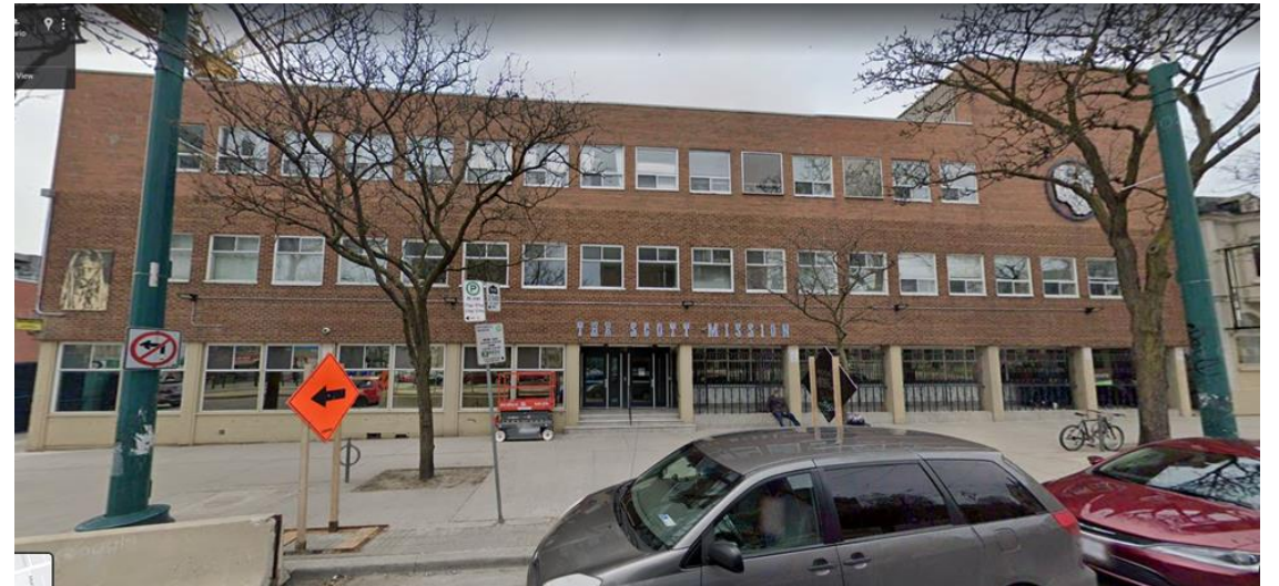
Scott Mission, 1961, 502 Spadina Avenue