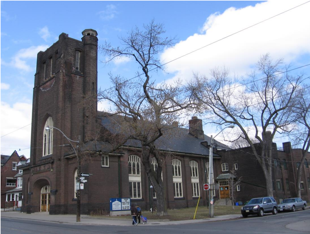
St John's Presbyterian Church, 1907, 415 Broadview Avenue