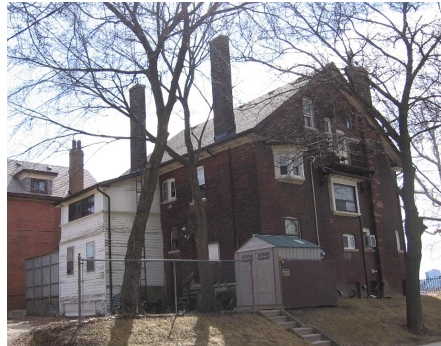
Above: View of the principal, west and side, south facades of the Scott House, 2009 Top Right: View of the side, north and principal west facades of the Scott house, 2009 Bottom Left: View of the side, north and rear, east facades of the Scott house, 2009