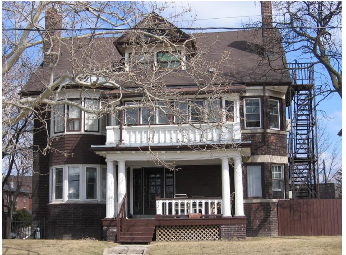
Above: Current view of the principal, west façade of the Scott house at 537 Broadview Avenue with scaffolding Top Right: View of the principal, west façade of the Scott house at 537 Broadview Avenue, pre-scaffolding, 2009