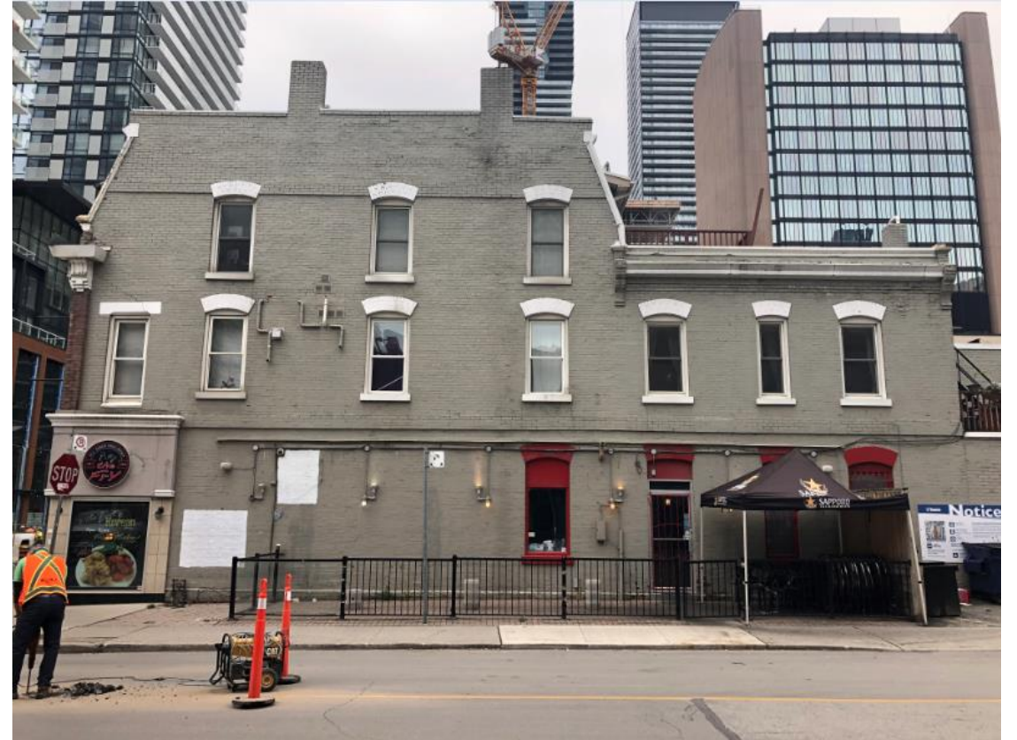
Current photographs of the principal (east) and secondary (north) elevations of 526 Yonge Street. [Heritage Planning, 2021]