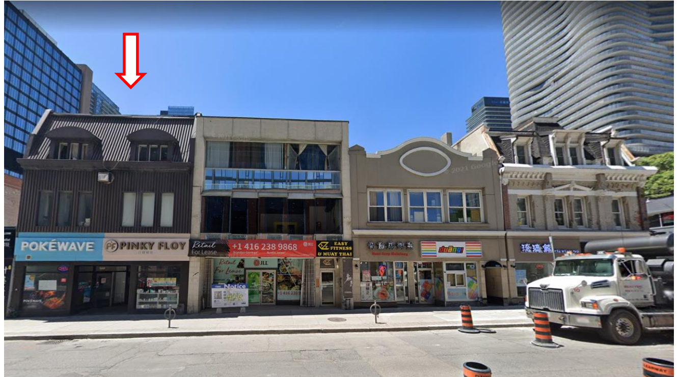
Context view looking west from Yonge Street, showing the property at 516 Yonge Street