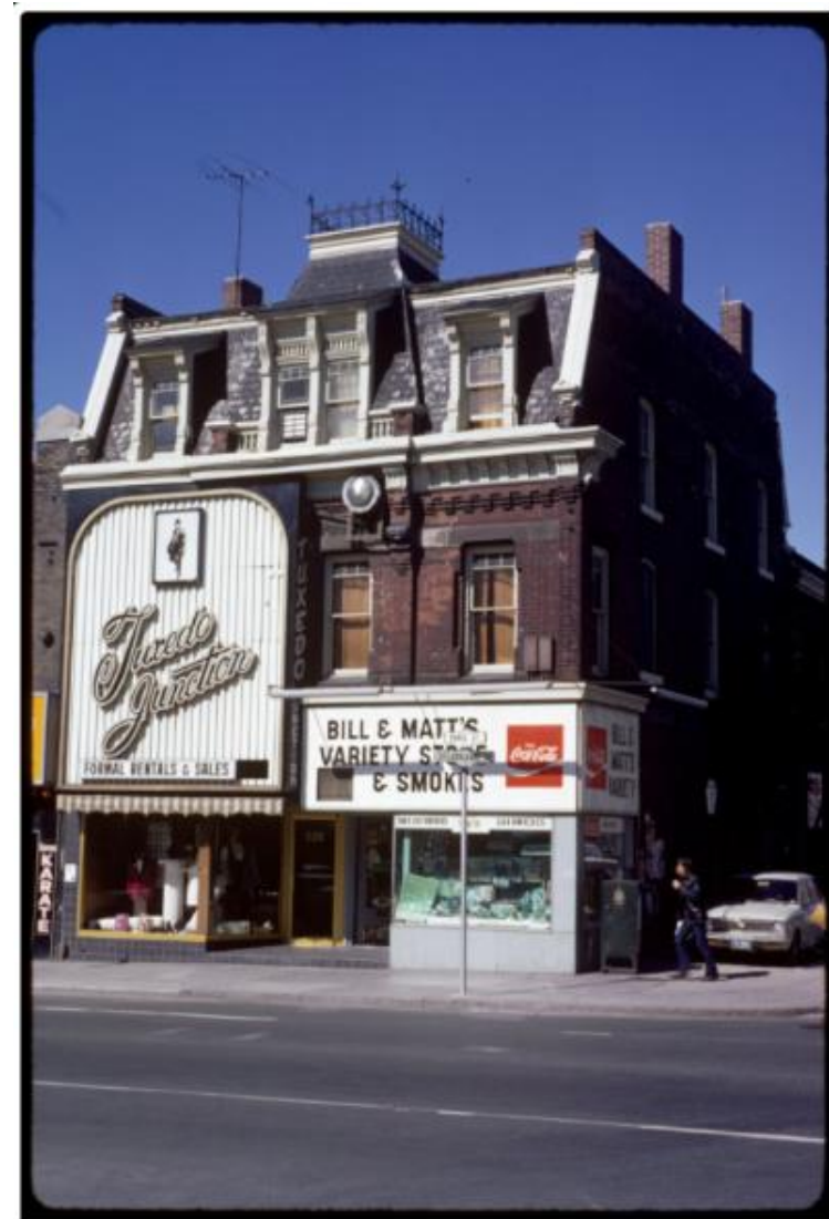
City of Toronto Archives, Fonds 1826, File 2, Item 69