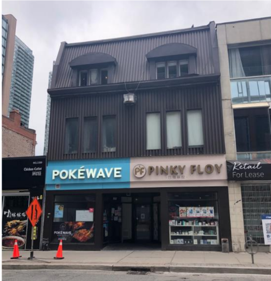
Current photograph looking west, showing the principal (east) elevation of the building at 516 Yonge Street.