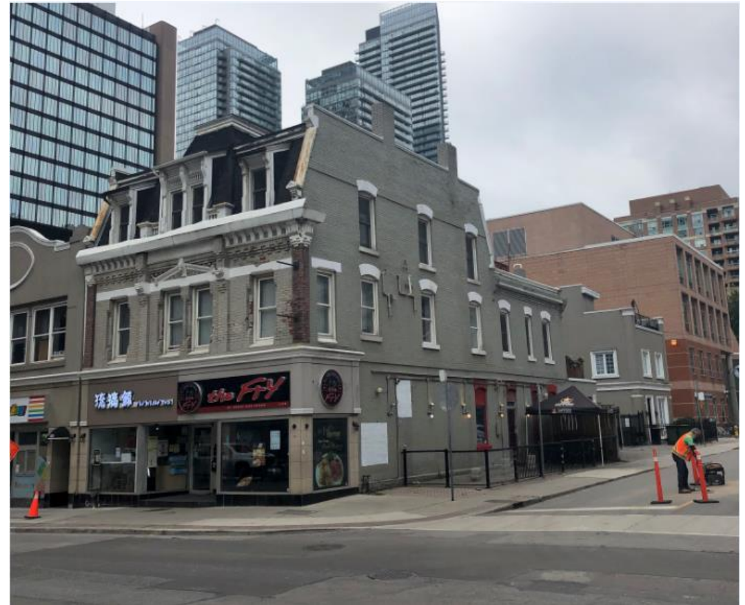
Current photographs of the properties at 516 (left) and 526 (right) Yonge Street. [Heritage Planning, 2021]