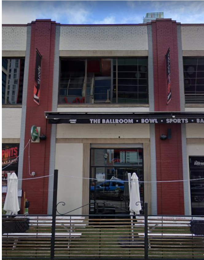
Top right: 1935 ad for the new Handy and Harman of Canada Ltd building at 241 Richmond Street West

Right: current photo of 241 Richmond Street West showing the original main entrance fronting John Street with its cast stone fluted door jamb detailing