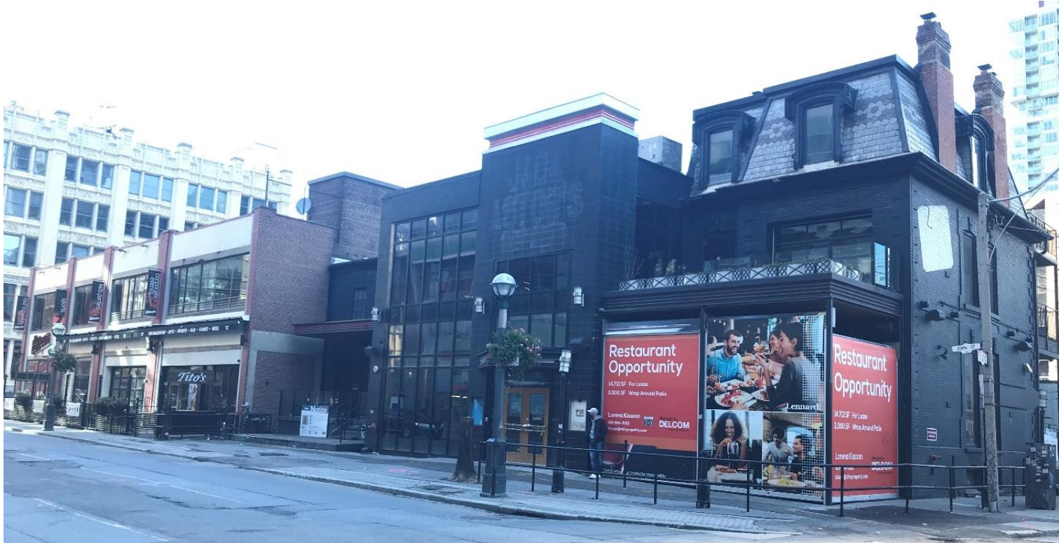
Above: Current contextual photo of the site looking northeast from John and Nelson Streets.