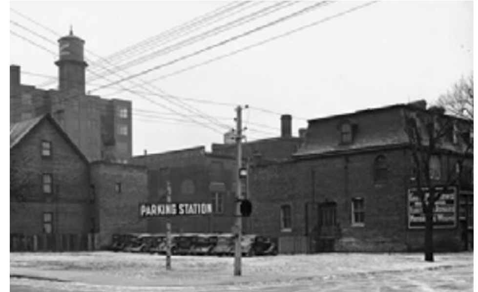
Left: 1893 Goad's Historical Map showing the five detached house-form buildings on the east side of John Street, including 133 John.