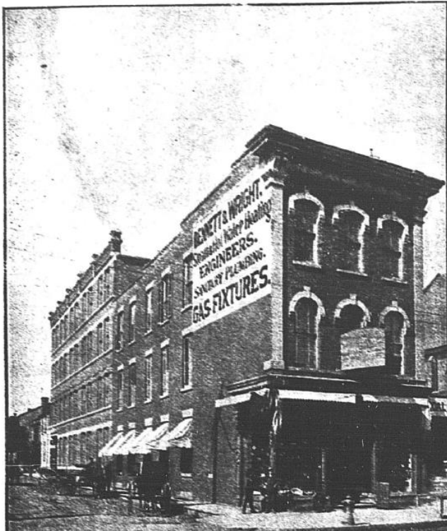
1892 advertisement in The Globe showing the Bennett & Wright Co. factory and stockroom at the northeast corner of Queen and Dalhousie streets

The premises have during the present season been almost doubled in capacity, and now there is none in Canada better equipped. Of course the operations de-