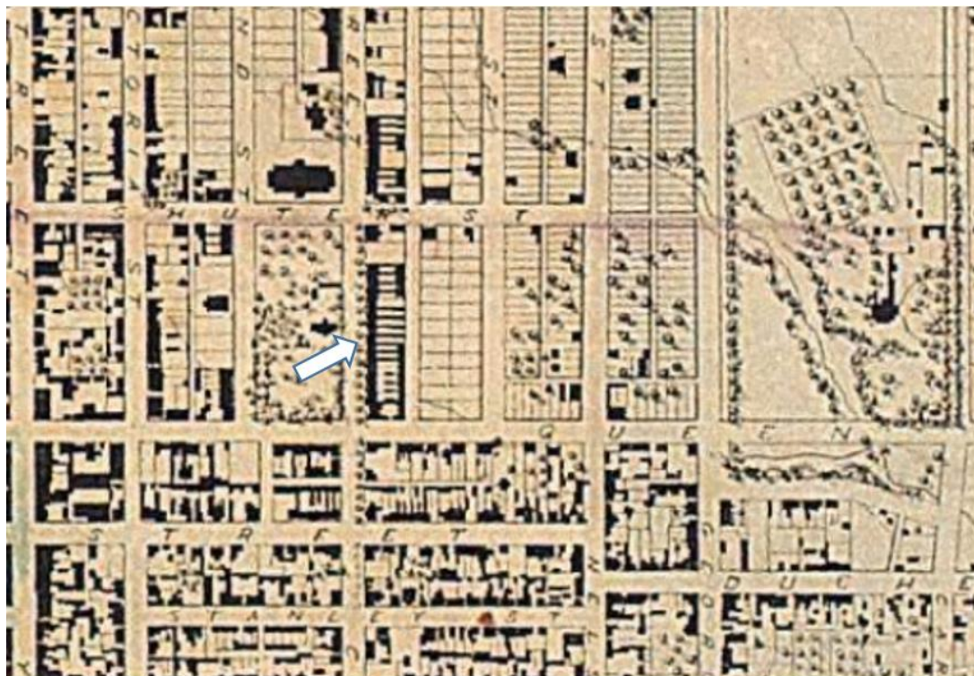
1851 Fleming Topographical Plan of the City of Toronto, showing the approximate location of 147 Church Street. At this time, the subject property was part of a row of houses on the east side of Church Street. (Ng)