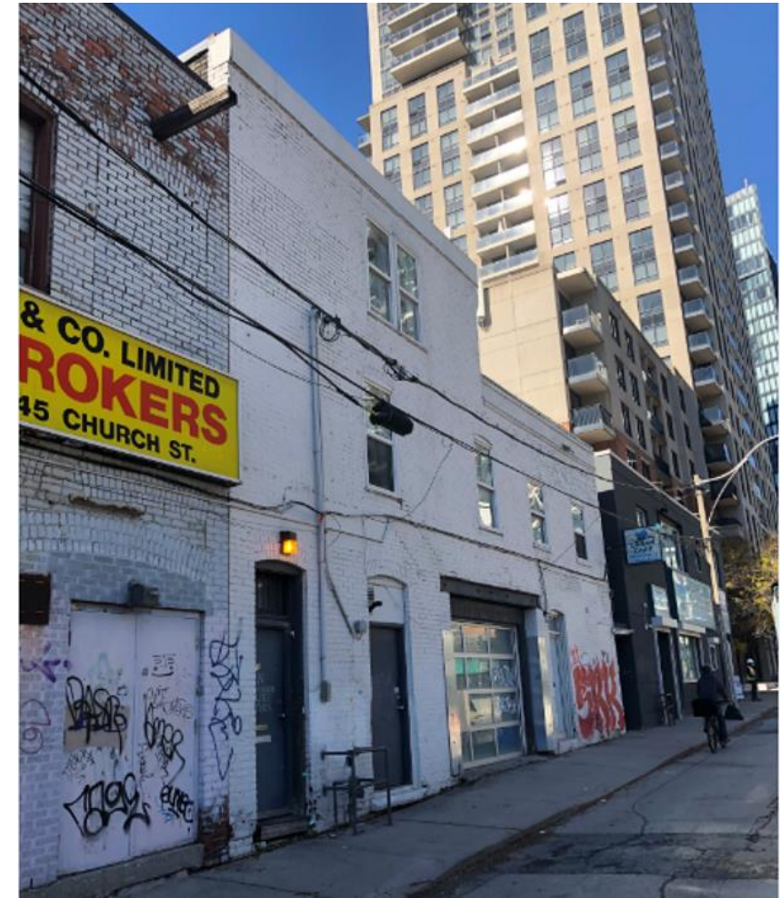
Current photographs of the west (left) and east (right) elevations of the building at 147 Church Street. (Heritage Planning, 2021)