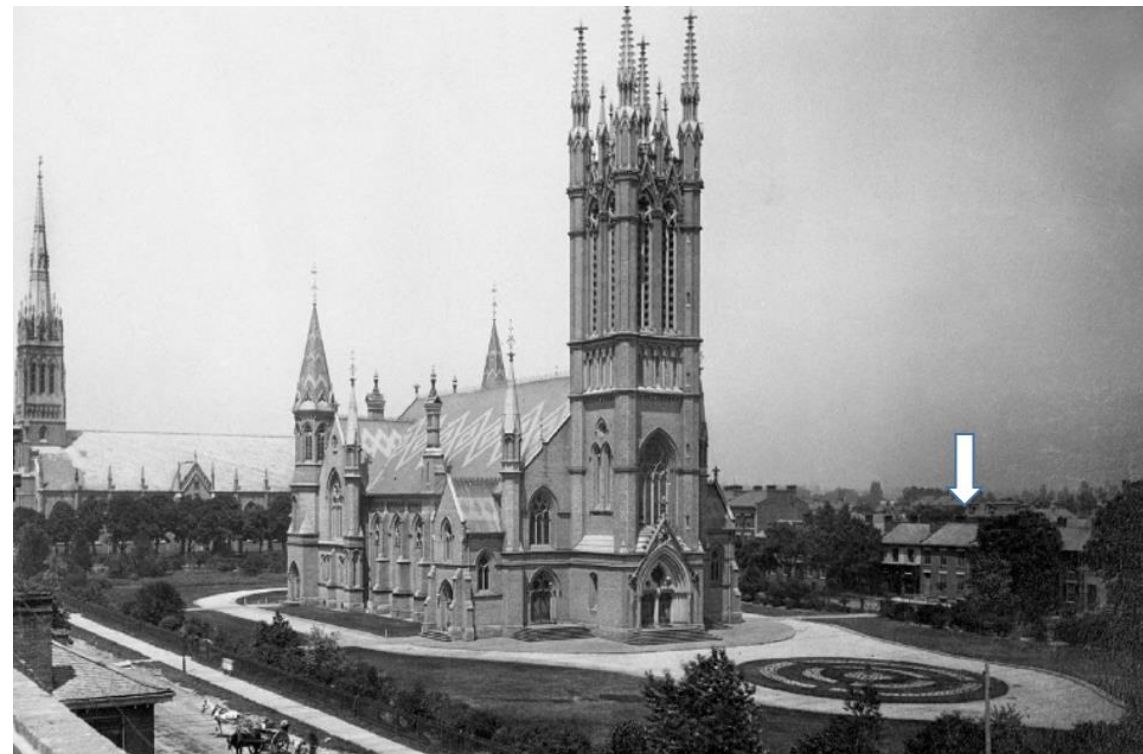
1870s archival photograph of the Metropolitan United Church at Queen and Church streets, with the approximate location of the former row house at 147 Church Street indicated on the right