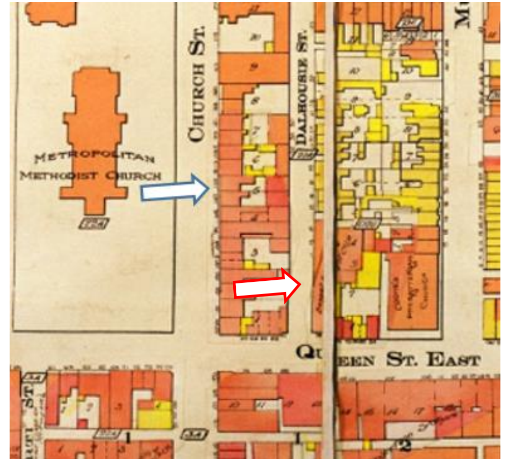
1913 Goad's Map, showing the location of 147 Church Street (blue arrow) in relation to the Bennett & Wright stockroom at the northeast corner of Church and Dalhousie streets (red arrow) (City of Toronto Archives [CTA])