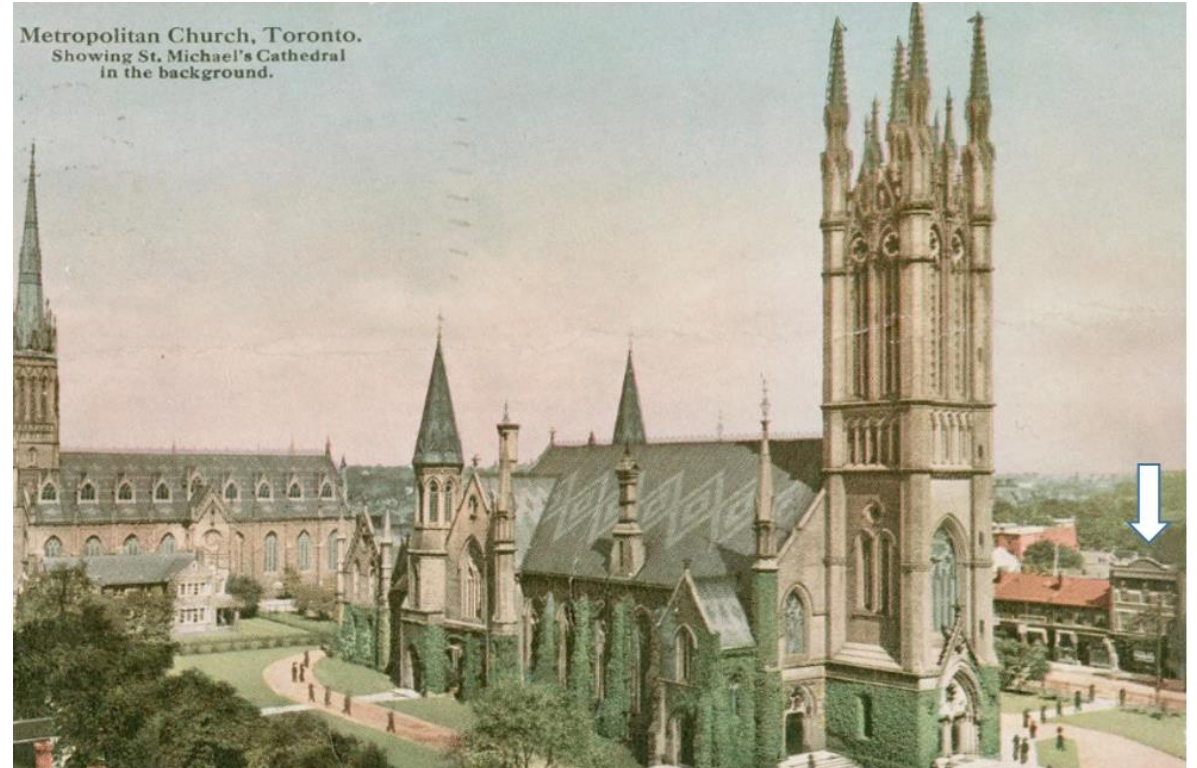
1914 archival photograph of the Metropolitan Church and St. Michael's Cathedral, with 147 Church Street shown on the right