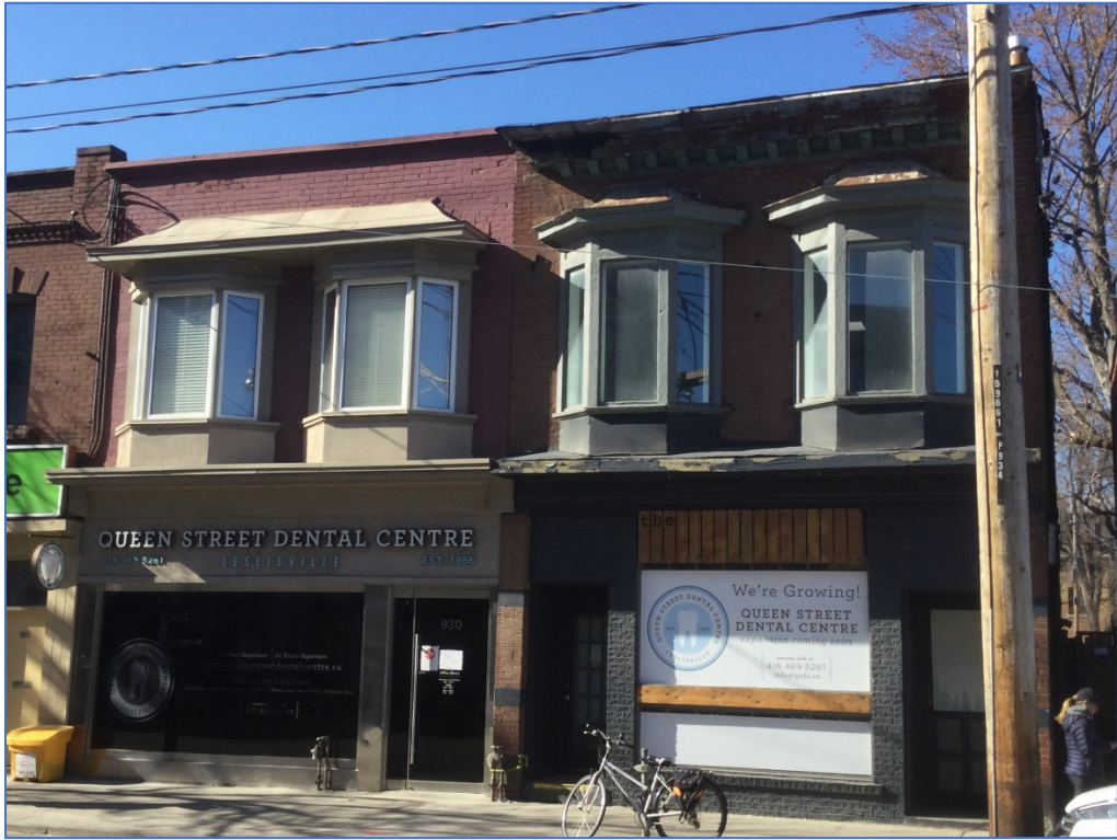
930-932 Queen Street East