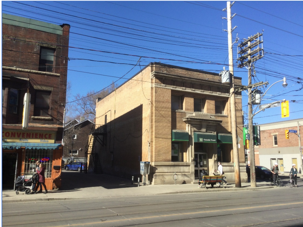
904 Queen Street East