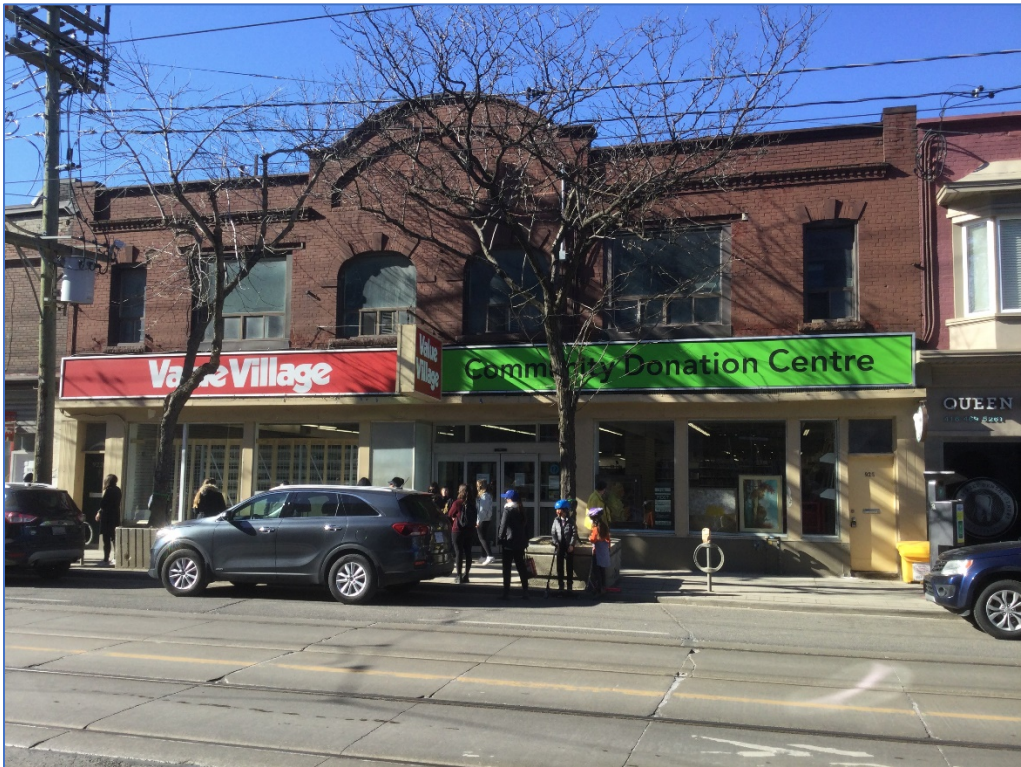
924-926 Queen Street East