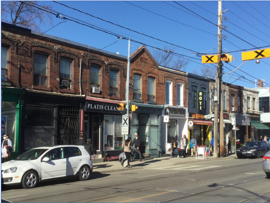
940-954 Queen Street East