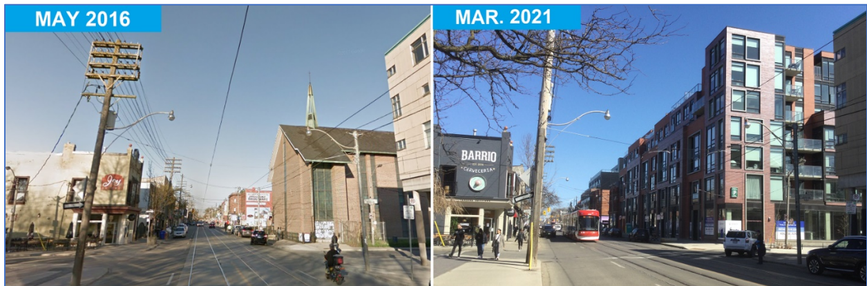
827 Queen St. E - Woodgreen Church redevelopment into 118 condos & new Red Door Family Shelter

As you will see from the attached maps and photographs – the majority of the 54 commercial buildings on Queen Street East that staff have provided in your report are wholly unremarkable and exist in similar forms by the hundreds all-over various parts of Toronto and East York. In addition, almost all of the 54 commercial buildings in Leslieville that have been suggested for bulk-inclusion into the Heritage Register are within the 500 and 800 metre Major Transit Service Area zones around the new Ontario Line station that Metrolinx is developing at 799 Queen Street East.