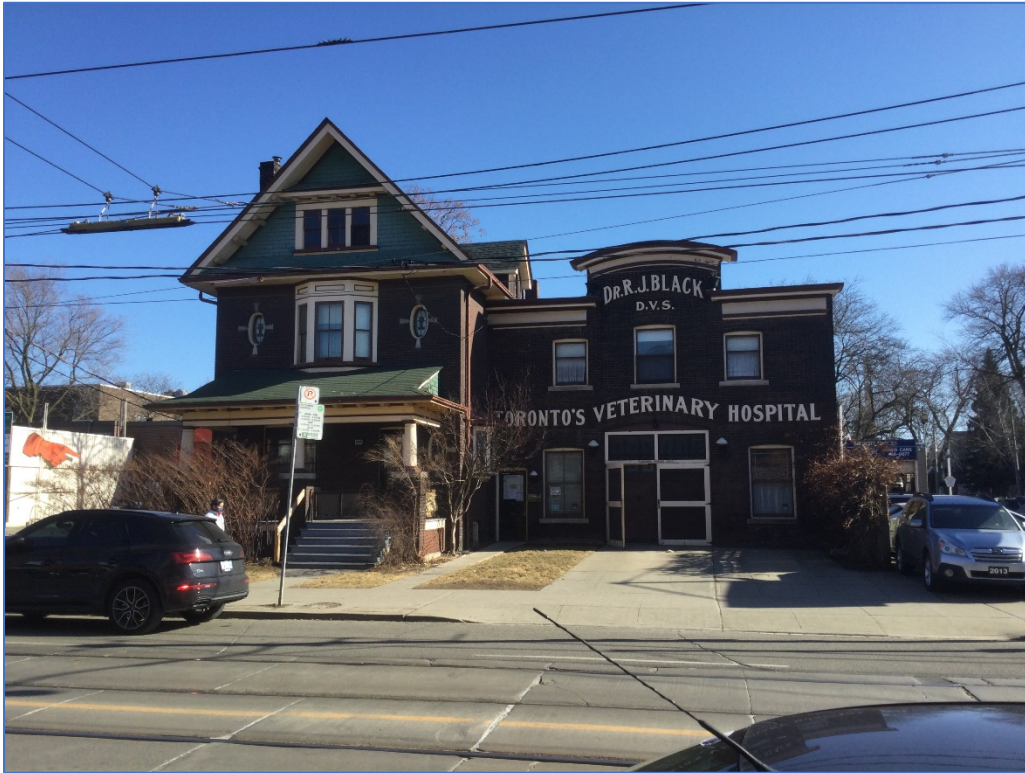
923 Queen Street East