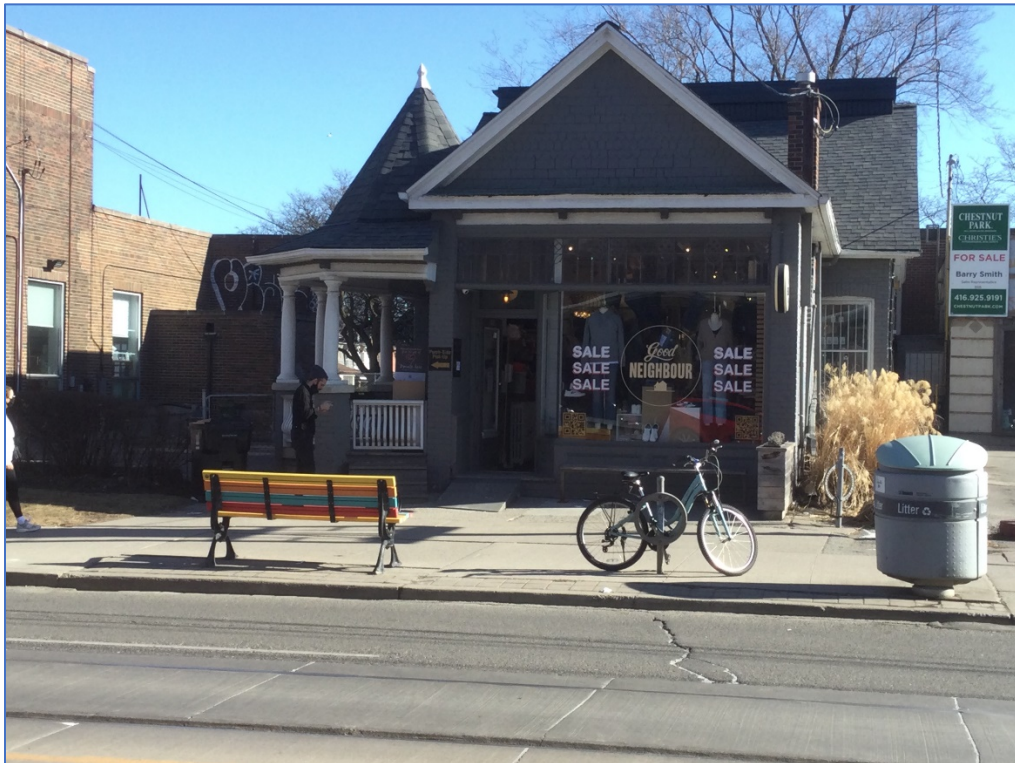
935 Queen Street East