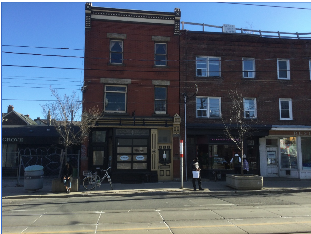
993 Queen Street East