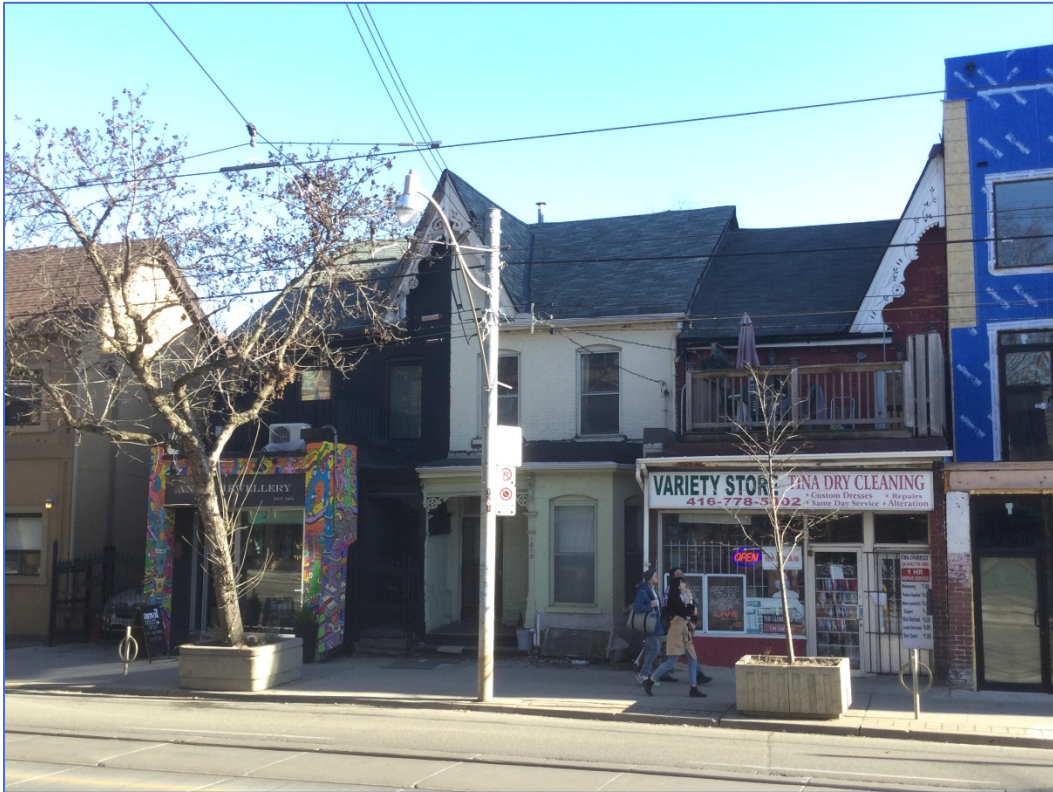
1011-1015 Queen Street East