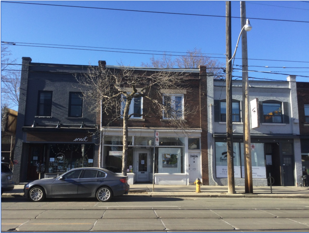
1142 Queen Street East