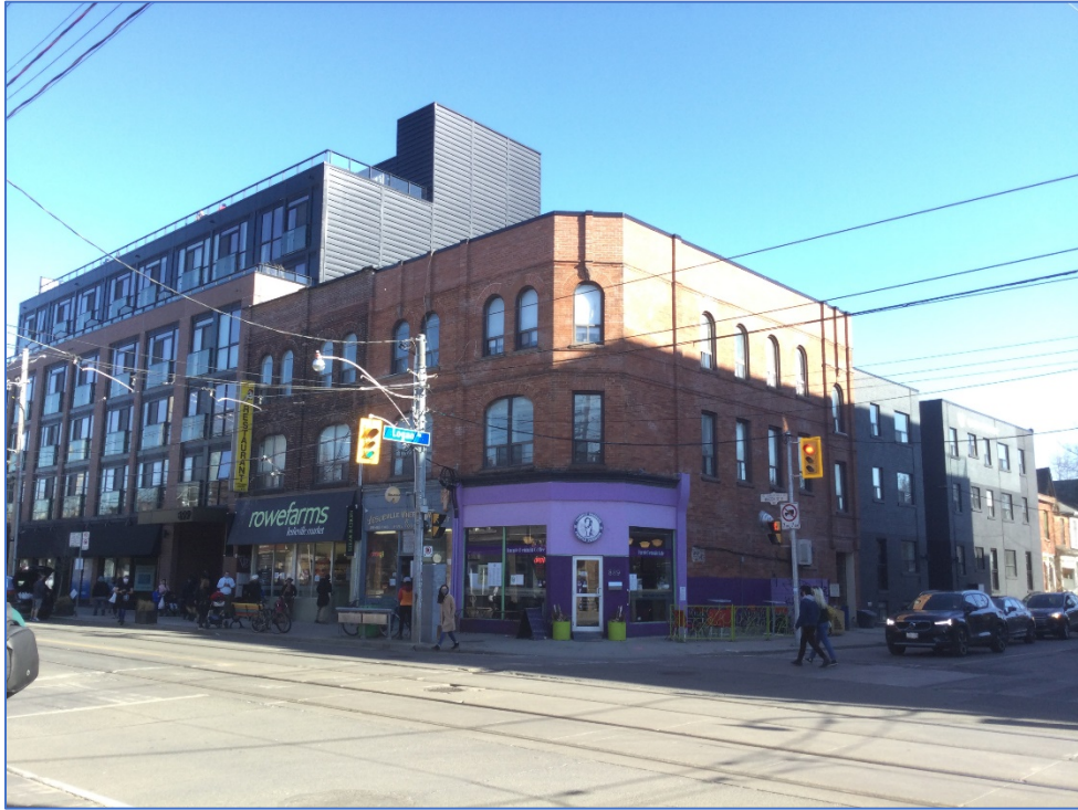
889-893 Queen Street East