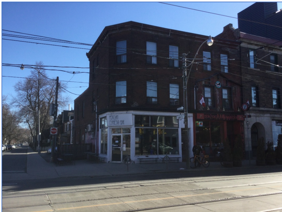
913-915 Queen Street East