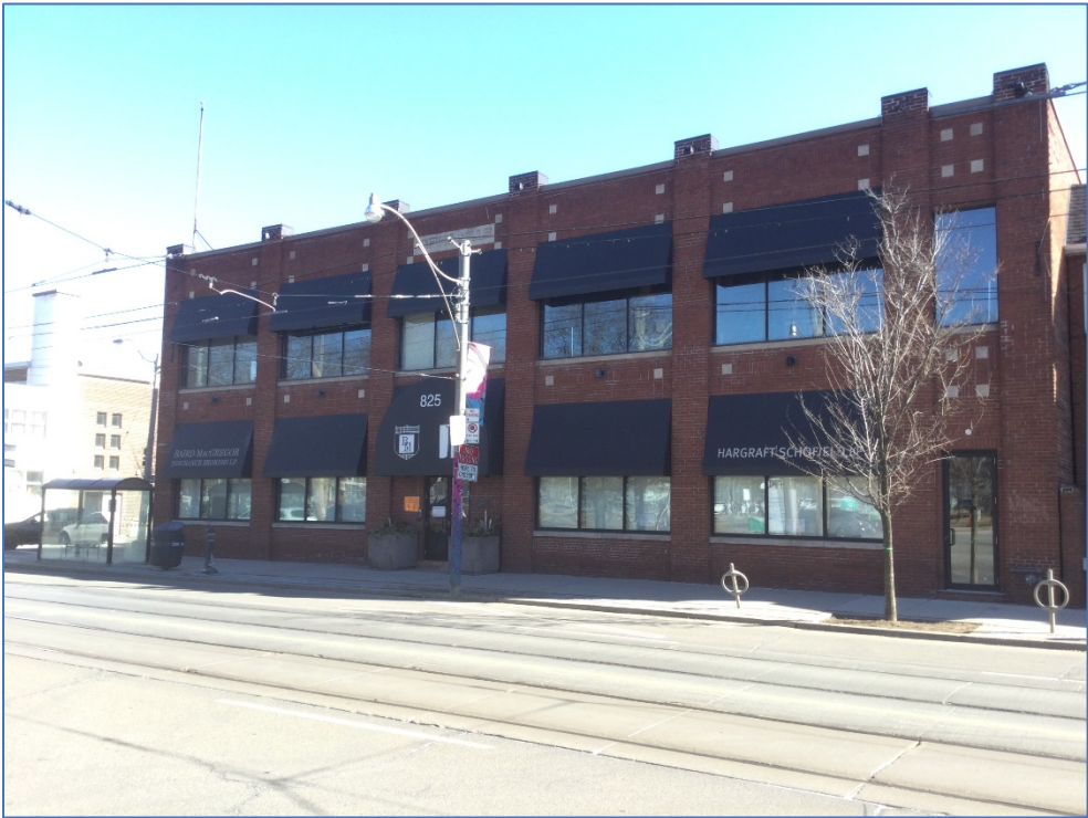
825 Queen Street East