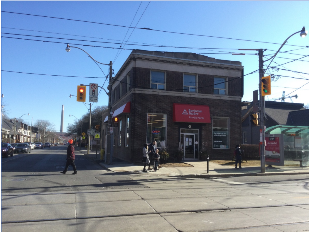
943 Queen Street East