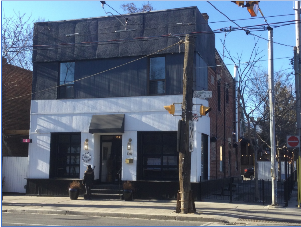
1192 Queen Street East