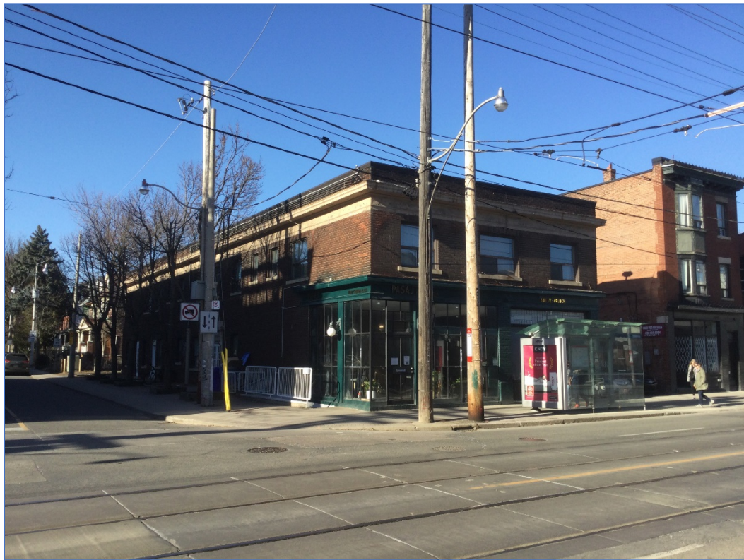
1100 Queen Street East