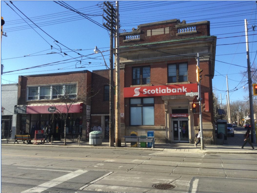
1046 Queen Street East