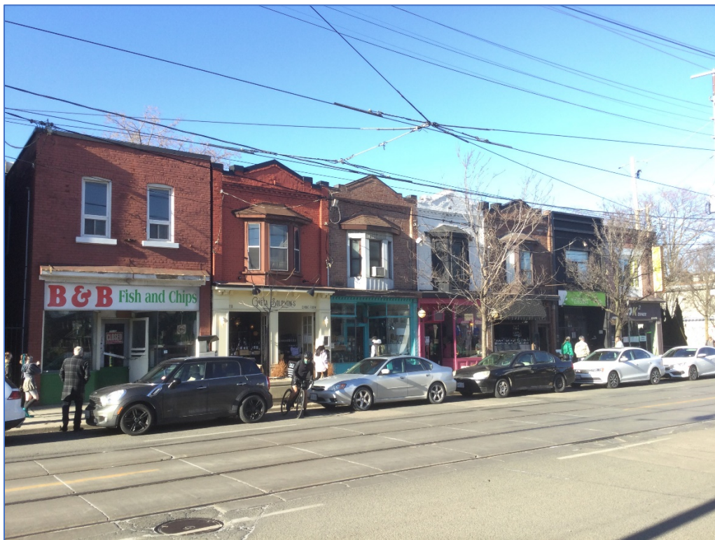
1118-1124 Queen Street East