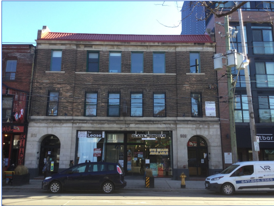
909-911 Queen Street East