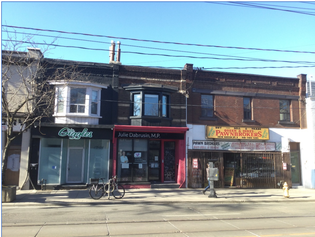
1026-1028 Queen Street East