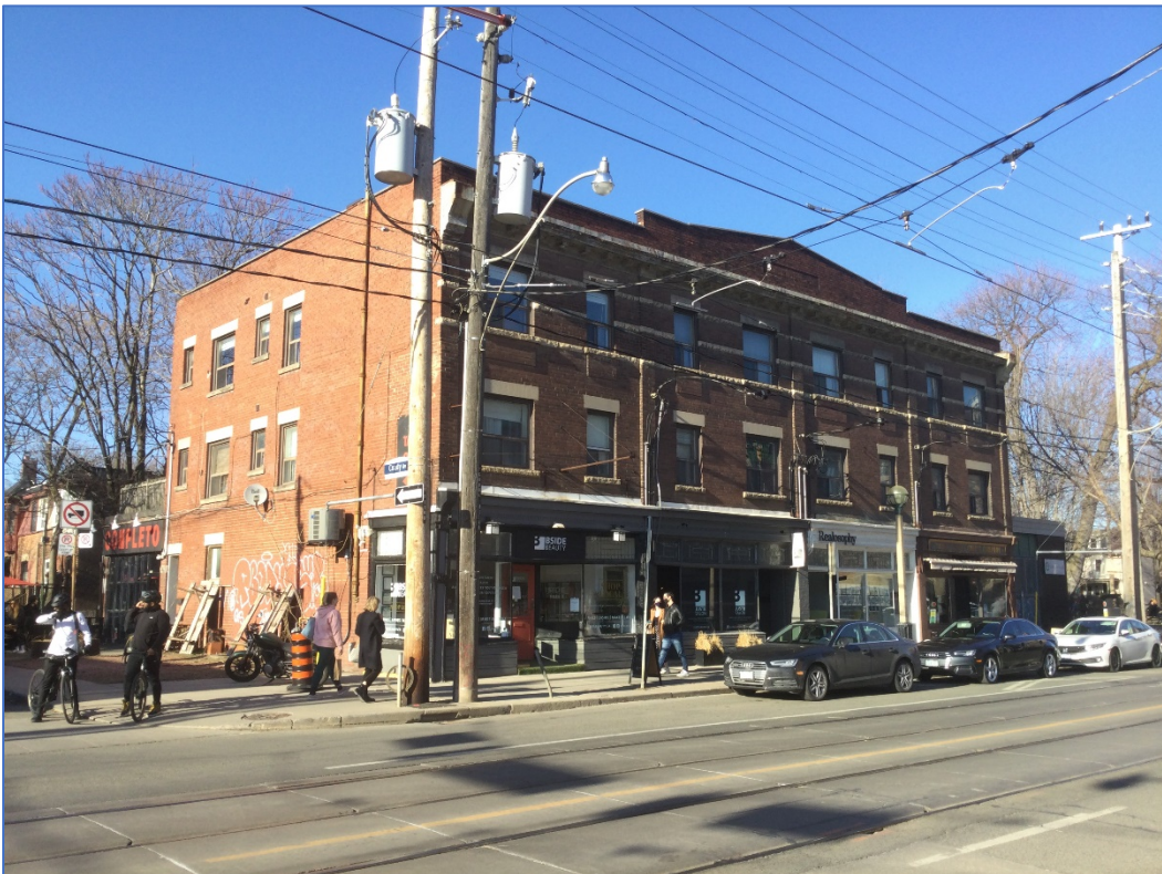
1148-1154 Queen Street East