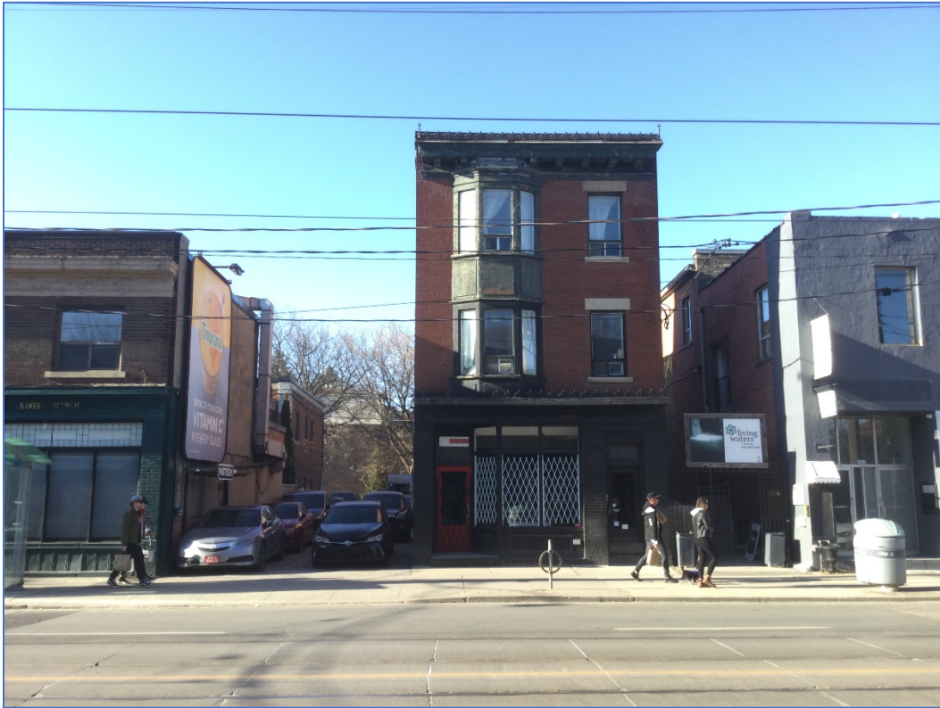
1112 Queen Street East