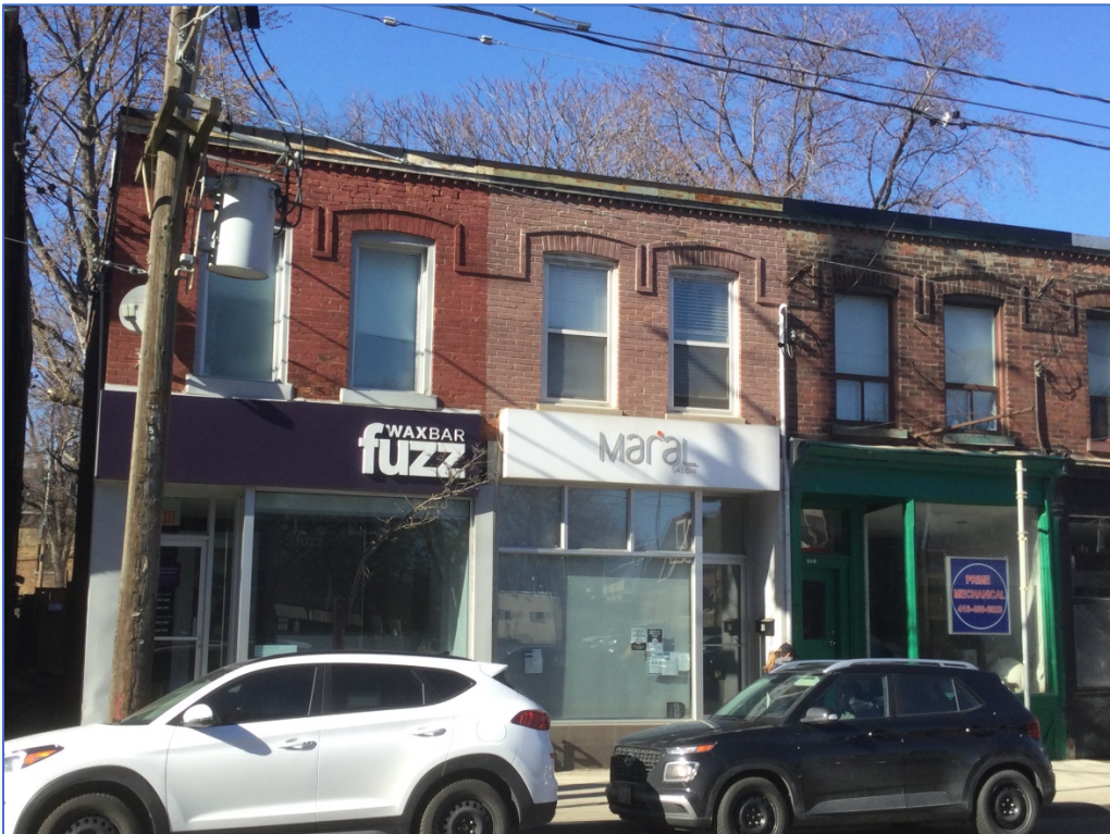
938-938 Queen Street East