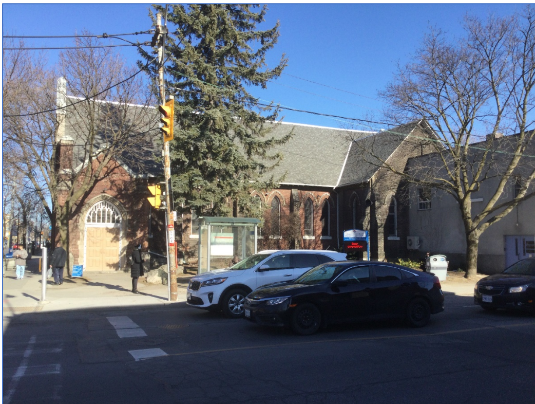
945 Queen Street East