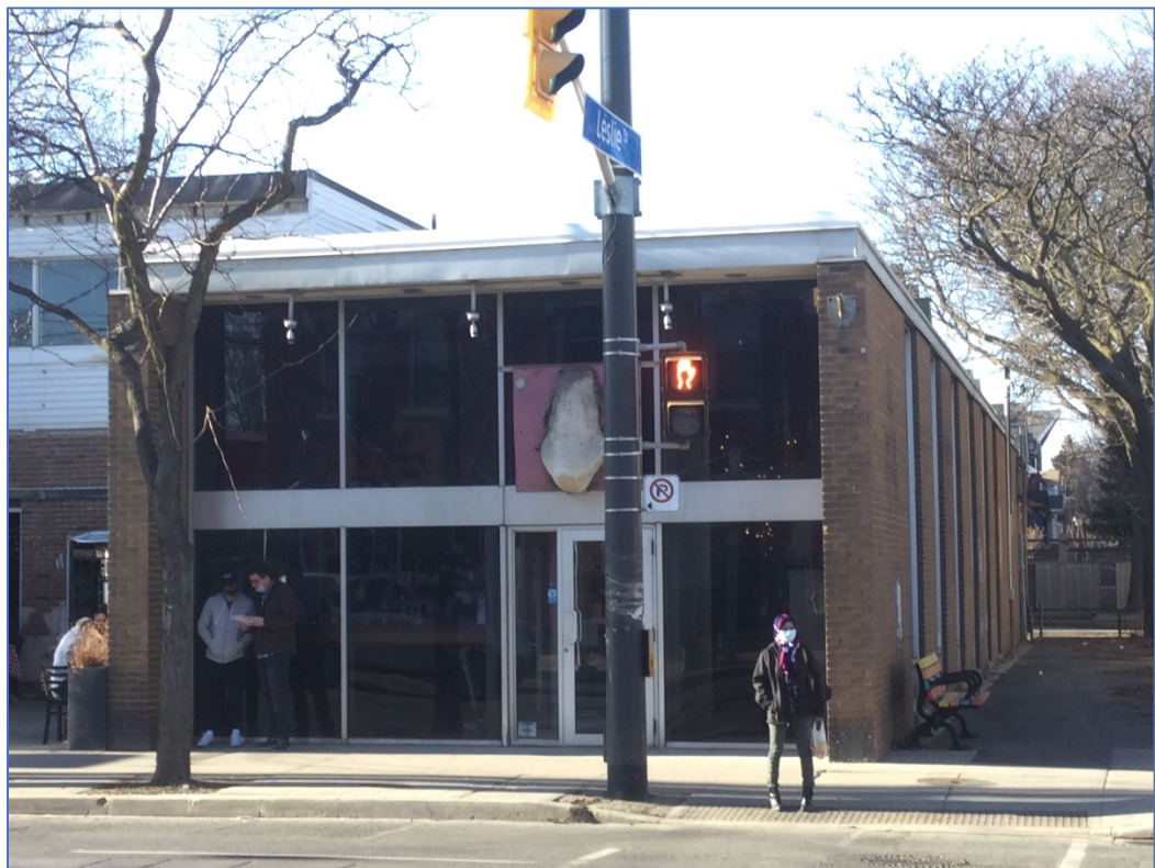
1220 Queen Street East