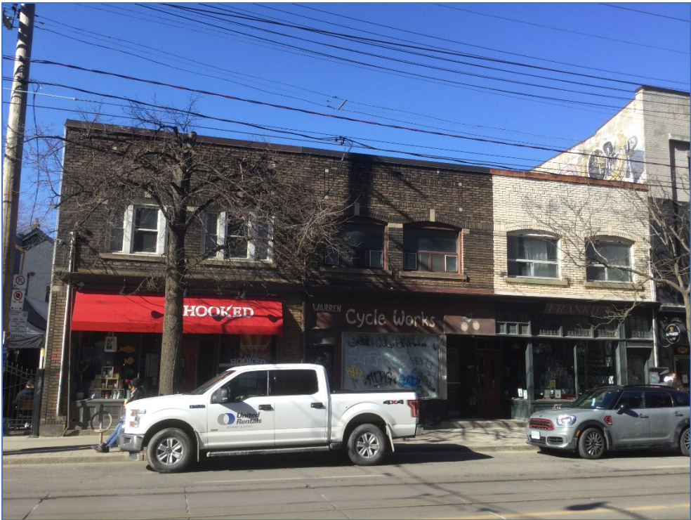
888-892 Queen Street East