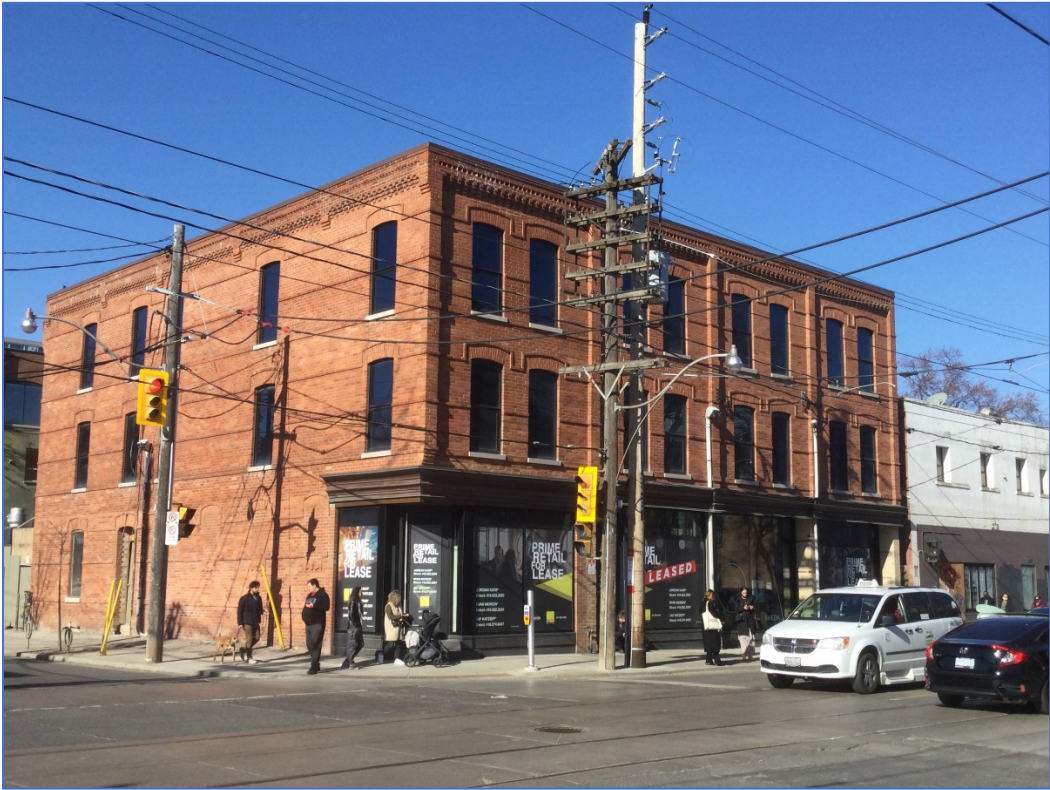
972-978 Queen Street East