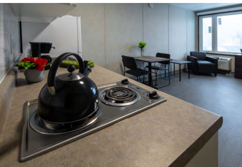
Kitchen area of a modular housing unit at 321 Dovercourt Road