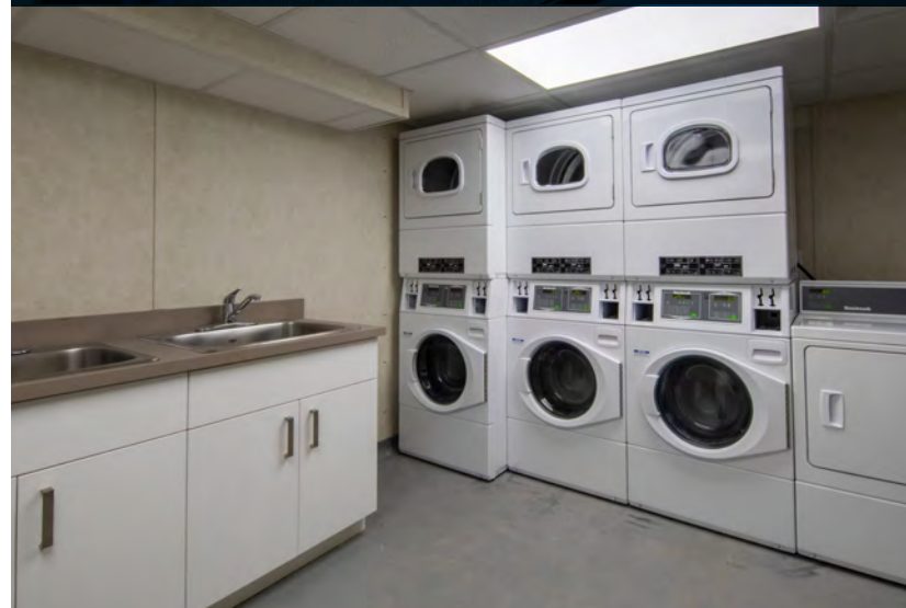
Laundry area at 321 Dovercourt Road