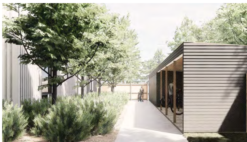
Preliminary artist's rendering - final design subject to approval.

The City will select a qualified and experienced non-profit housing provider to manage the property and provide support services for residents. The City will continue to work with the selected housing providers after new residents will move in. The operator will have staff on site at all times.