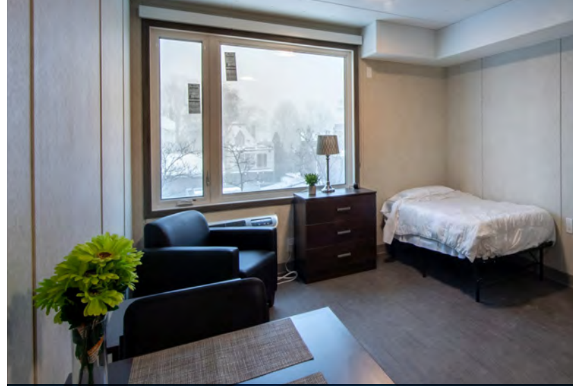
Interior of a modular housing unit at 321 Dovercourt Road

The City selects qualified non-profit housing providers who are on site 24/7 to manage each of the modular housing sites.