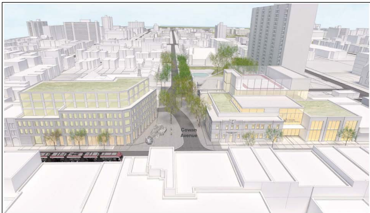
Figure 3: Demonstration Plan, Aerial View Looking South Along Cowan Ave.

CreateTO staff will report back to the Board in Q4 2021 with the final results of the Phase 2 feasibility study, including the advanced design work. The current design concept (see Figure 3) envisions the colocation of expanded Masaryk-Cowan Community Recreation Centre and Parkdale Library programs on the combined lands east of Cowan Ave. Through the thoughtful adaptive reuse of the heritage buildings on this site, new programming spaces and natural light can be introduced to both programs. On the City lands east of Cowan Ave. a new 6-storey affordable housing project (approximately 62 units) is envisioned with community uses, including the relocated Parkdale Arts & Culture Centre program, at grade. This design is preliminary, and will continue to evolve during Phase 2 based on stakeholder and public feedback and the ongoing pursuit of program efficiencies.