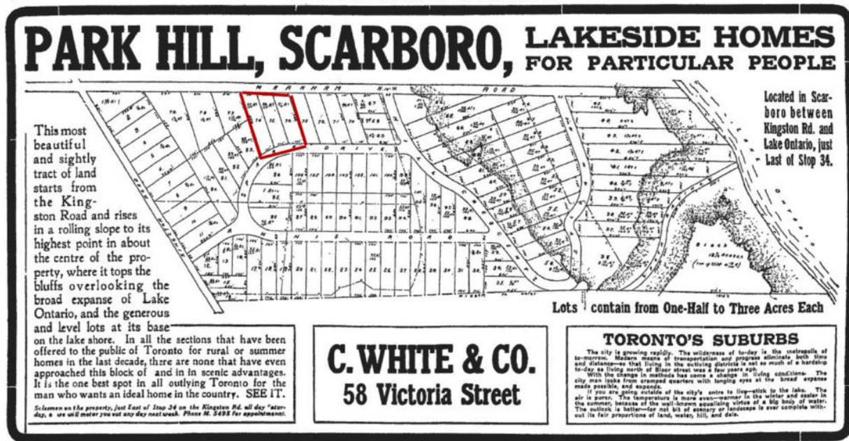
Figure 2. 1912 Advertisement in the Toronto Daily Star for lots for sale by C. White & Co. in the Park Hill subdivision. Lots 74, 75, 76 purchased by Frederick J. Cornell in 1913 are highlighted in red. In 1956, the east half of the lots, facing Markham Road was severed by Arthur Cockshutt. ( Toronto Daily Star , September 22, 1911, p.17, Scarborough Archives)