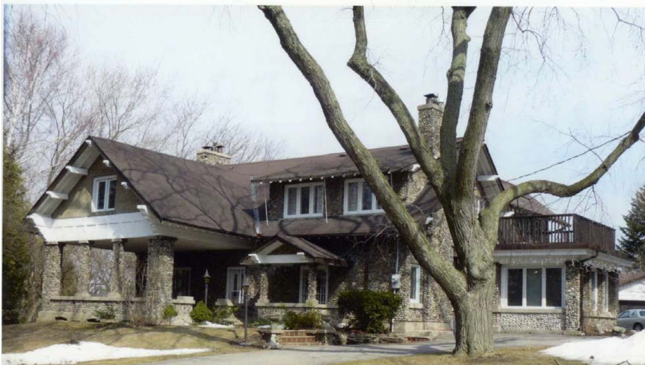
Figure 4. View of the principal (north-west) and side (south-west) elevations of 19 Parkcrest Drive, showing the Craftsman Bungalow features and particularly the pebble cladding and decorative rafters under the deep eaves of the gable ends (Scarborough Community Preservation Panel [SCPP], 2008)