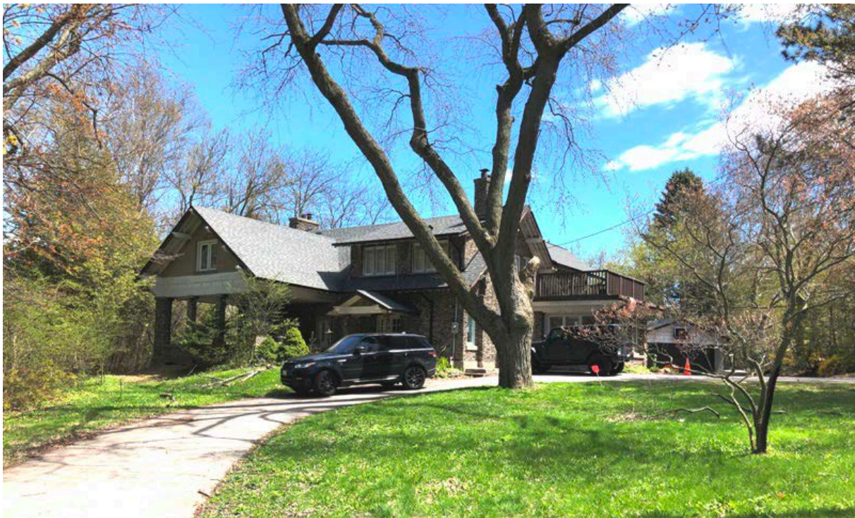
Figure 3. View of the setting of the Frederick J. Cornell house on the property at 19 Parkcrest Drive, looking towards the principal (north-west) and side (south-west) elevations (Heritage Planning [HP], 2021)