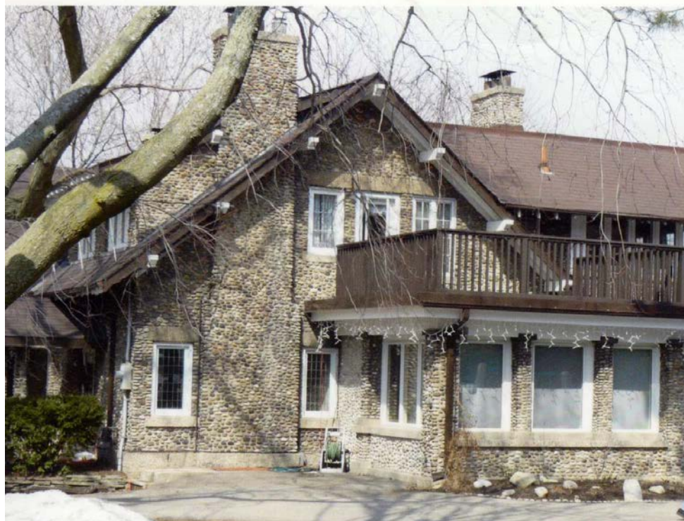
Figure 5. View of the south-west elevation with the enclosed former porte-cochere (SCPP, 2008)