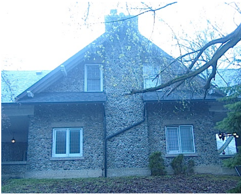
Figure 6. North elevation showing the pebble cladding set in concrete, the decorative rafters and the leaded casement windows (SCPP, 2021)