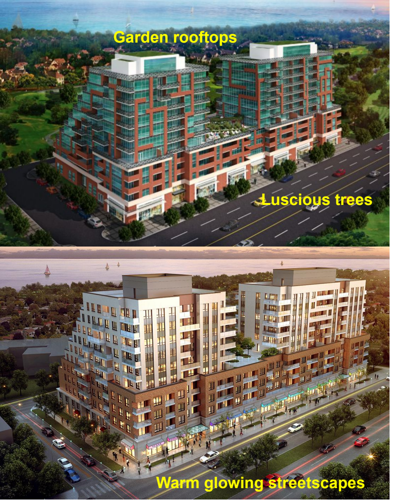
Beautiful Architectural Proposal Renderings