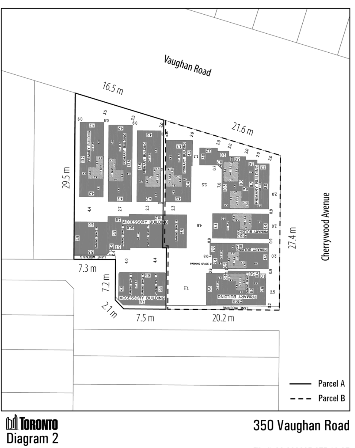
9 City of Toronto By-law xxx-2021