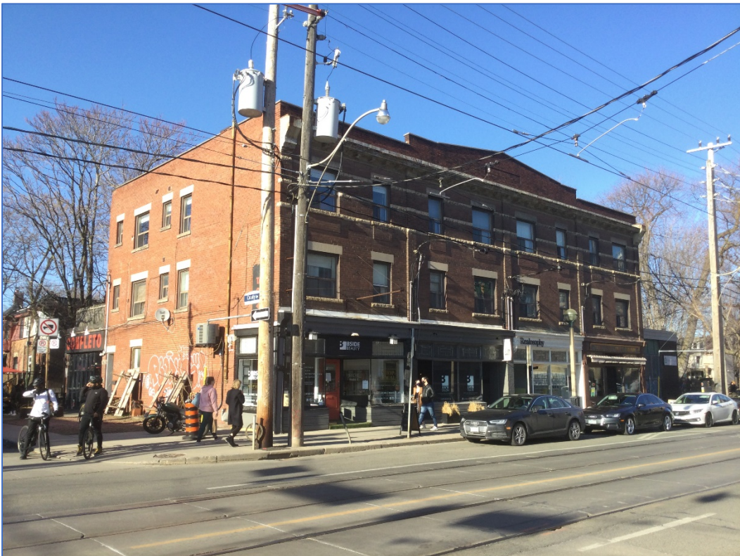
1148-1154 Queen Street East