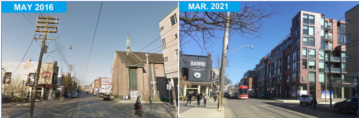
827 Queen St. E - Woodgreen Church redevelopment into 118 condos & new Red Door Family Shelter

As you will see from the attached maps and photographs – the majority of the 54 commercial buildings on Queen Street East that staff have provided in your report are wholly unremarkable and exist in similar forms by the hundreds all-over various parts of Toronto and East York. In addition, almost all of the 54 commercial buildings in Leslieville that have been suggested for bulk-inclusion into the Heritage Register are within the 500 and 800 metre Major Transit Service Area zones around the new Ontario Line station that Metrolinx is developing at 799 Queen Street East.