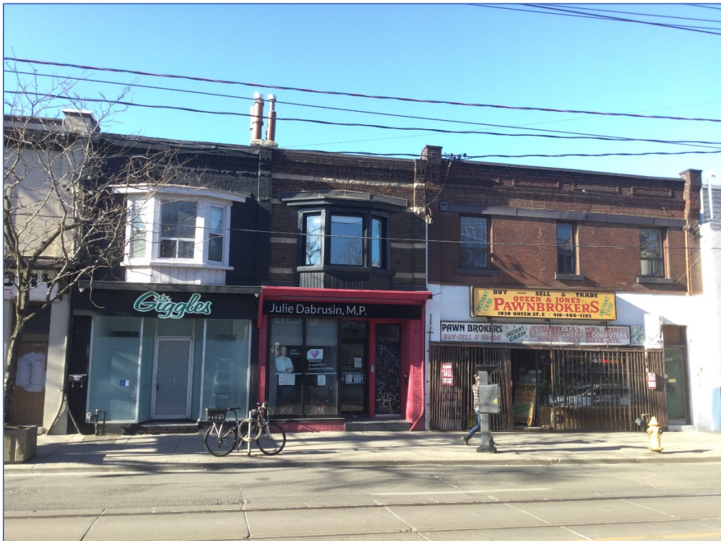
1026-1028 Queen Street East