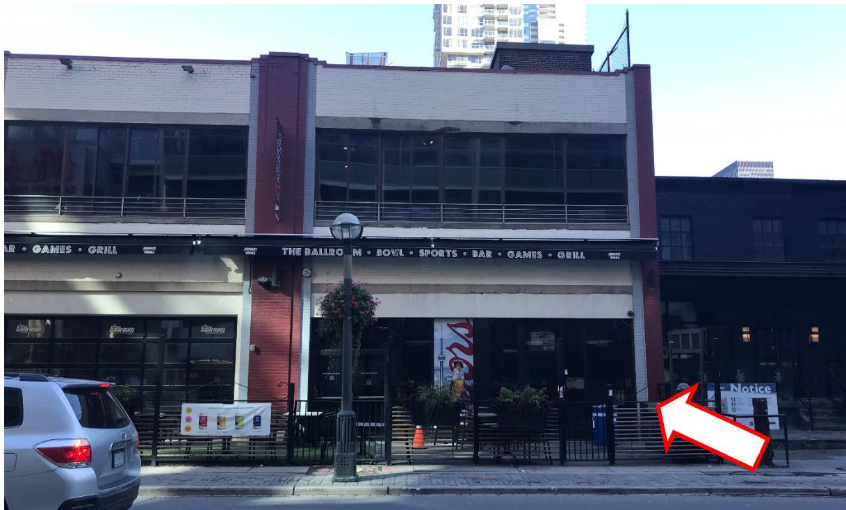
8. Current photograph showing the additional bay constructed in 1948 at the southern end of the west elevation. (Heritage Planning, 2021)