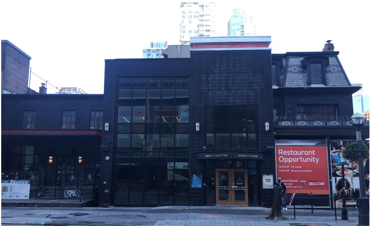
12. Current photograph showing the principal (west) elevations of the consolidated buildings comprising 133 John Street. At far left is the truncated form of the formerly three-storey rowhouse at then 137 John