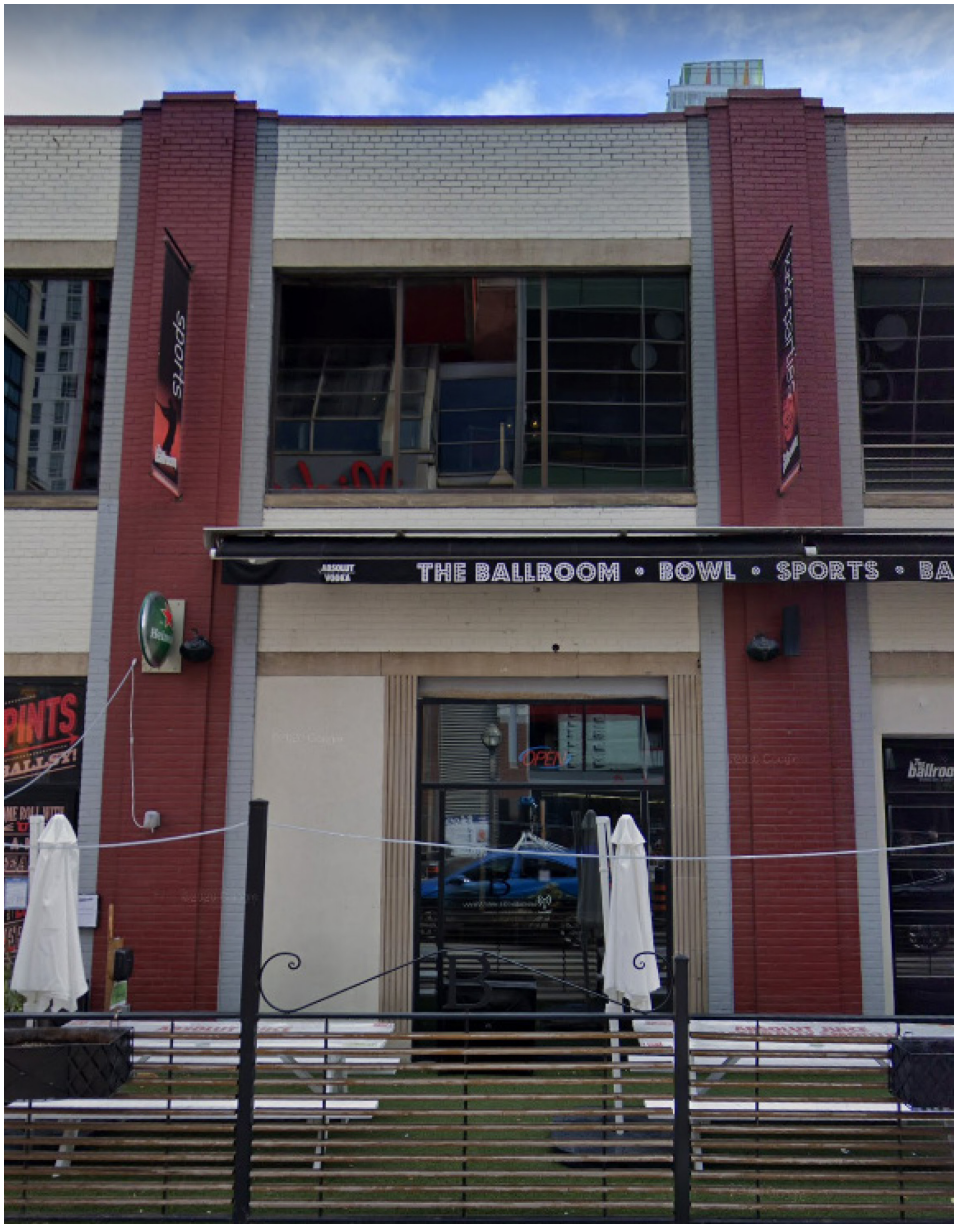
10. Current image showing a detail of the principal (west) elevation at 241 Richmond Street West with the original cast-stone, fluted door jamb and the stepped parapets that terminate the piers at the roofline.