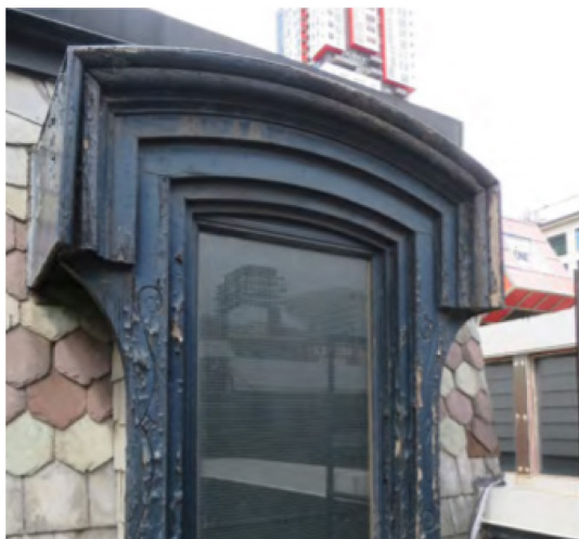
14 and 15. Current photographs showing the third storey architectural details at 133 John Street (ERA, 2021)