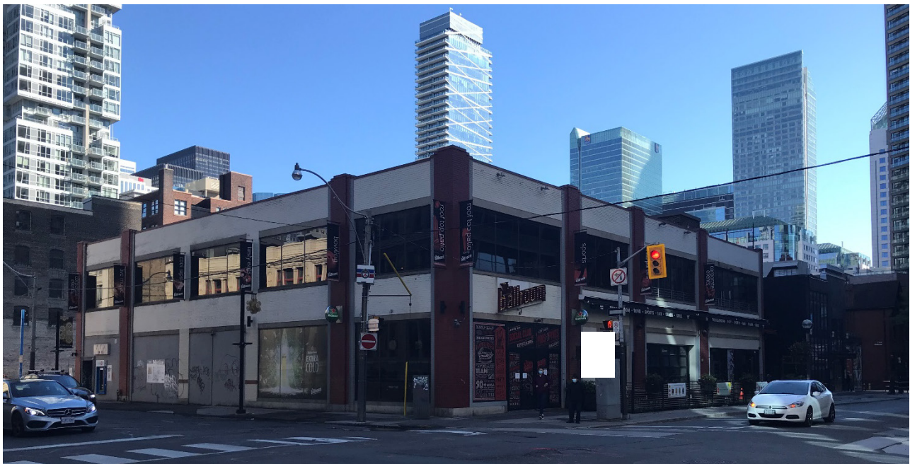
7. Current photograph of the building at 241 Richmond Street West from the northwest and showing the principal (west and north) elevations. (Heritage Planning, 2021)