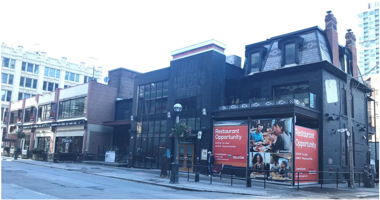
11. Contextual photograph looking northeast and showing the properties at (from left to right) 241 Richmond Street West and consolidated properties comprising 133 John Street. (Heritage Planning, 2021)