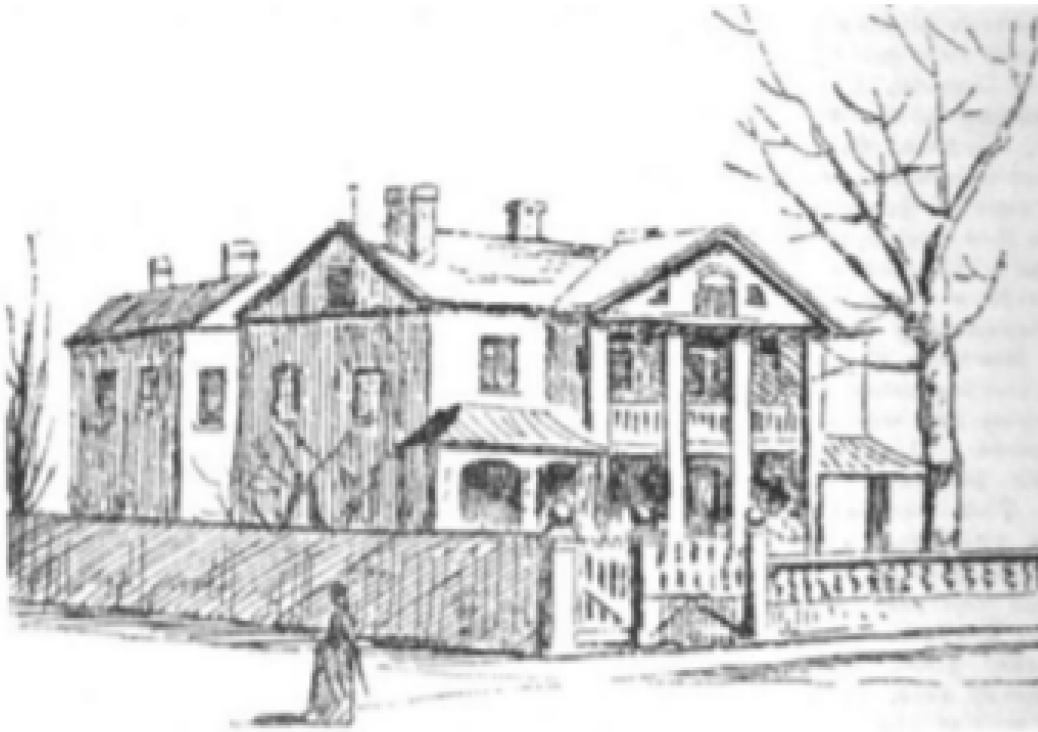
THE MACDONELL HOUSE—NORTH EAST CORNER ADELAIDE AND JOHN STR.