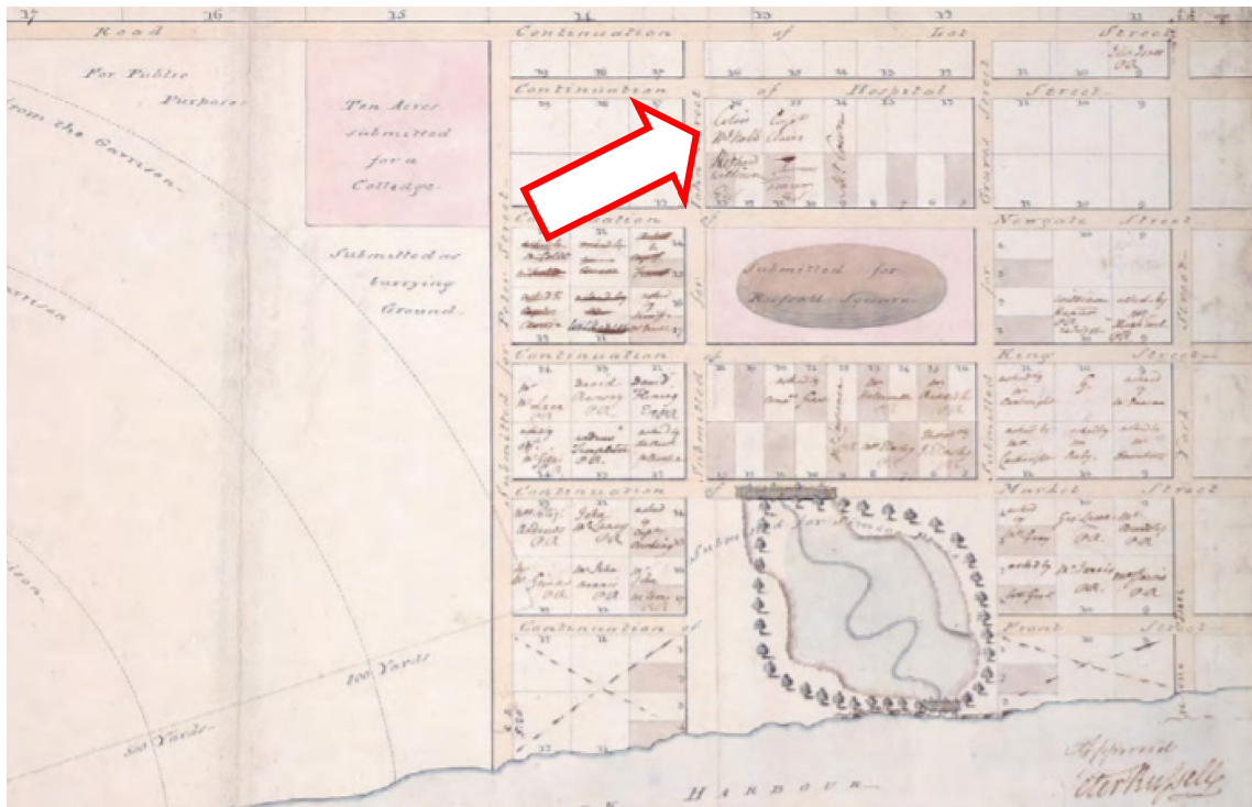
2. D.W. Smith, 1798 plan for the second enlargement of York. The arrow marks the future location of the subject site. (TPL)