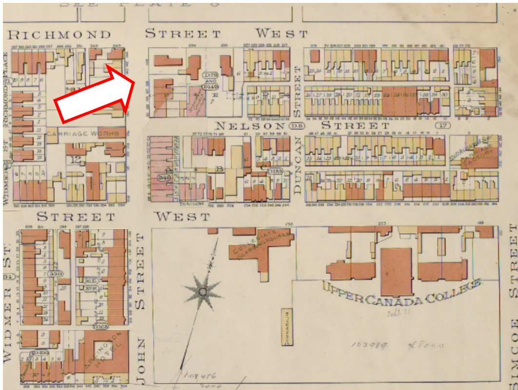
4. Goads 1893 Map, containing information gathered in the previous year, and showing the five attached and one detached house-form buildings on the east side of John Street. (Ng)