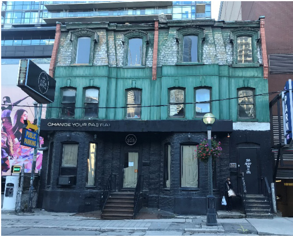
16. Adjacent house-form heritage properties on at 118-122 John Street (west side) (Heritage Planning, 2021)