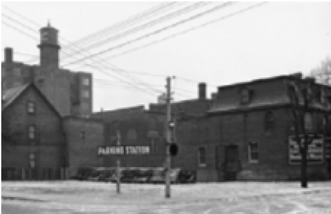
5. 1935 archival photograph showing the empty lot at the southeast corner of Richmond and John just before construction of the industrial building known today as 241 Richmond Street West and showing the 1870s dwelling at 139 John Street at right.