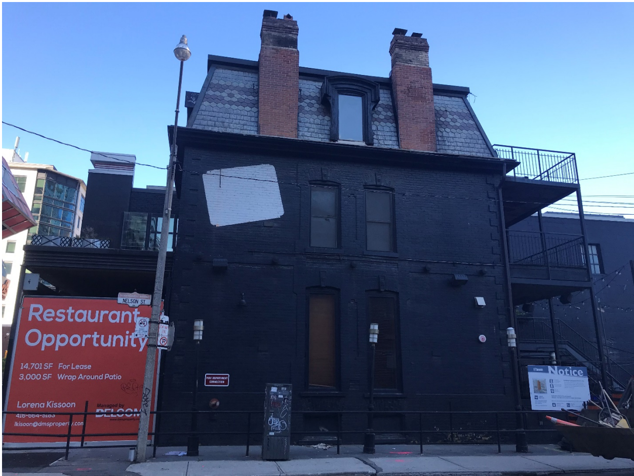
13. Current photograph showing the south elevation of 133 John Street fronting Nelson Street. The original openings, dichromatic brick chimneys, Mansard roof with slate tiles and decorative wooden roof dormers are all intact.