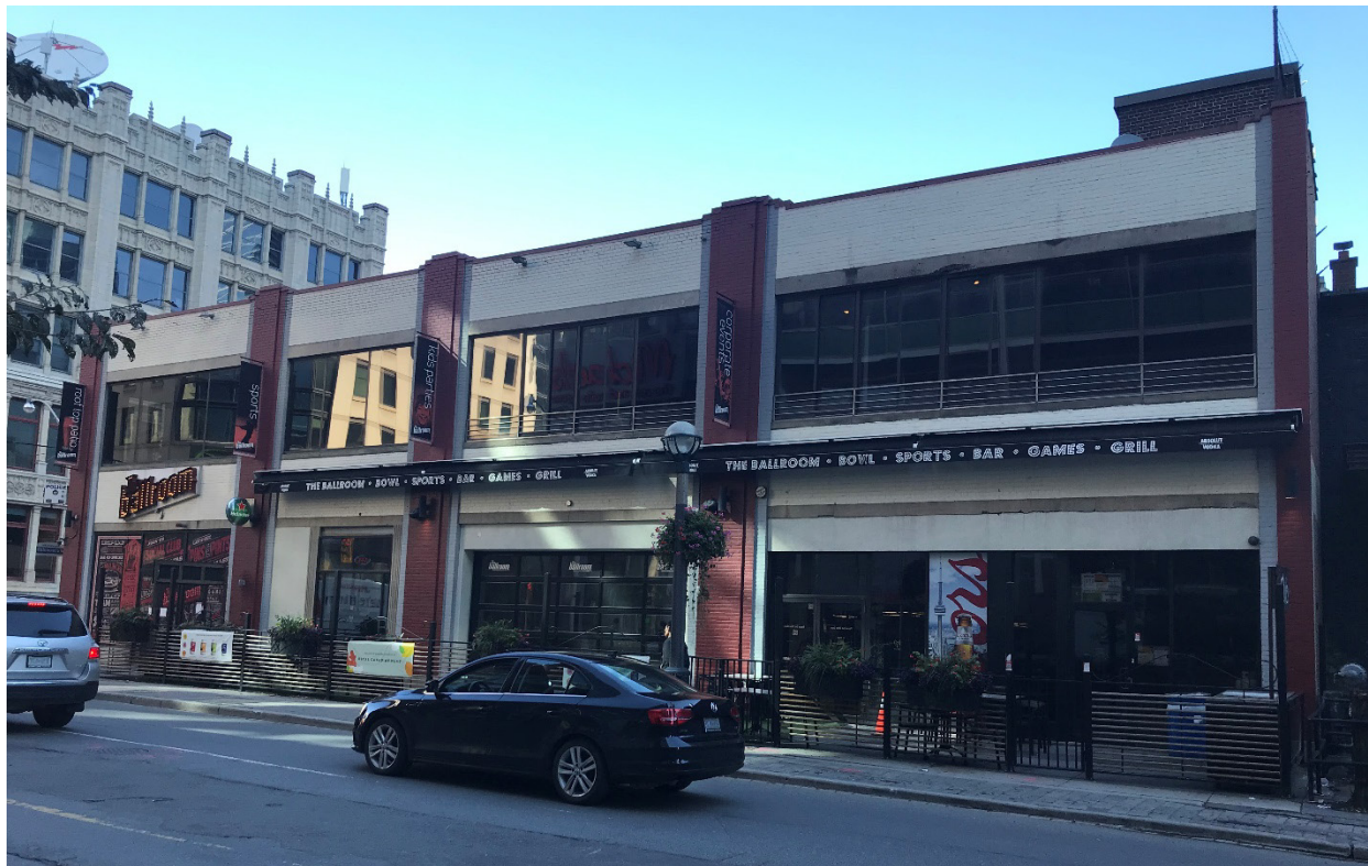
9. Current photograph showing the west elevation fronting John Street and part of the adjacent heritage property at 299 Queen Street West at far left. (Heritage planning, 2021)