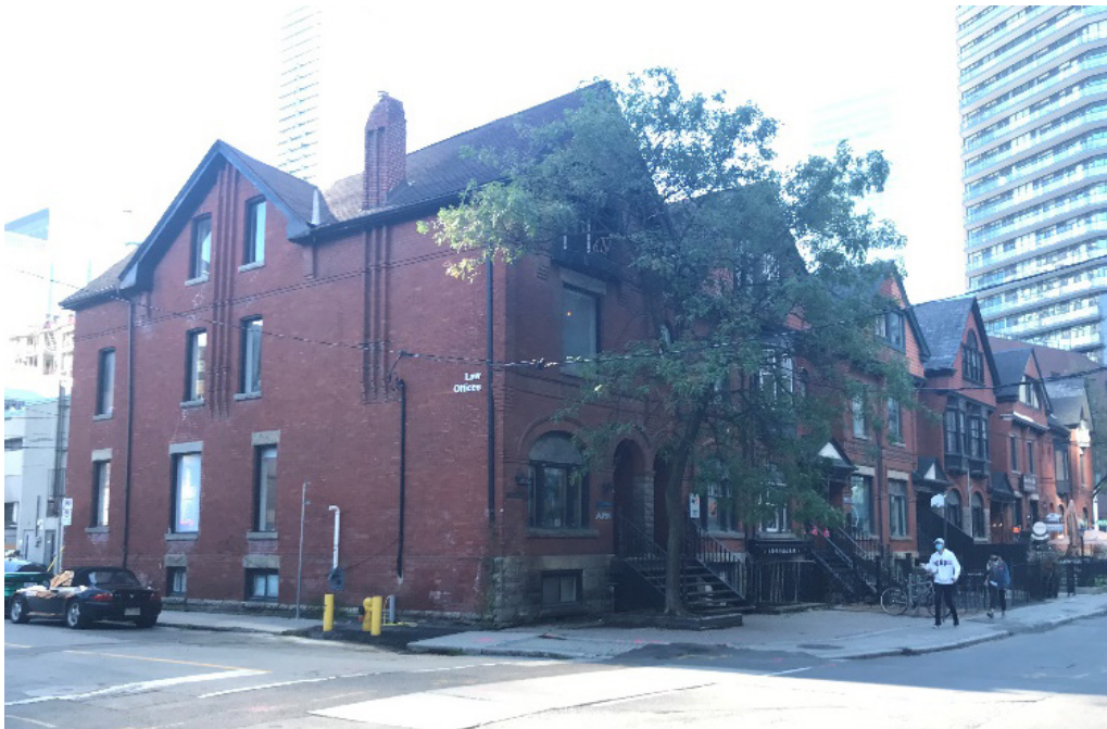
17. Adjacent house-form at 109-129 John Street (corner of Nelson Street). (Heritage Planning, 2021)