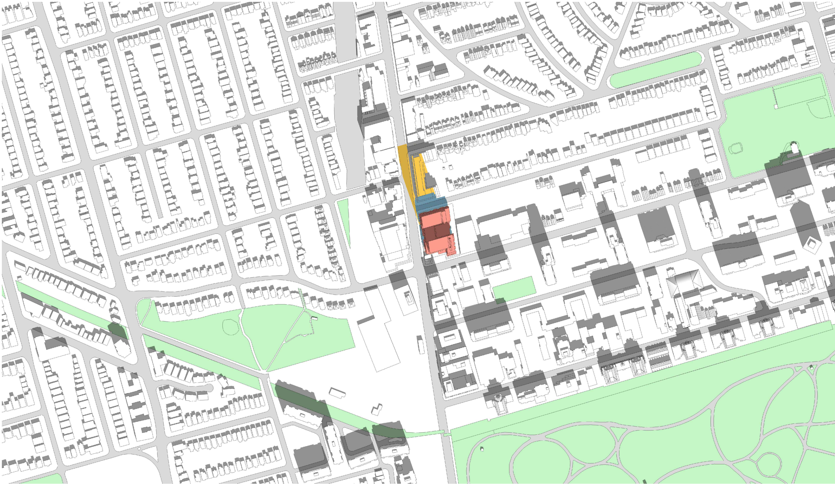
3 SEP 21 - 11:18 A108