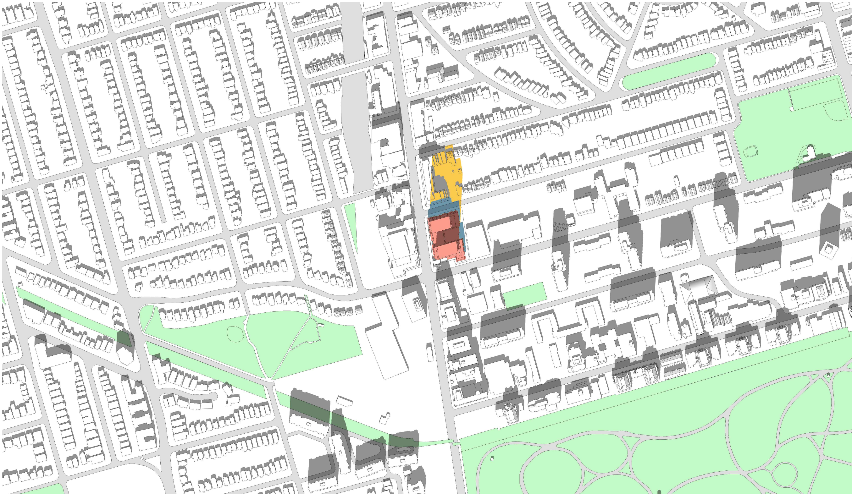
4 SEP 21 - 12:18 A108

AS PER MID-RISE DESIGN @ 37.4m SAME AS 1985 YONGE)