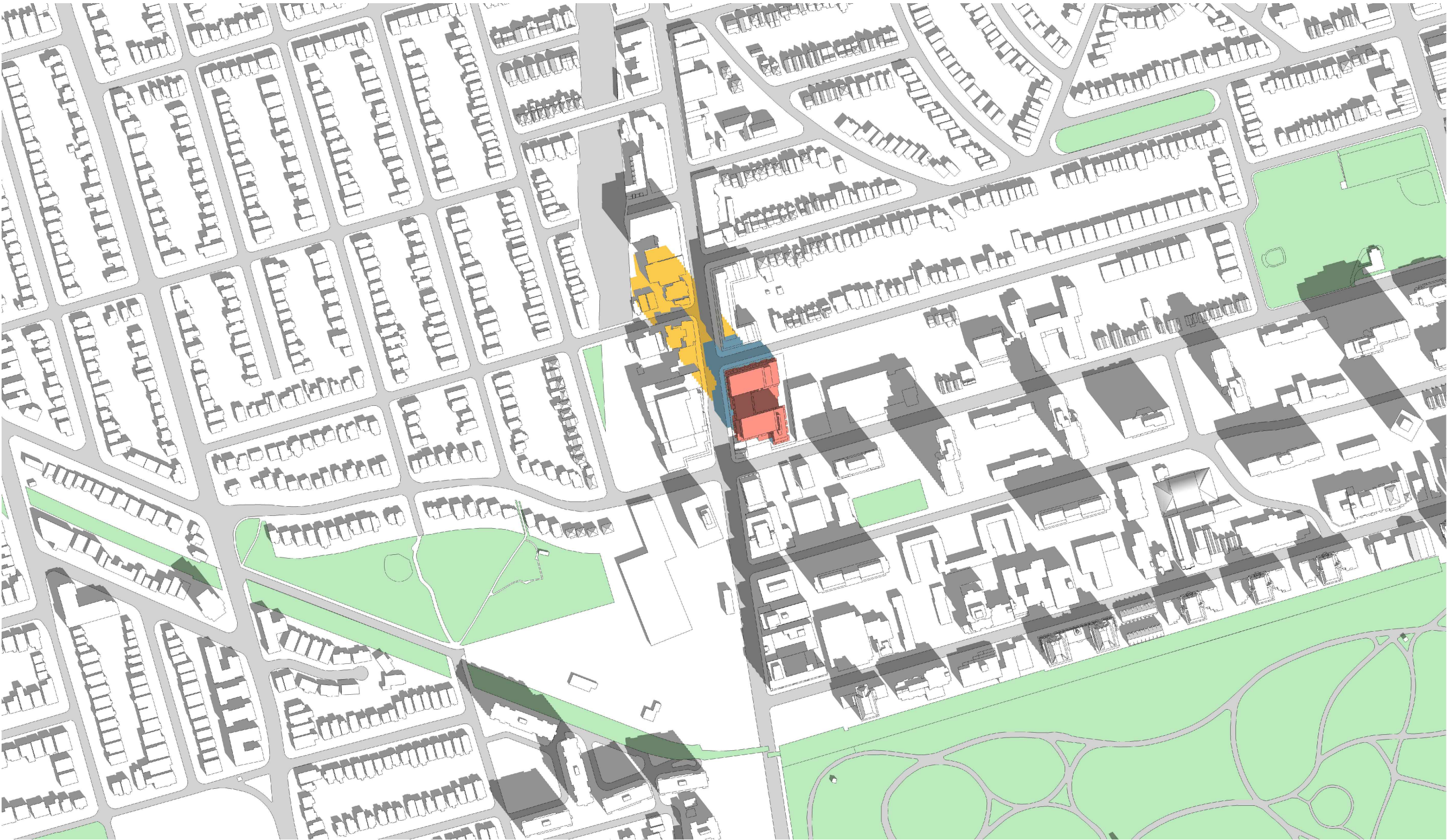
2 SEP 21 - 10:18 A108