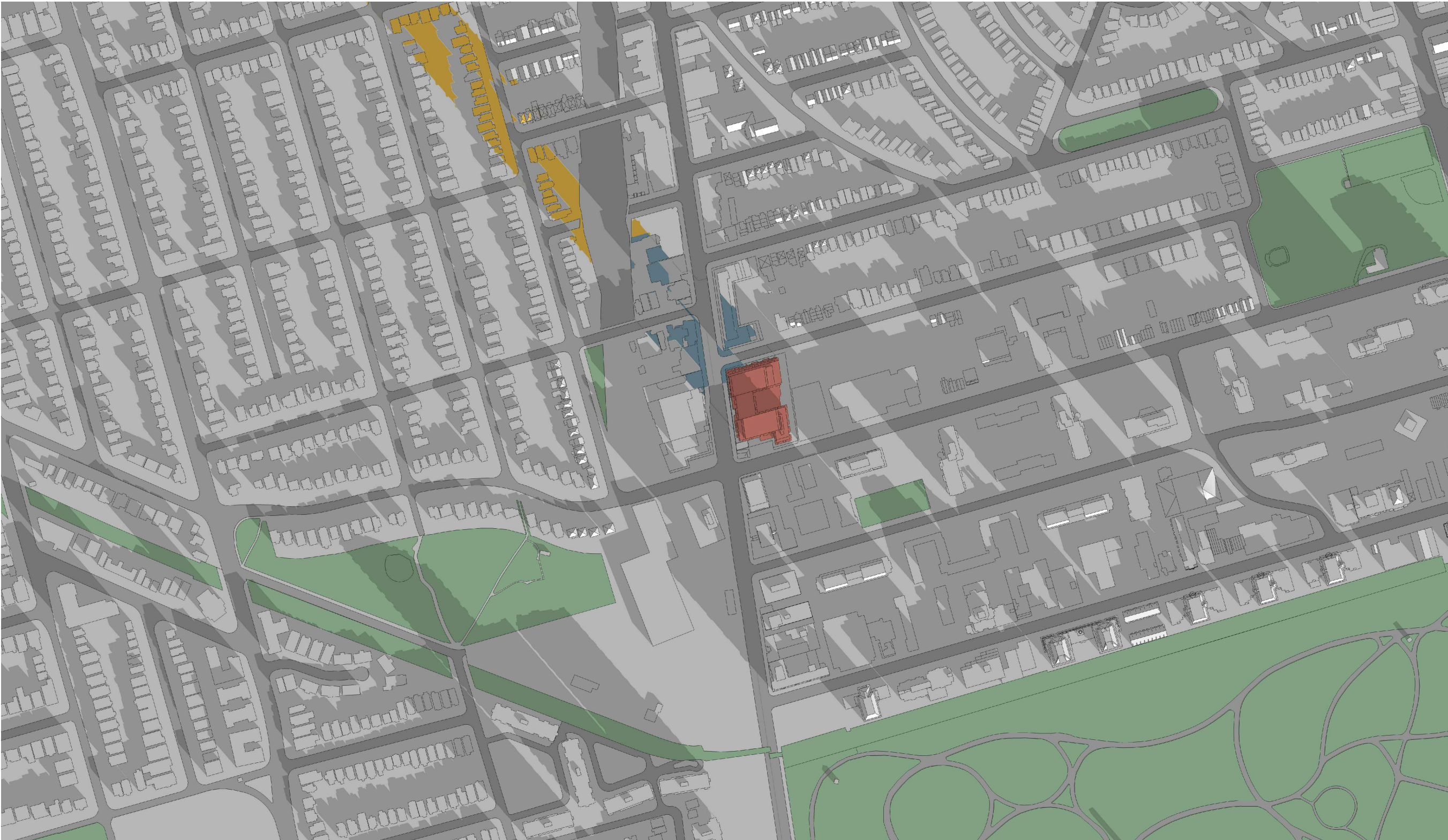
1 A111 DEC 21 - 09:18