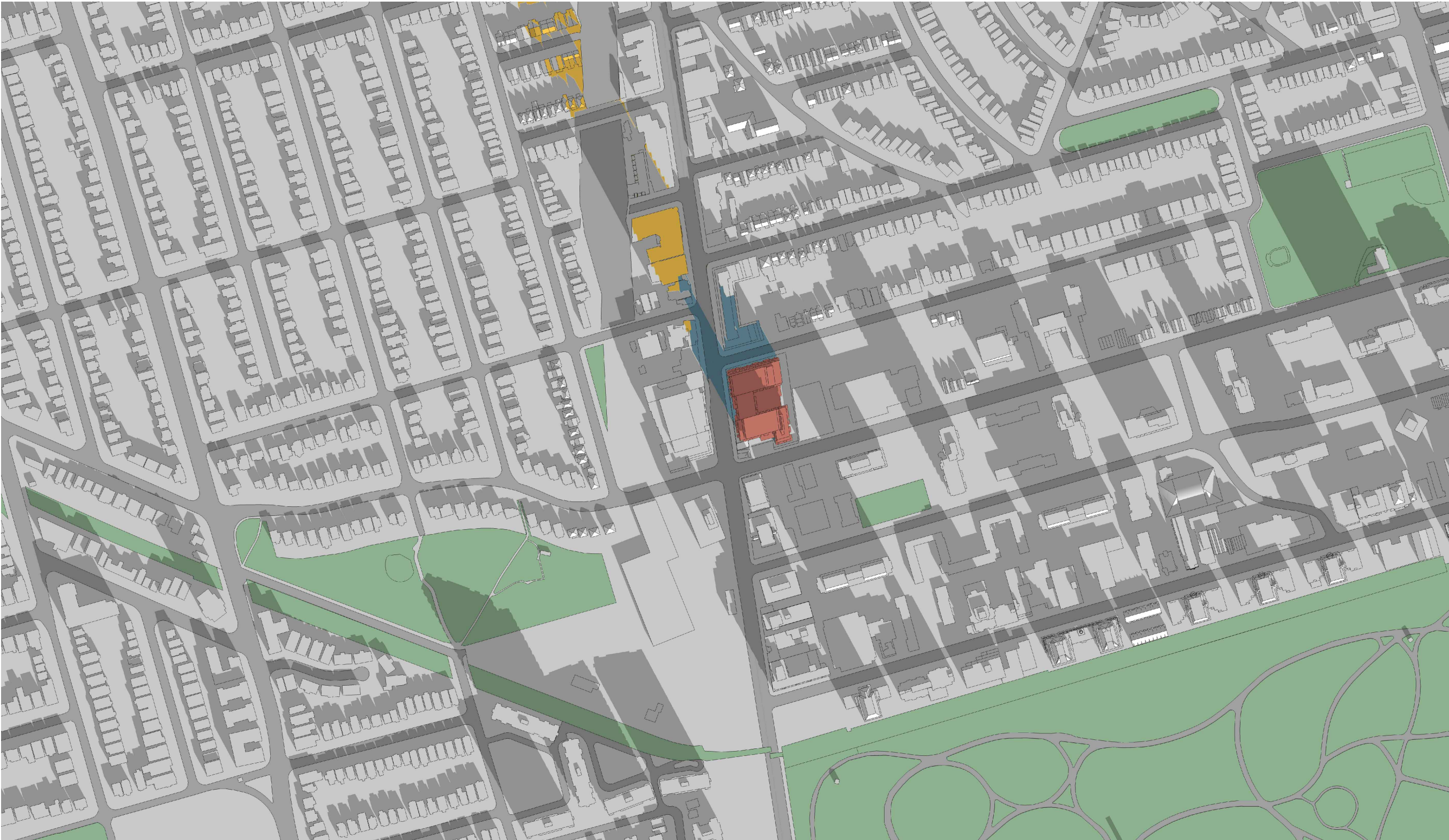
2 A111 DEC 21 - 10:18