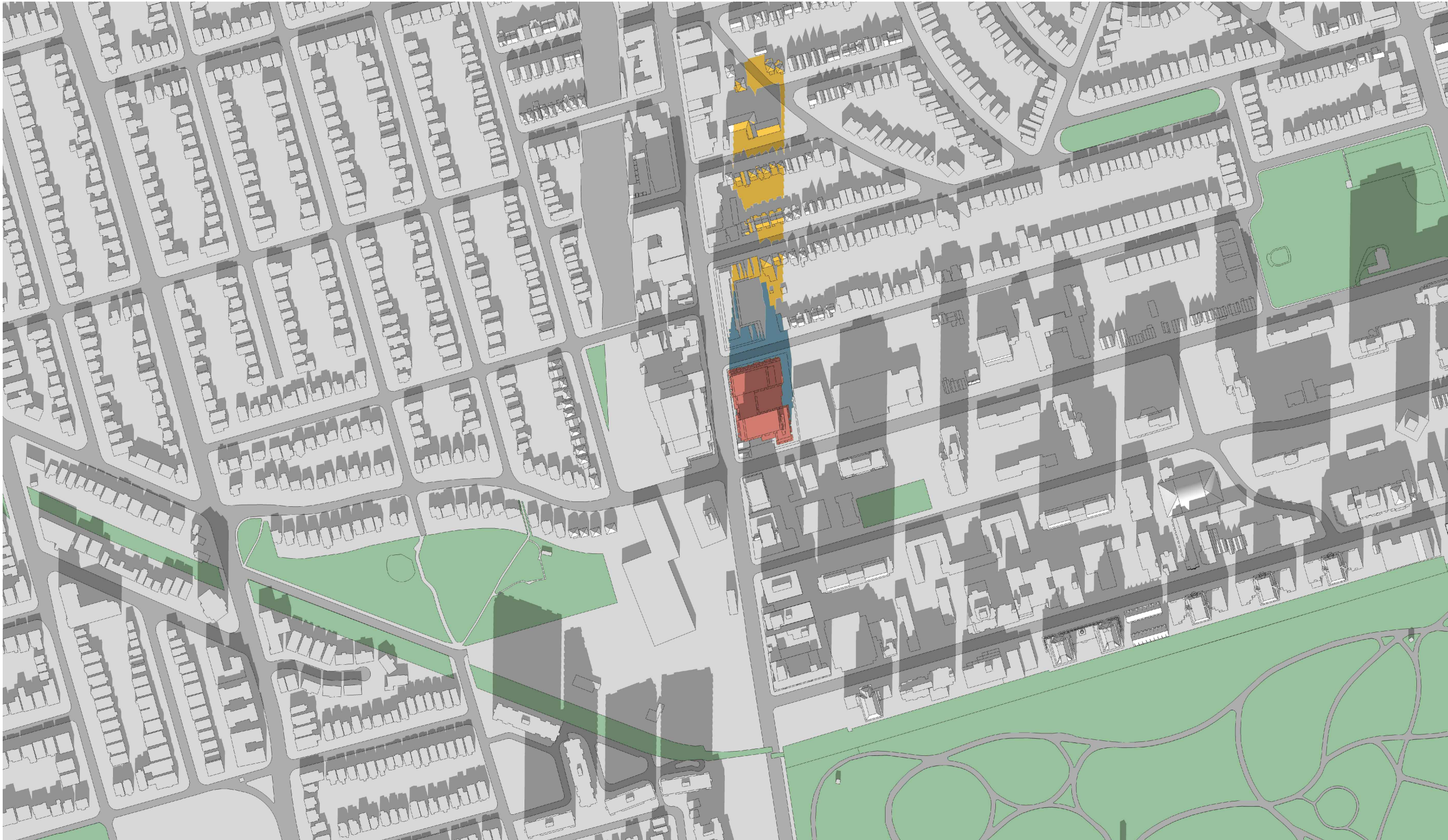
4 A111 DEC 21 - 12:18

AS PER MID-RISE DESIGN @ 37.4m SAME AS 1985 YONGE)