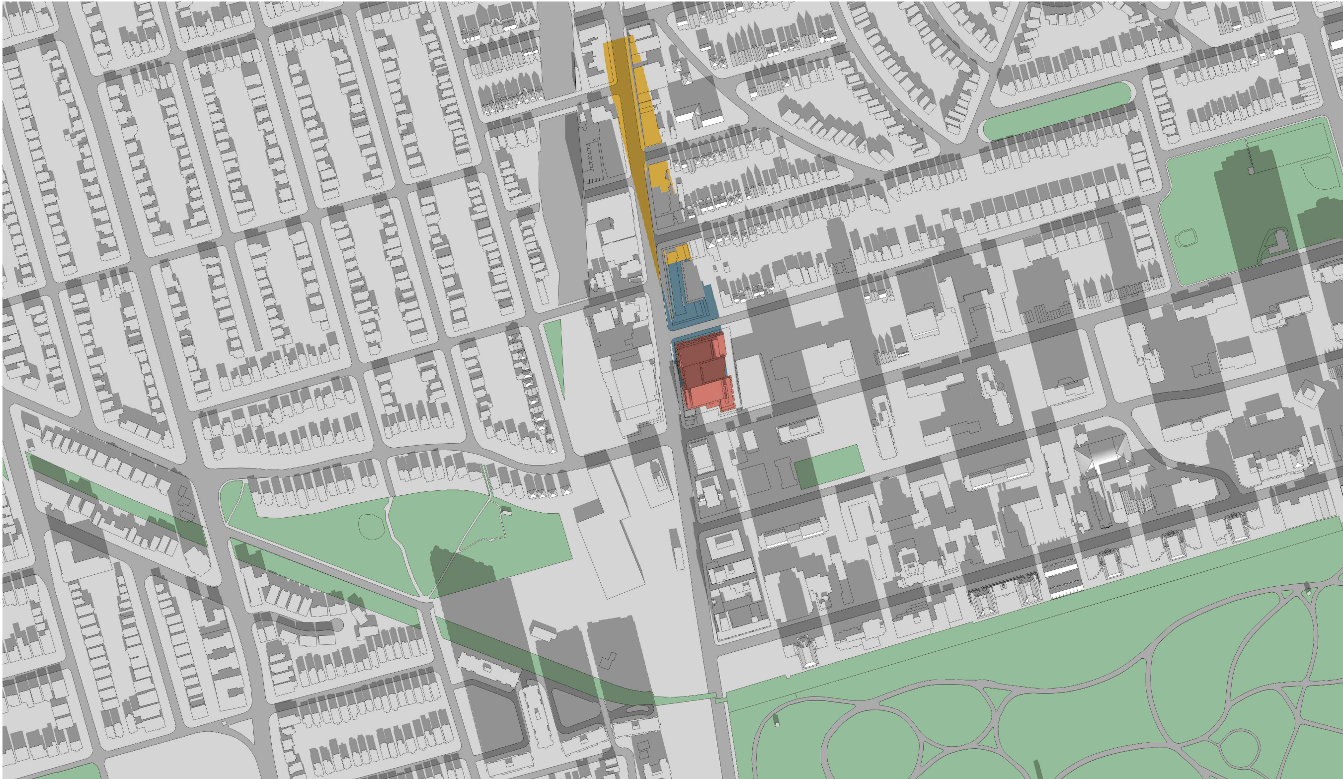
3 A111 DEC 21 - 11:18