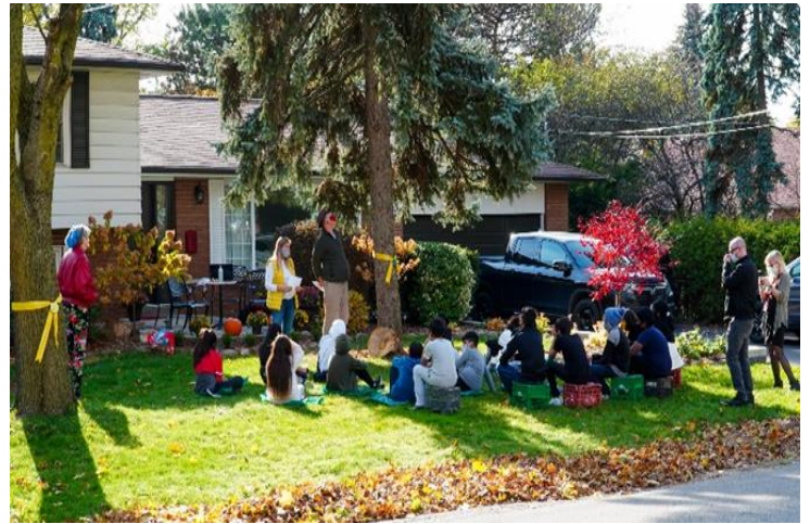
Students from Bliss Carman Public School getting a lesson on the benefits of trees

The Tree Ribbon Campaign was launched by the Cliffcrest Scarborough Village SW Residents Association to bring attention to the neighbourhood forest at risk of being lost if the decisions made about these neighbourhoods do not give consideration to the value of our trees.