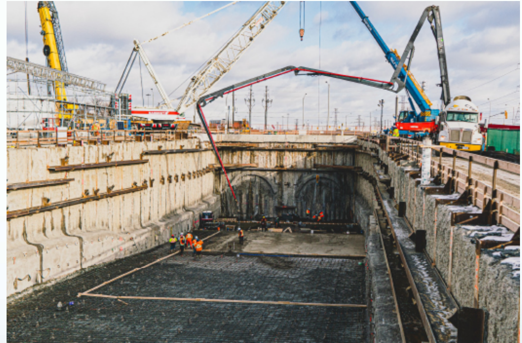
This photo shows the launch shaft hole at Renforth Drive that is 80 meters long by 20 meters wide.