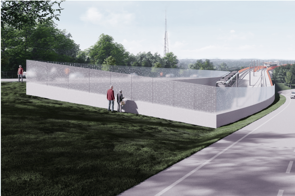
Metrolinx rendering of a massive launch shaft between Pearen Park and Fergy Brown Park – not to scale. The second launch shaft would be just west of Scarlett Rd.