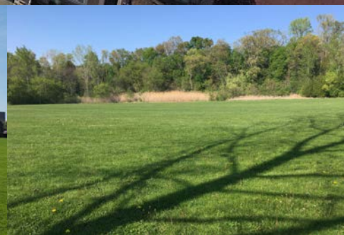
Photo by Stop the Trains in Our Parks of Pearen Park and the Eglinton Flats. %