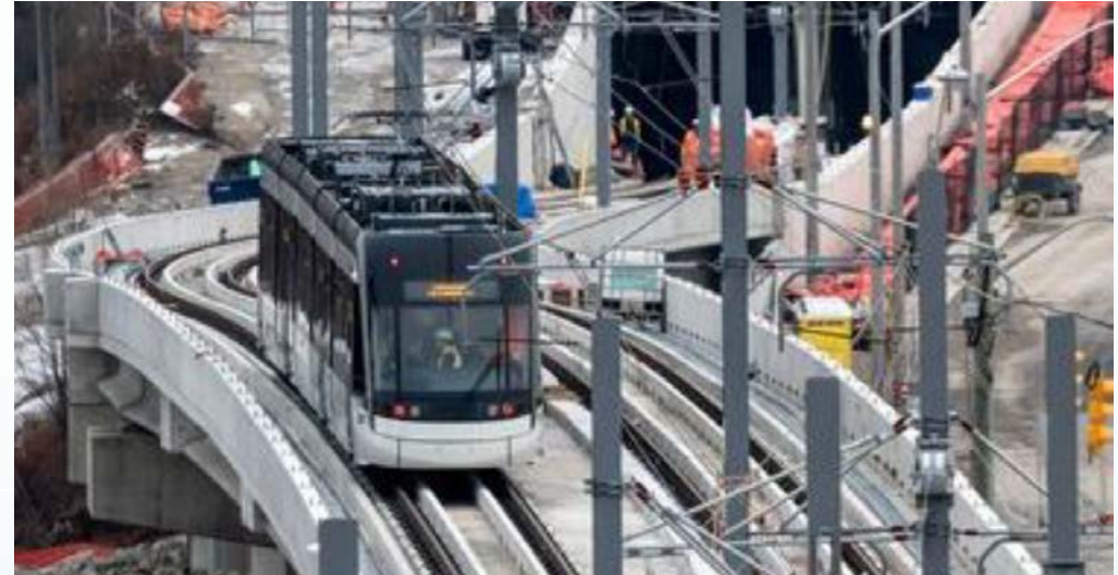
Photo showing a train at Black Creek just east of Mount Dennis Station.

Metrolinx rendering shows what the LRT train expressway might look like. The reality is that the expressway will have a massive presence in the parkland, mature trees around it will be gone, and park users will feel and hear it.