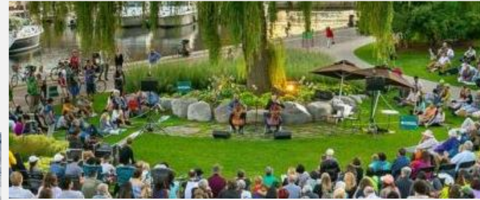
Summer Music in the Garden (tomorrow night) Programmed by Harbourfront Centre

Global Centre for Climate Resilience coming soon