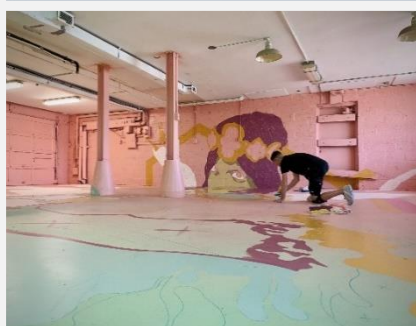
Canada Ireland Foundation's Corlick Building coming soon (Photos from Miotais/Myth exhibit, 2021, prior to construction)