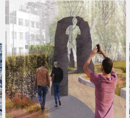
The Legacy Project, 'Inspired by Terry Fox' memorial park coming soon

Bathurst Quay Signature Waterfront Park (EX34.4)