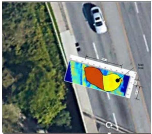
Figure 6- Ground Penetrating Radar image indicating location of voids 30 cm (yellow) to 60 cm (red) in depth