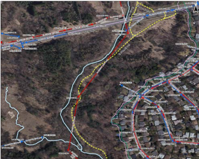
Figure 1- East Don River south of Finch Avenue East and west of Alamosa Drive