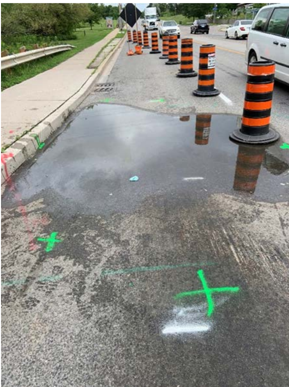
Figure 7- Image of surface settlement on McCowan Road