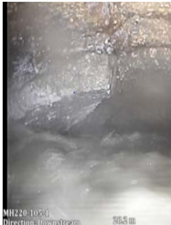
Figure 8- Image of broken pipe at the crown