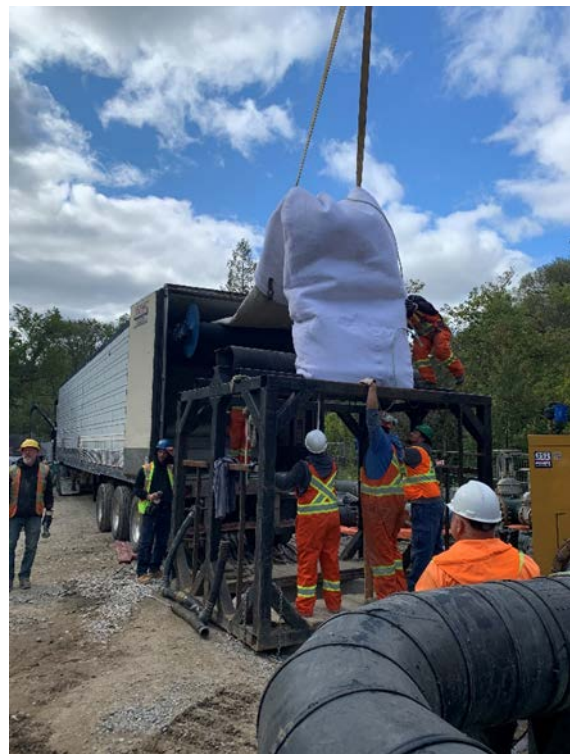
Figure 4- Preparing the sewer liner