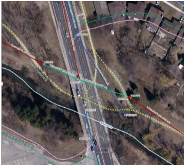
Figure 5- Highland Creek at McCowan Road north of the Scarborough General Hospital entrance (3050 Lawrence Ave E)