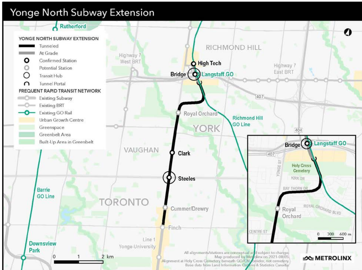
Figure 1 – Yonge North Subway Extension

The Early Works at the Finch Station will include installation of a new duct bank underneath Hendon Avenue, between Yonge Street and an existing Traction Power Substation located opposite Duplex Avenue, modification of existing TTC Subway Line 1 tail tracks (north of the Finch Station box), electrical modifications, utilities, etc. Figure 2 below shows an aerial view of the work location with respect to surrounding road network and land uses.