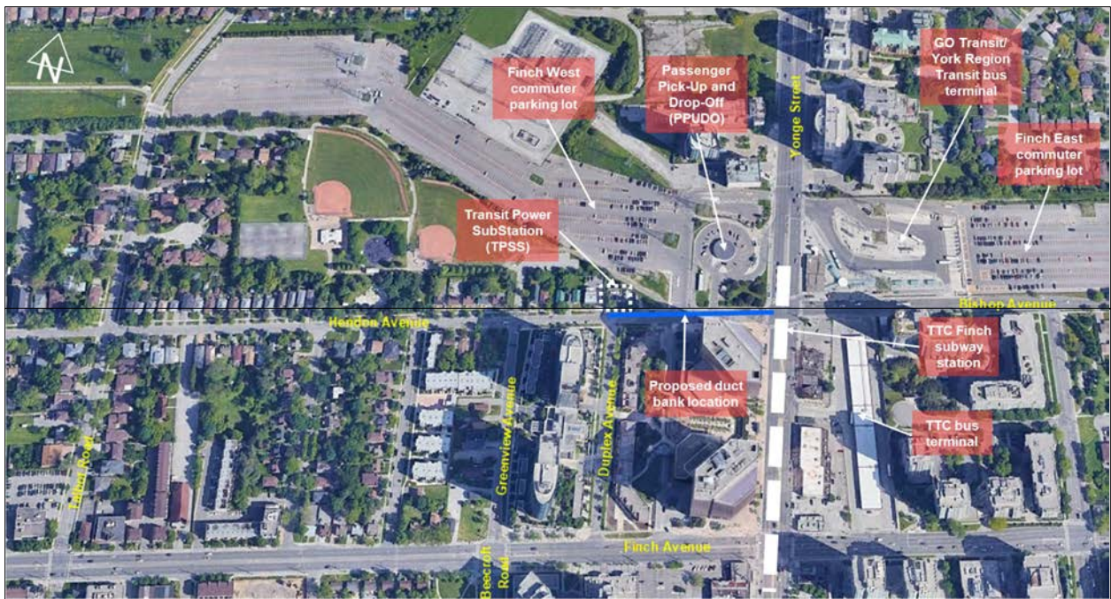
Figure 2 – Location Plan