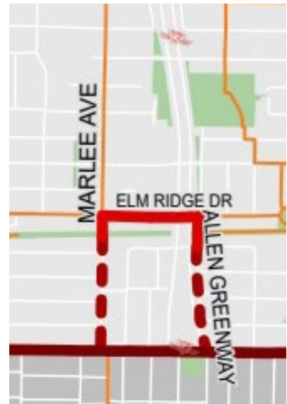
Figure 2: The Cycling Network Plan proposes new dedicated bikeways on Marlee Ave, Roselawn Ave, Elm Ridge Drive and improvements to the Allen Greenway for delivery in 2022-2024.

The Eglinton Crosstown LRT is expected to be substantially completed by the end of September 2022 and in service several months later. Transportation Services, through the Eglinton Today Complete Street project, proposes to implement complete street features, including bikeways and public realm upgrades, on Eglinton Avenue between York Beltline Trail and Kay Gardner Beltline Trail in Ward 8