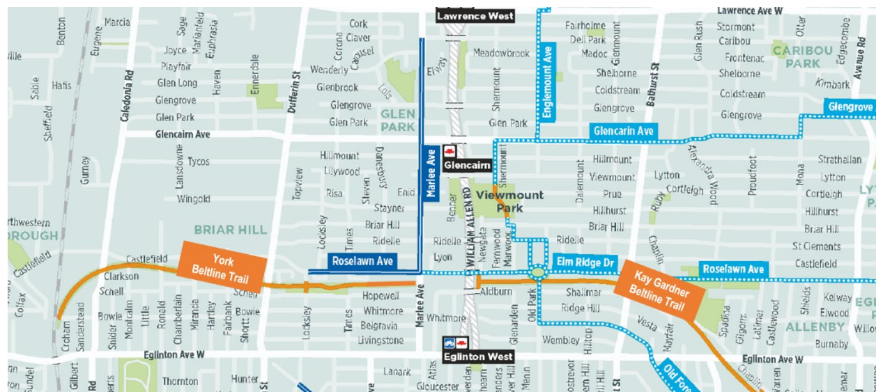
Figure 1 The York Beltline Trail and Kay Gardner Beltline Trails, north of Eglinton Avenue West

This report focuses on the section of the York Beltline and Kay Gardner Beltline Trails north of Eglinton Avenue West to Caledonia Road as seen in Figure 1 below.