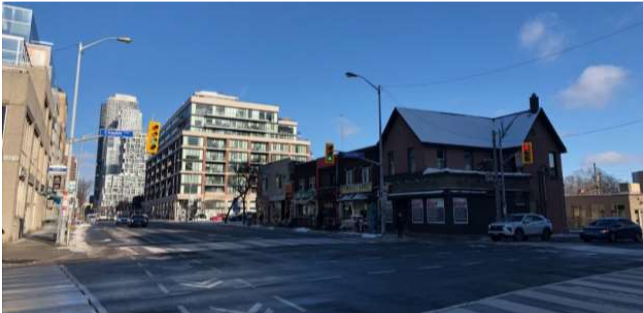
18. Context view looking northeast from Yonge Street, showing the subject properties at 1909 and 1913 Yonge Street, within a grouping of late-19th and early-20th-century buildings on the east side of Yonge Street, between Davisville Avenue and Millwood Road. (Heritage Planning, 2021)