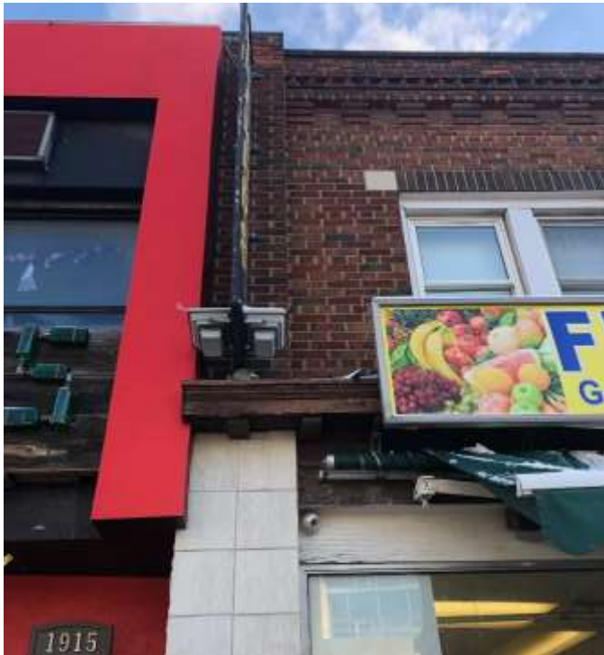
16. Photograph showing the dentilated wooden cornice and brick and stone details above the storefront on 1913 Yonge Street's west elevation.