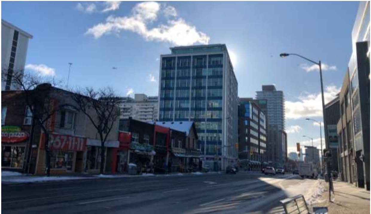
19. Context view looking southeast from Yonge Street, showing the subject properties at 1909 and 1913 Yonge Street, within a grouping of late-19th- and early-20th-century buildings on the east side of Yonge Street, between Davisville Avenue and Millwood Road. (Heritage Planning, 2021)