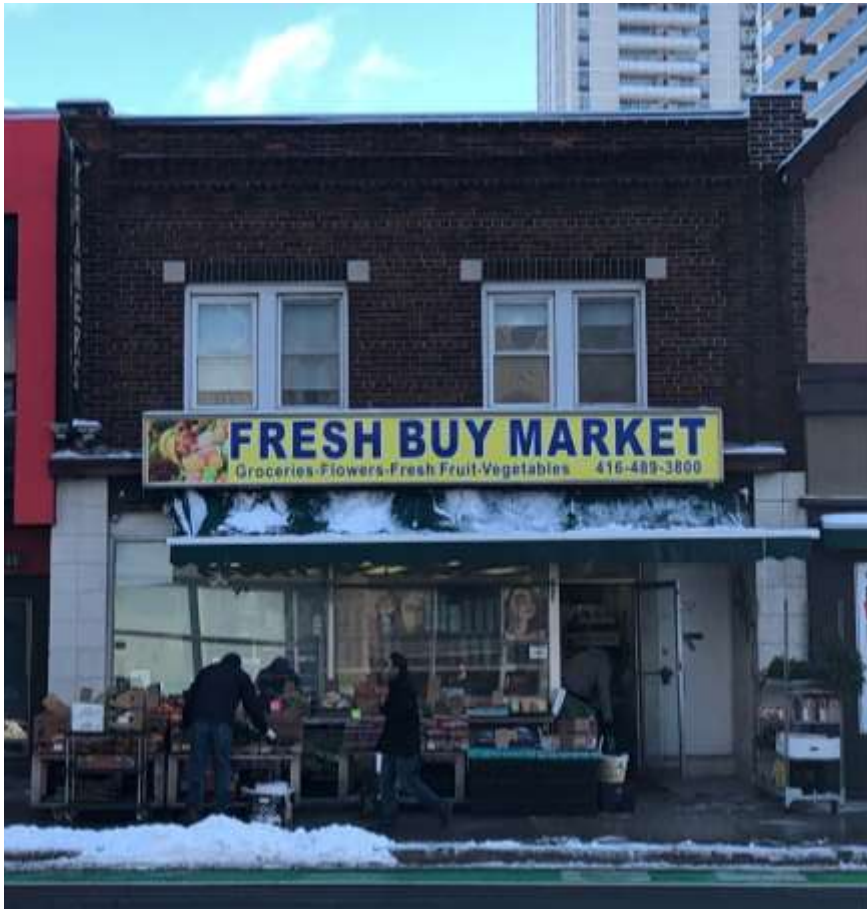
15. Current photograph looking east, showing the west elevation of the building at 1913 Yonge Street.