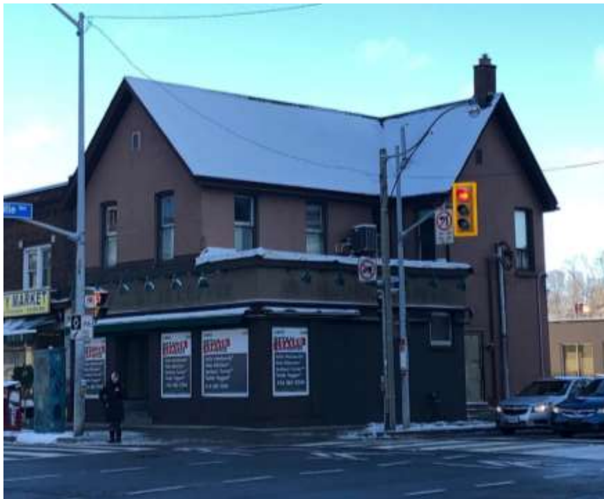
West and south elevations of 1909 Yonge Street at the northeast corner of Yonge Street and Davisville Avenue