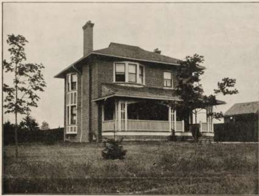
5. 1907 photograph of J. J. Davis' home on the west side of Yonge Street, across from Merton Street, published in The Toronto World , 15 September 1907. (TPL)