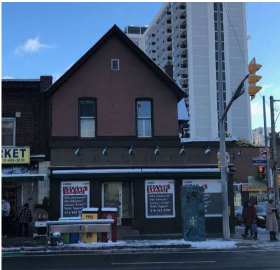
12. Current photograph looking east, showing the west elevation of the building at 1909 Yonge Street. (Heritage Planning, 2021)