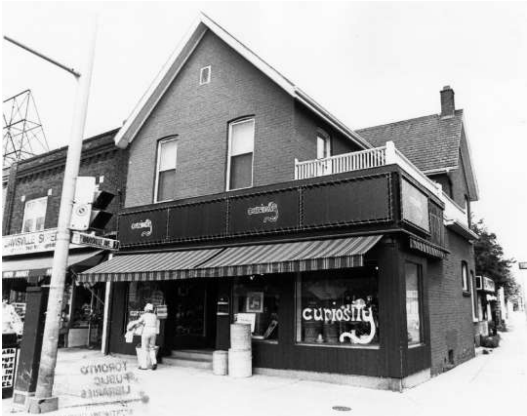
10. 1981 photograph showing the west elevations of the subject properties at 1909 and 1913 Yonge Street.