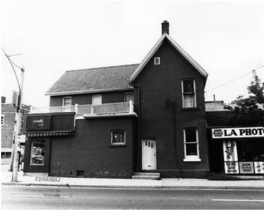
11. 1981 photograph showing the south elevation of 1909 Yonge Street, along Davisville Avenue. (TPL)