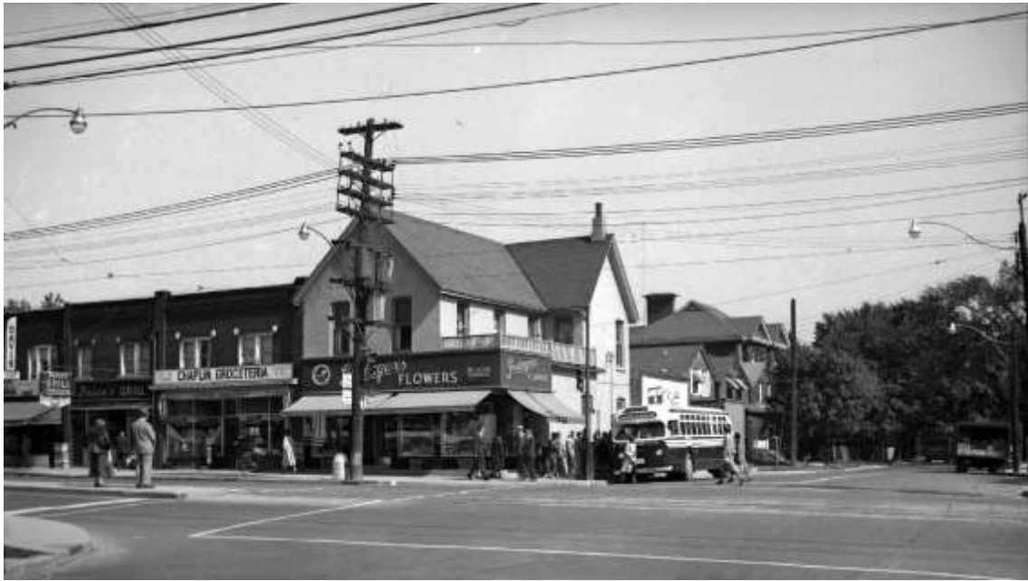
9. 1952 photograph showing the subject properties at 1909 and 1913 Yonge Street at the northeast corner of Yonge Street and Davisville Avenue. (TPL)