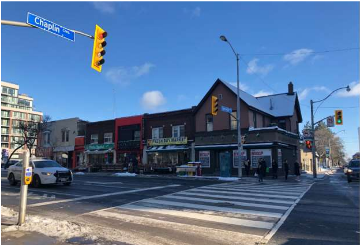
17. Context view looking east from Yonge Street, showing the subject properties at 1909 and 1913 Yonge Street, within a grouping of late-19th and early-20th-century buildings on the east side of Yonge Street, between Davisville Avenue and Millwood Road. (Heritage Planning, 2021)