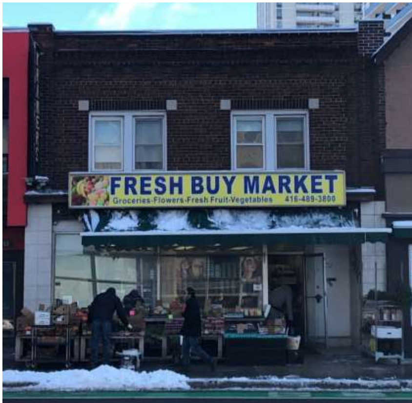
West elevation of 1913 Yonge Street (Heritage Planning, 2021)