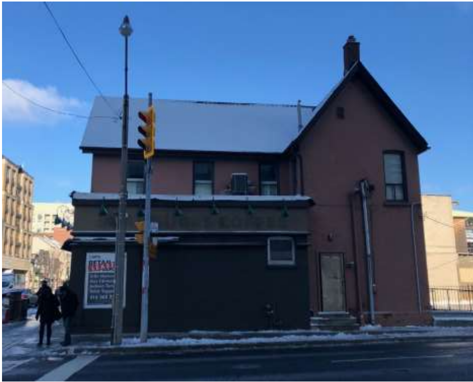
13. Current photograph looking north, showing the south elevation of the building at 1909 Yonge Street. (Heritage Planning, 2021)