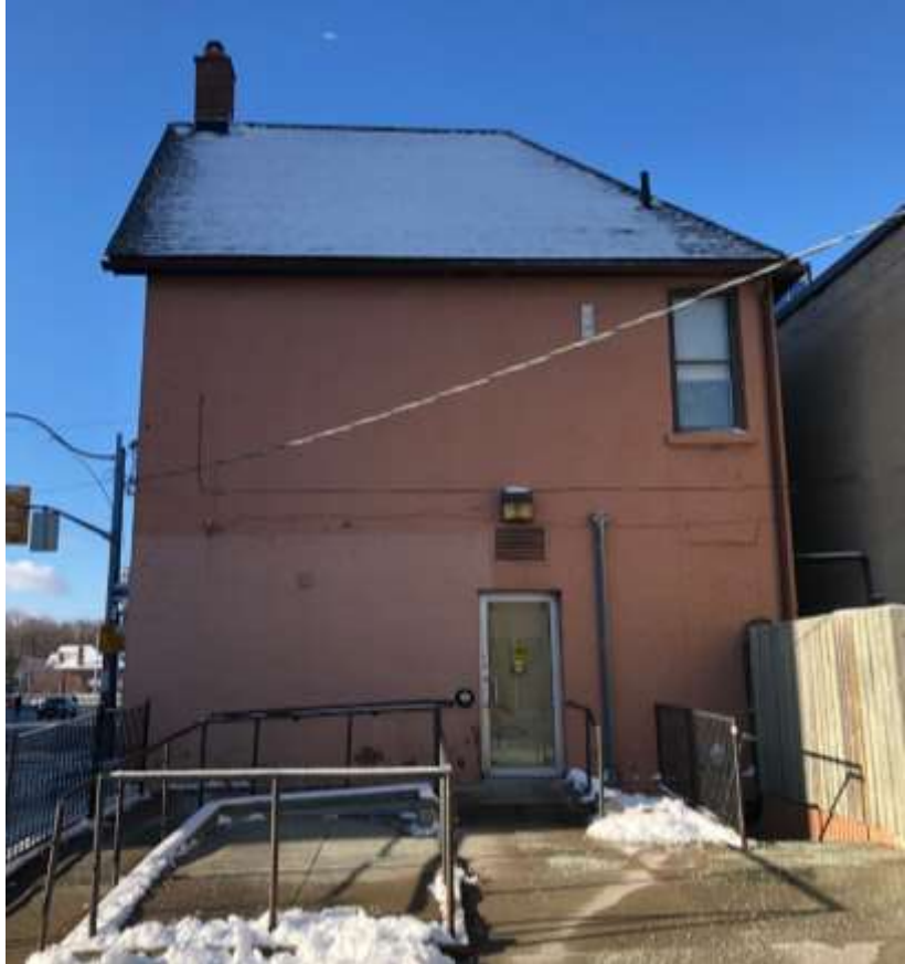
14. Current photograph looking west, showing the east elevation of the building at 1909 Yonge Street. Note the hipped roof profile at the building's northeast corner, on the right (Heritage Planning, 2021)