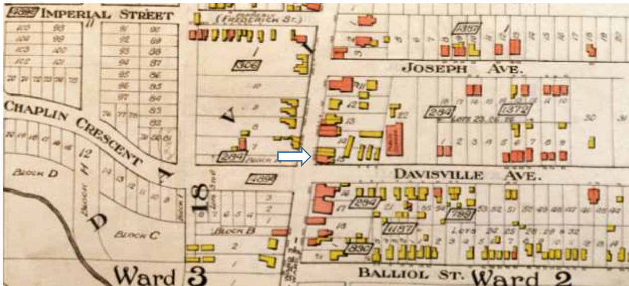
6. 1913 Goad's Map, with the approximate location of the subject properties at 1909 and 1913 Yonge Street indicated on Lot 15 at the northeast corner of Yonge Street and Davisville Avenue. By this time, a southwest brick addition has been made to the formerly L-shaped brick building at 1909 Yonge Street, and two frame buildings have been constructed directly to the north on Lot 15. Joseph Avenue (now Millwood Road) has also been created north of Davisville Avenue. (Ng)