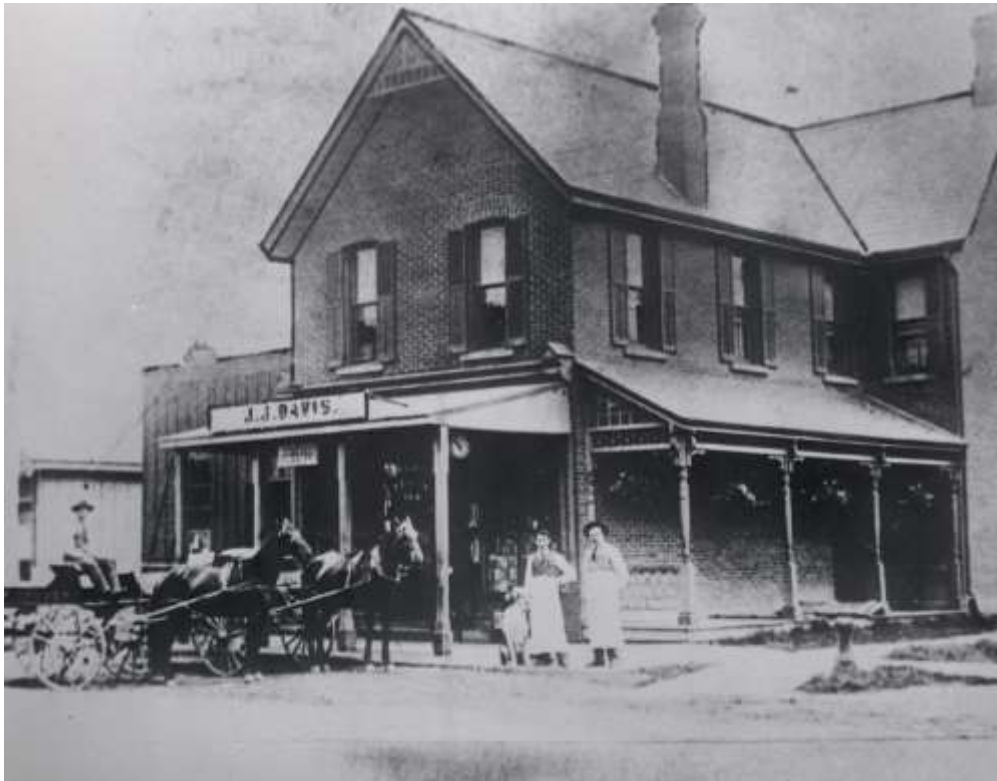
4. c. 1900 photograph of the J. J. Davis General Store and Post Office at the northeast corner of Yonge Street and Davisville Avenue. Note that at this time, the building retained its original L-shaped footprint and wooden verandahs along its west and south elevations.