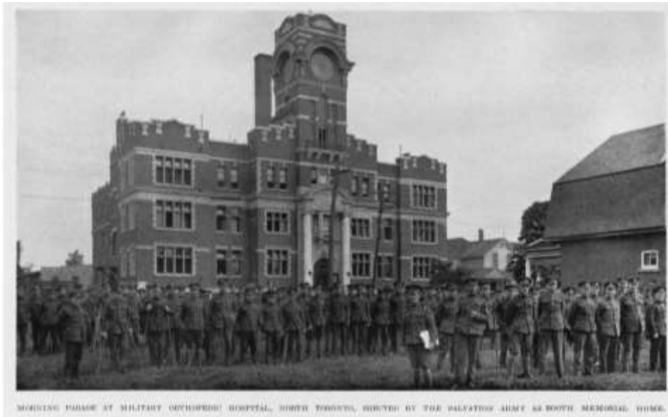
7. 1917 photograph originally published in Construction magazine of the Davisville Military Orthopedic Hospital, which operated out of the Salvation Army's Booth Memorial Training College on the north side of Davisville Avenue from 1917 to 1921. https://www.communitystories.ca/v1/pm_v2.php?id=display_original&lq=English&fl=0&rd=92511&ex=00000376 )