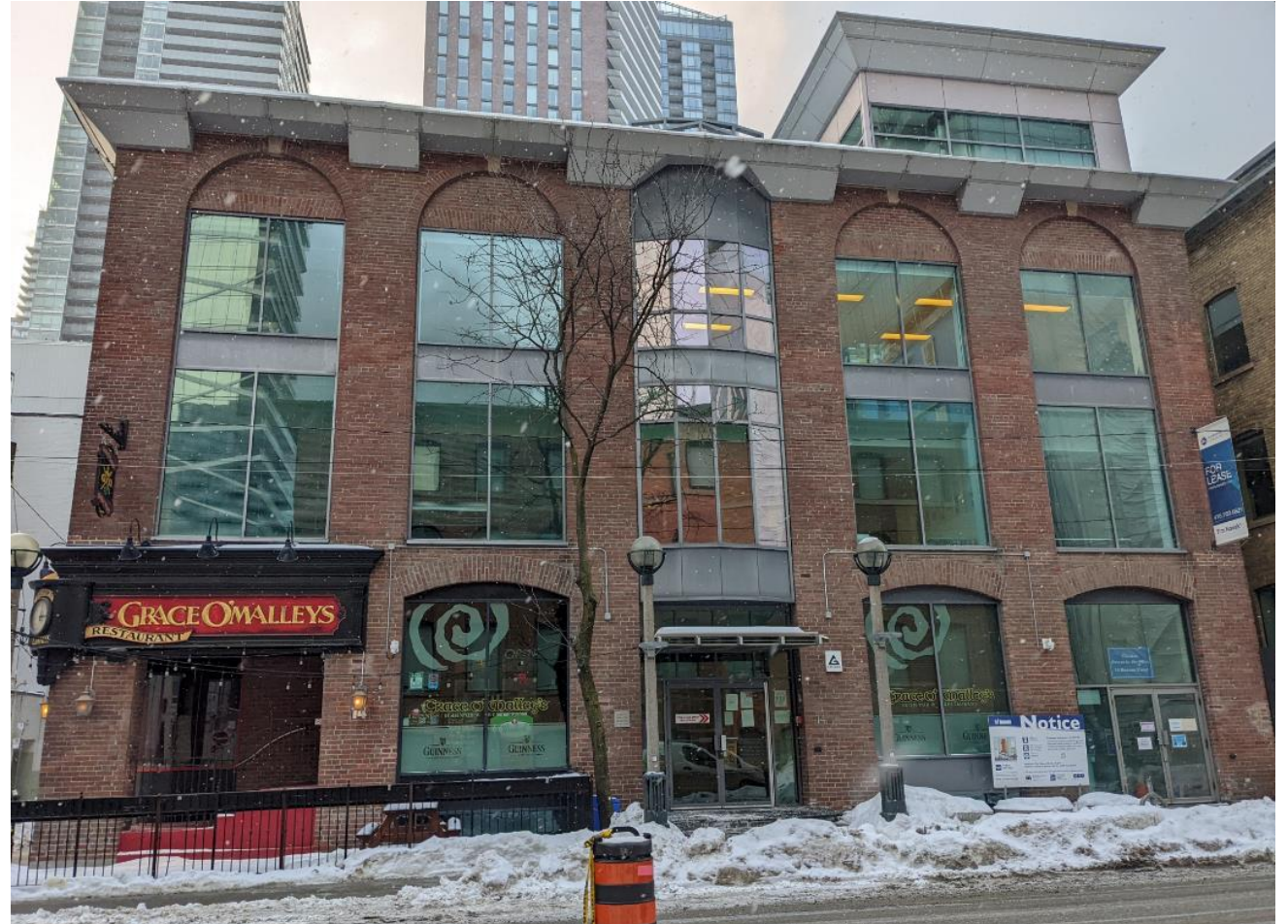
View of the principal (east) elevation of 14 Duncan Street