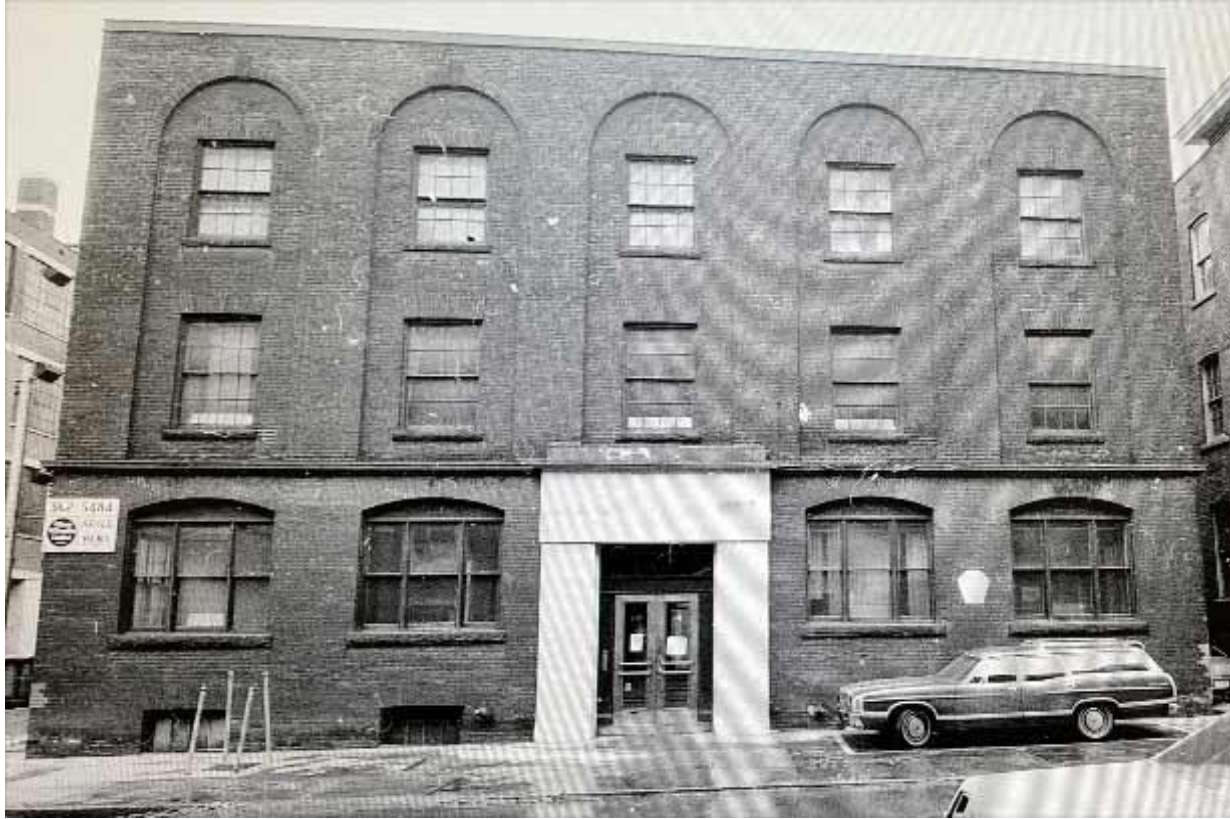
Archival photograph of 14 Duncan Street in 1973, showing the principal (east) elevation on Duncan Street