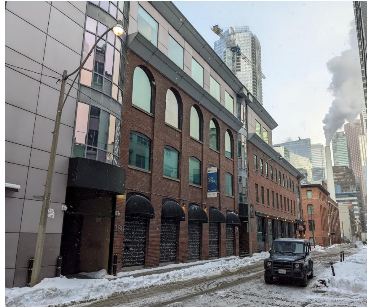
Detail of the side (south) elevation, illustrating the 1902 building (right) and the 1906 addition (left) with the fourth-storey addition that was reclad in the late-20 th century