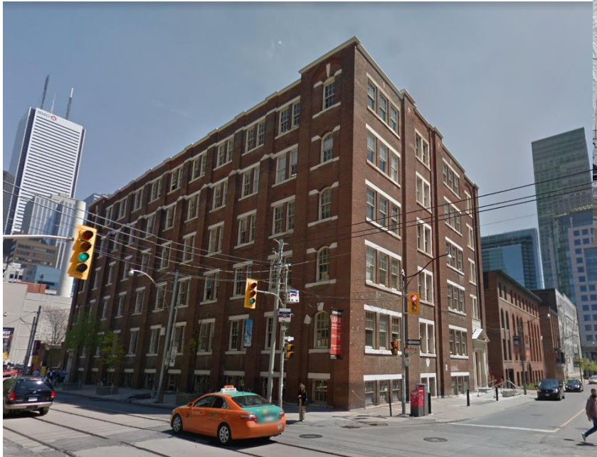
The Southam Press Building (1908), 19 Duncan Street which was part of the collection of former factories and warehouses that had been constructed at Duncan and Pearl streets in the early-20 th century