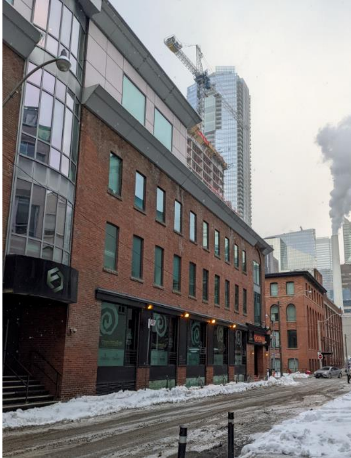
Detail of the side (south) elevation of the 1902 portion of 14 Duncan Street