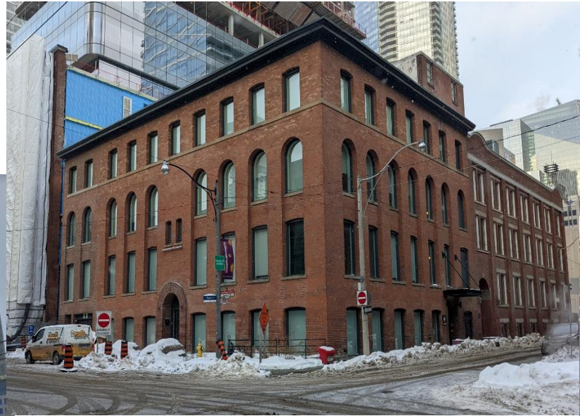
The Canada Printing Ink Company building (1903), 15 Duncan Street, which was part of the collection of former factories and warehouses that had been constructed at Duncan and Pearl streets in the early-20 th century