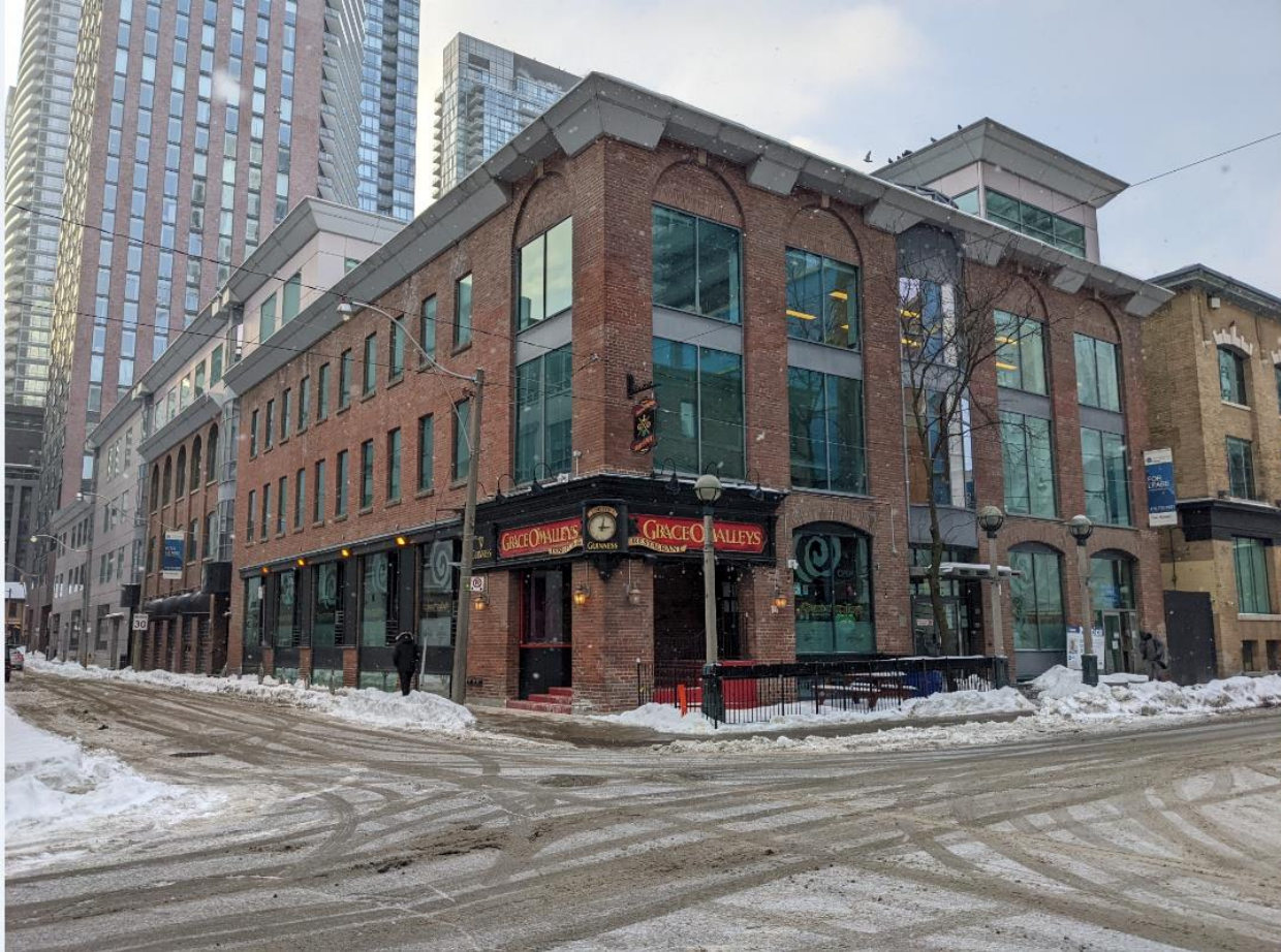
View of the southeast corner of 14 Duncan Street