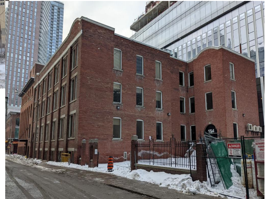
White Swan Mills Building (1903), 156 and 158 Pearl Street, which was part of the collection of former factories and warehouses that had been constructed at Duncan and Pearl streets in the early-20 th century