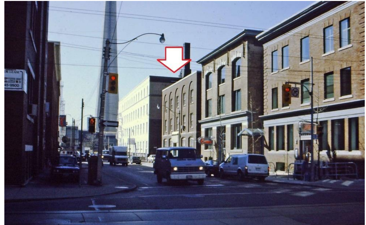
Archival Photographs of 14 Duncan Street in 1989, showing the view of the Telfer Paper Box Building from Adelaide Street West