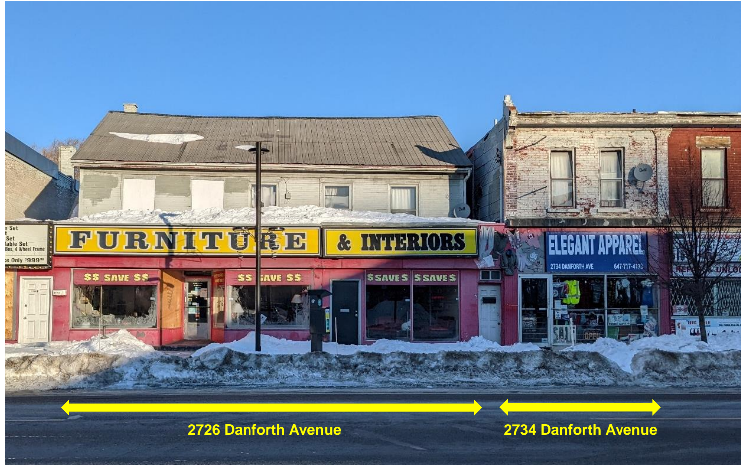
Current photograph showing the principal (south) elevations of the subject properties at 2726 and 2734 Danforth Avenue.