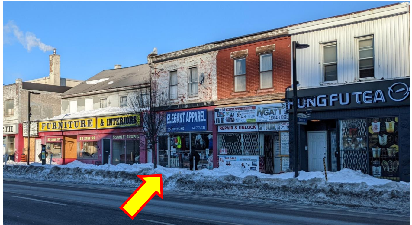
Current photos of 2734 Danforth Avenue showing the wooden cornice and decorative corner bracket. Also visible are the two adjacent properties at 2736 and 2740, which were built together with the subject property in c.1886