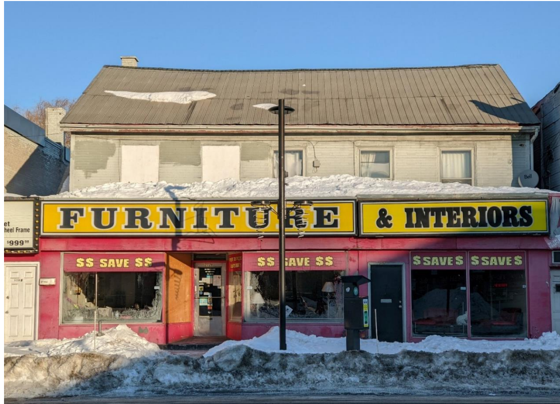
Above: current photo of the Little York Hotel Top right: The (Charles) Gates Hotel built c.1858 Bottom right: The Miller Tavern built c.1857