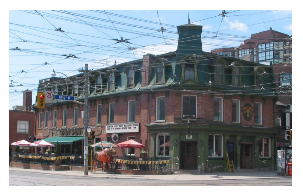
Wheat Sheaf Tavern, c. 1849. Listed June 20,1973.

93 Power St - Listed June 20, 1973