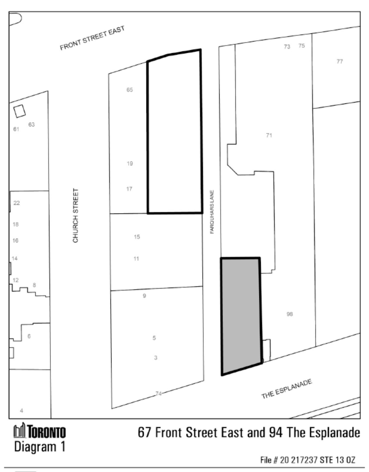
3 City of Toronto By-law No. xxx-20~