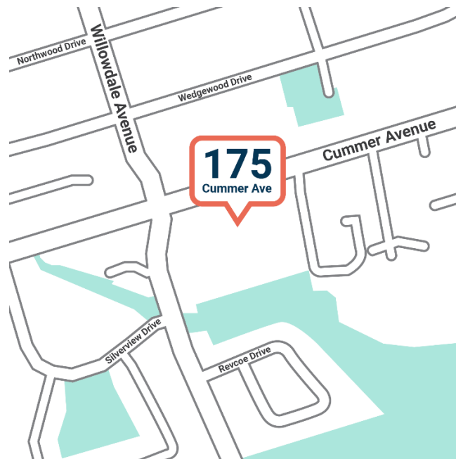
Figure 1: Map showing the project site and surrounding streets for the proposed modular housing building at 175 Cummer Ave

In Willowdale, the City is planning to build a three-storey modular building with 60 studio apartments at 175 Cummer Avenue (next to Willowdale Manor) that will be ready for occupancy in 2021. A local non-profit housing provider (to be selected through a competitive Request for Proposal process) will lease and manage the building and provide support services to the tenants.