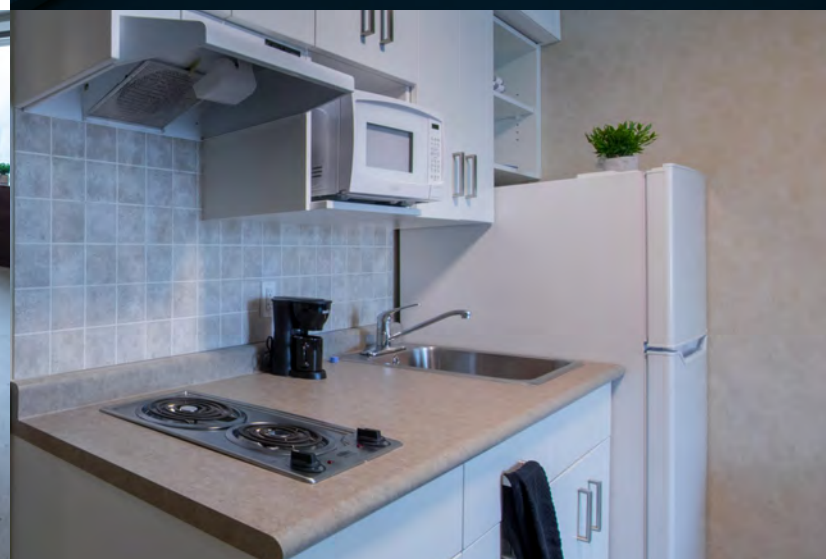
Kitchen area of a modular housing unit at 11 Macey Avenue