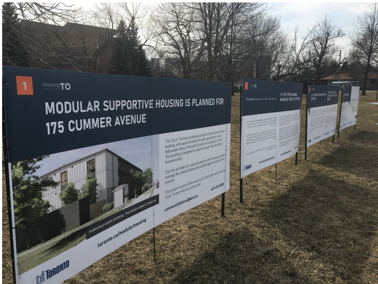
Figure 3: On-site signage for modular supportive housing planned for 175 Cummer Ave.

Custom information signs were installed on March 10 th , 2021, to provide more information about the project, details of community engagement meetings, project webpage and contact information by email and phone. The on-site signage included project information in English, Chinese (Simplified and Traditional), Farsi, and Korean.