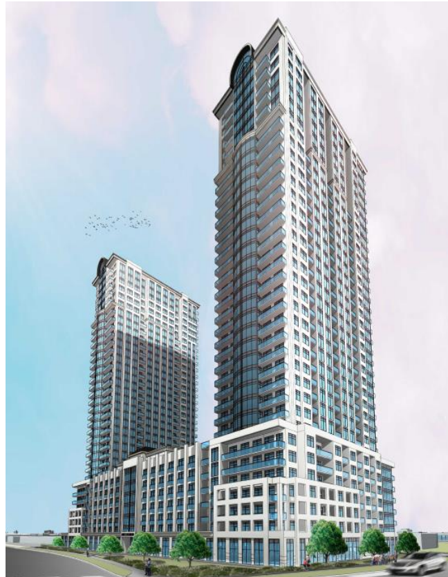
View looking northwest at subject lands