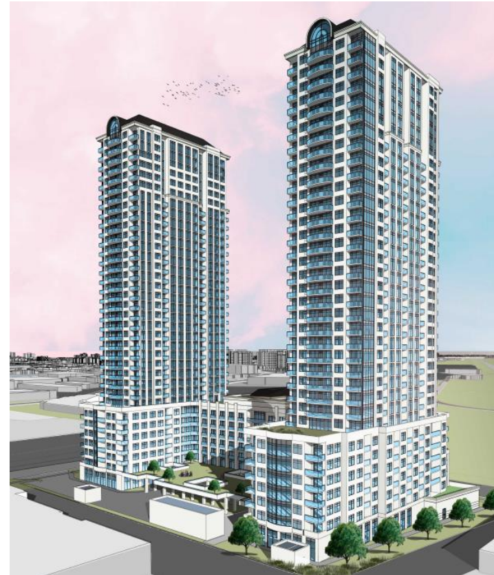
View looking southeast at subject lands