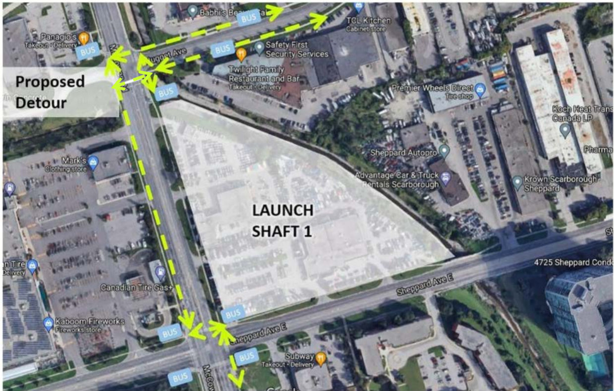
Figure 4 – Pedestrian Detour