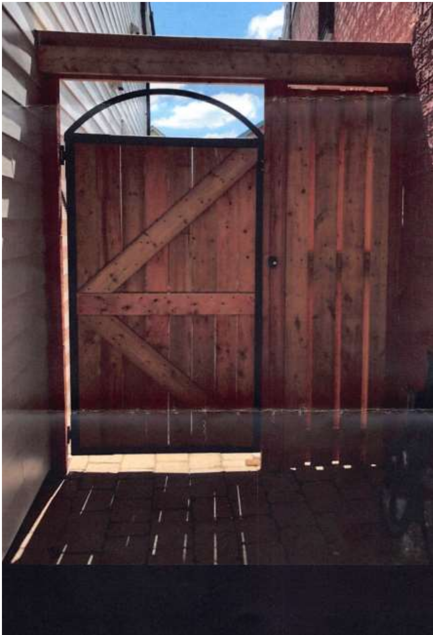
Attachment 3: Applicant photo of gate