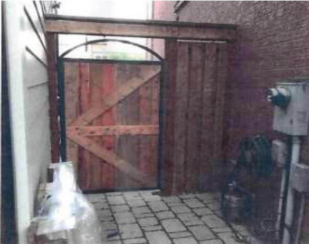
Attachment 4: Applicant photo of gate