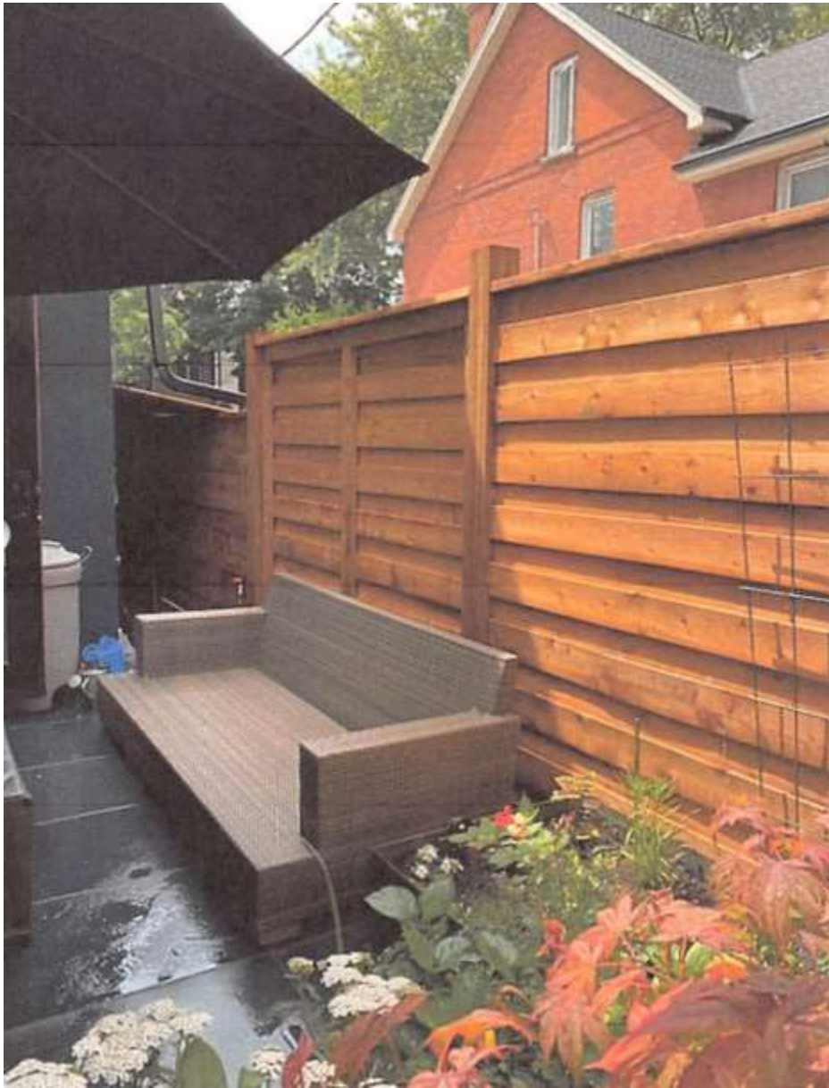
Attachment 3: Applicant photo of fence