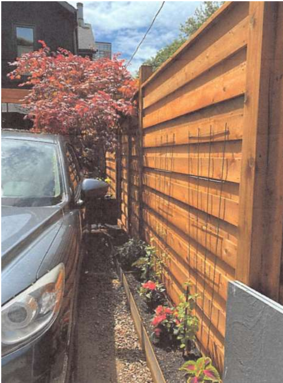
Attachment 4: Applicant photo of fence