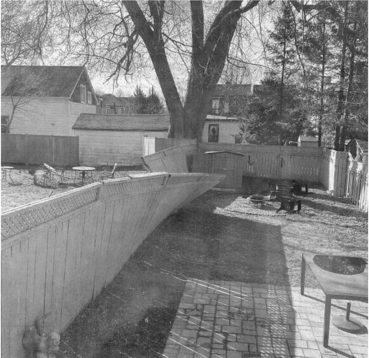
Attachment 3: Damaged fence showing location of proposed fence