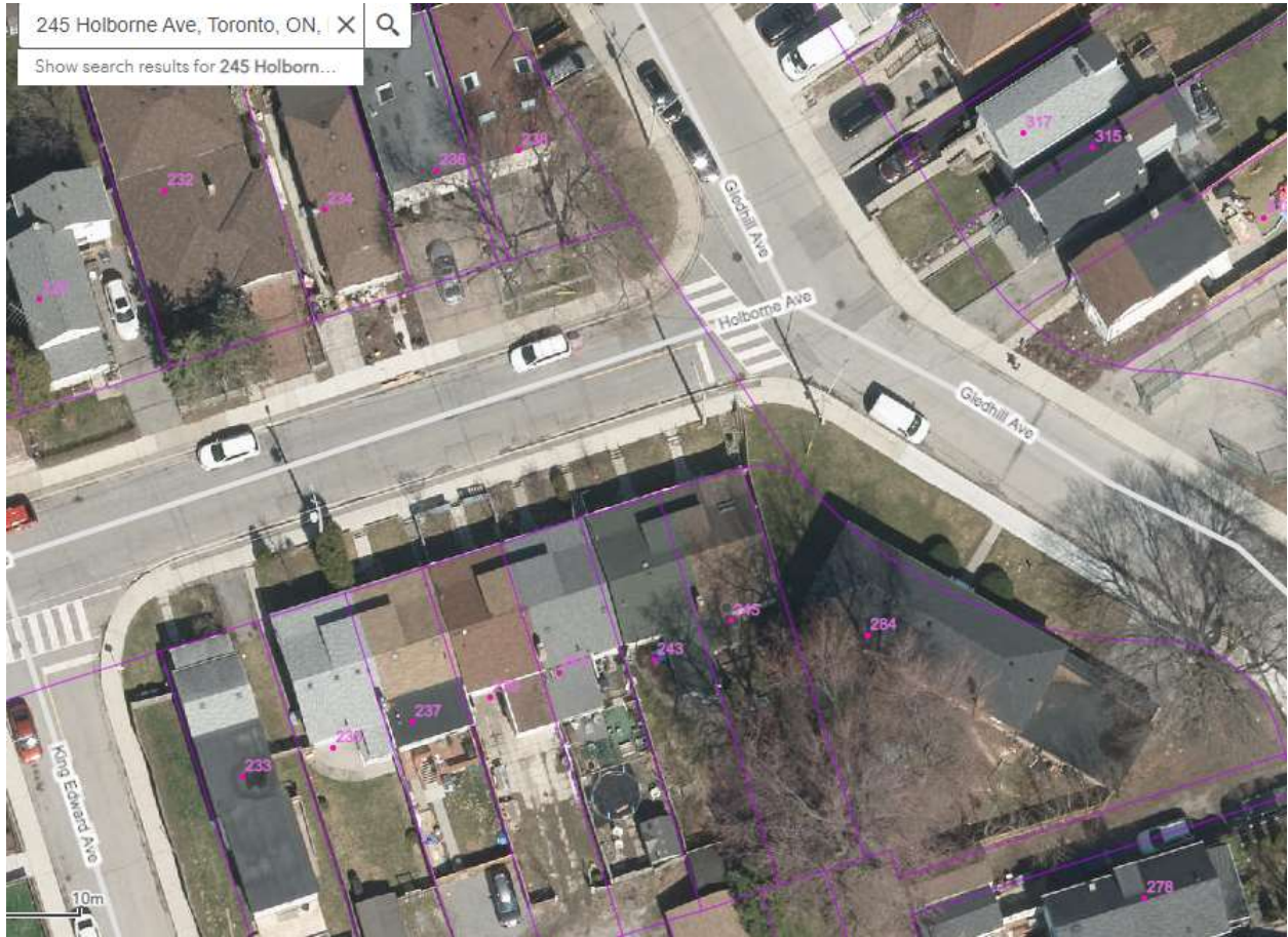
Attachment 1: iView Map of Property