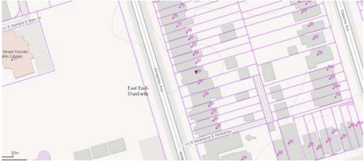
Attachment 1: iView Map of Property