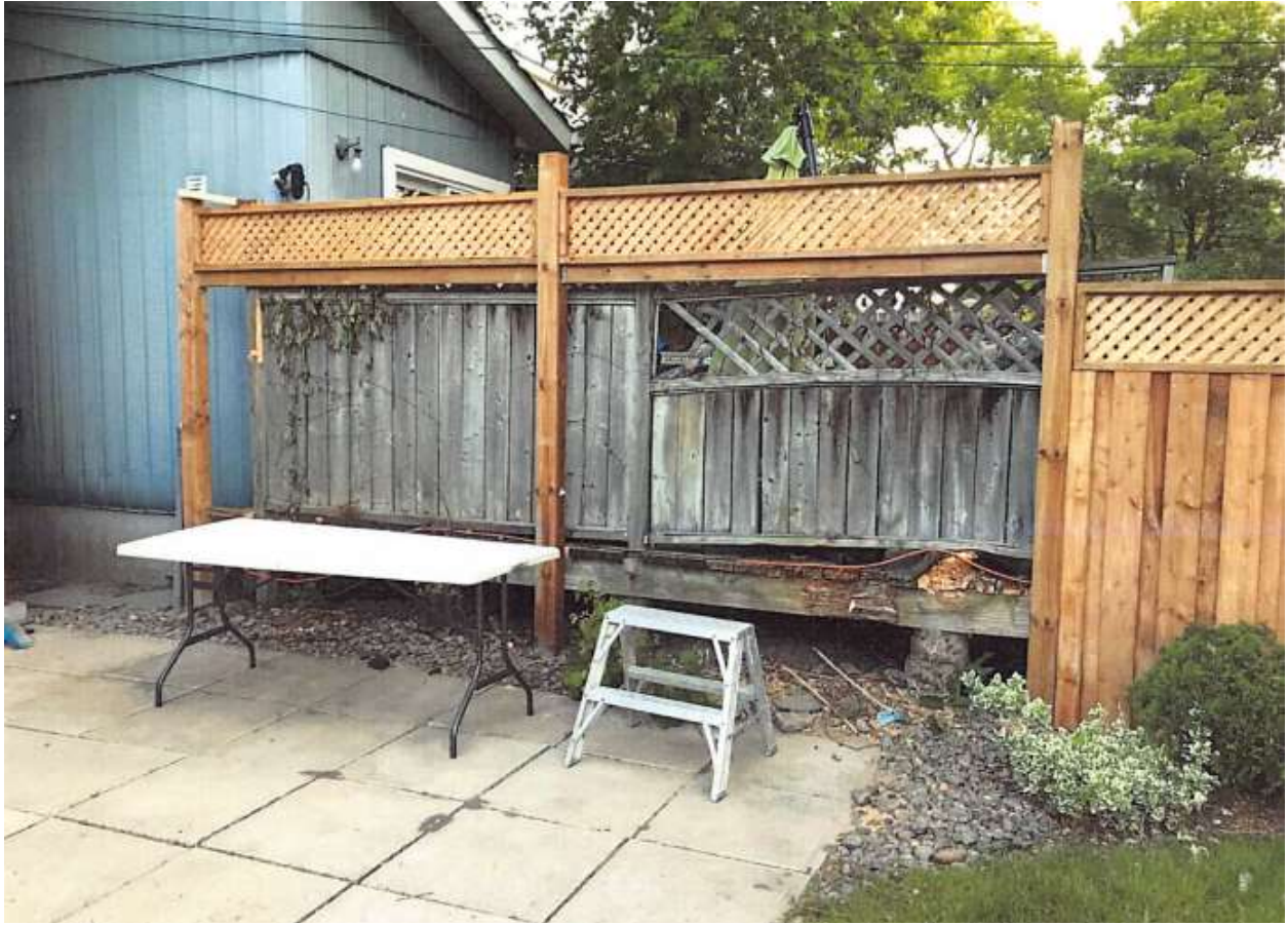
Attachment 3: Applicant photo of fence