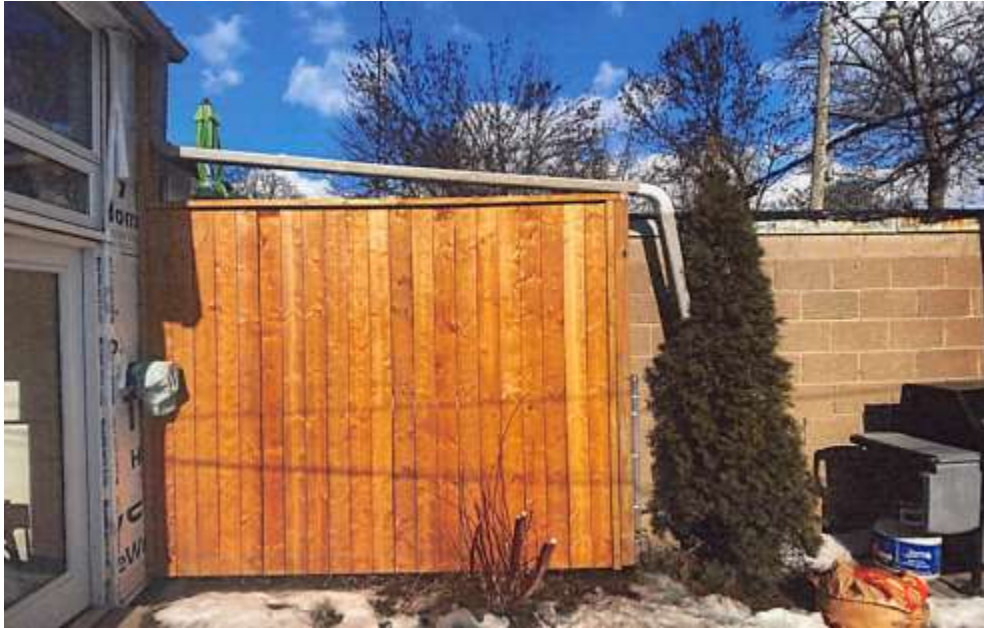
Attachment 3: Applicant photo of fence – Northeast end of property