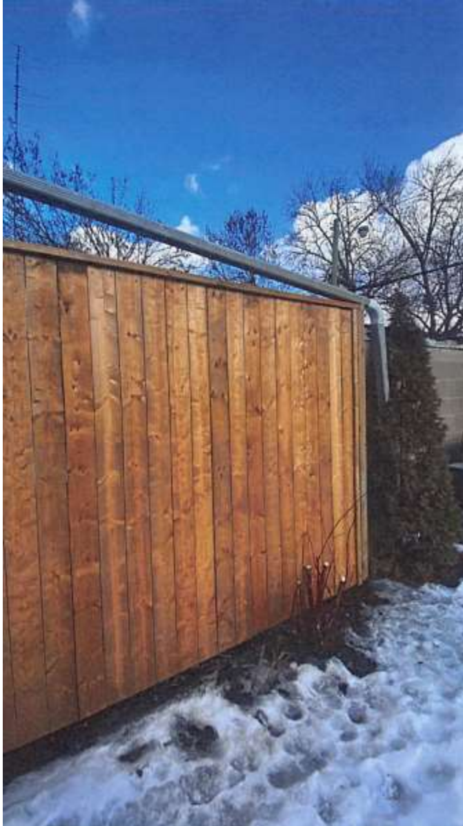
Attachment 2: Applicant photo of fence - Northeast end of property