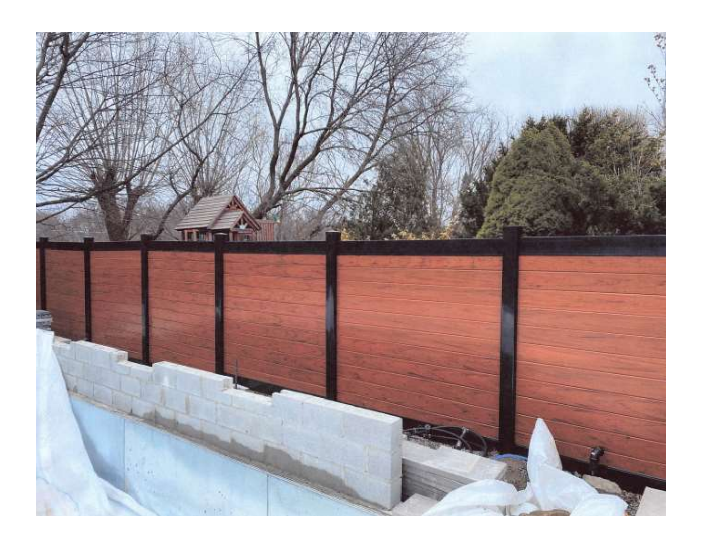
Attachment 3: Applicant photo of fence