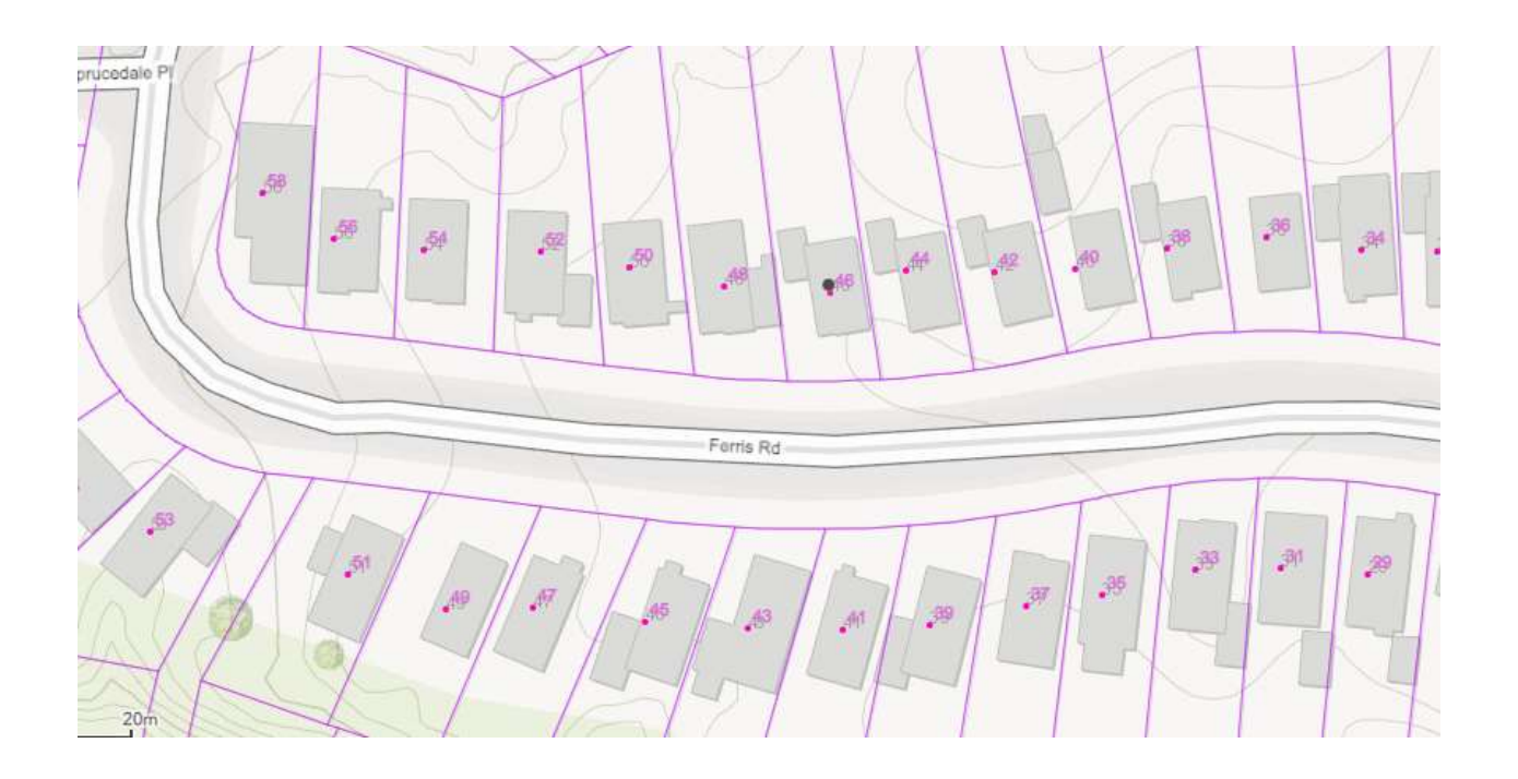
Attachment 1: iView Map of Property