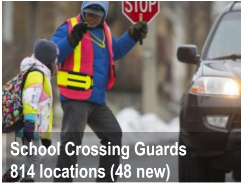
School Crossing Guards 814 locations (48 new)