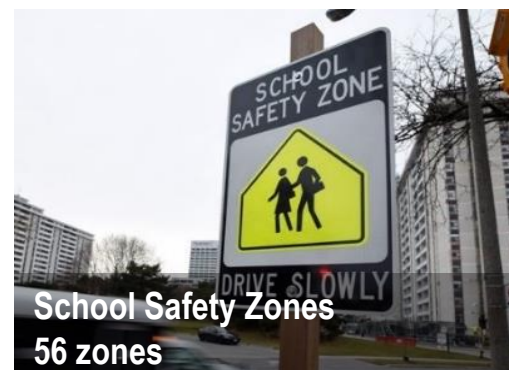
School Safety Zones 56 zones