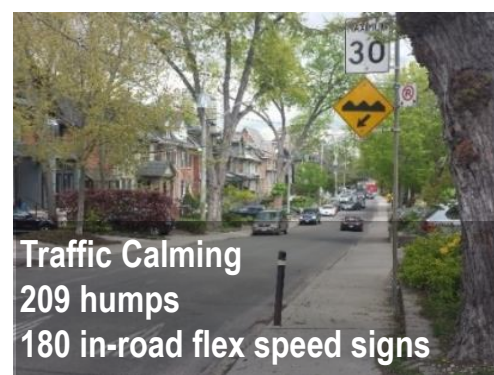
Traffic Calming 209 humps 180 in-road flex speed signs