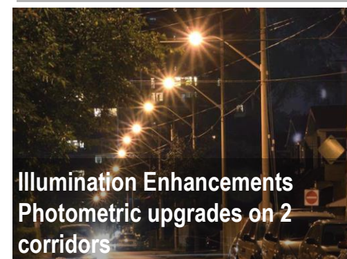
Illumination Enhancements Photometric upgrades on 2 corridors