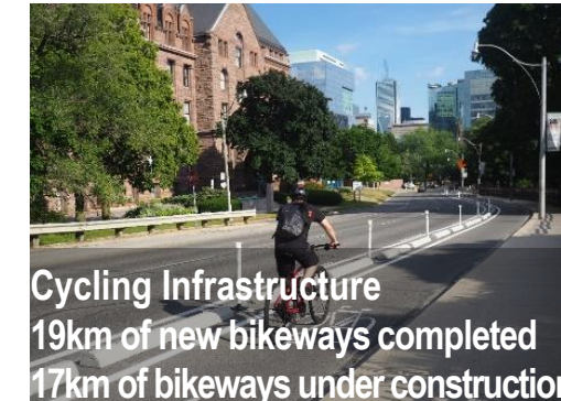
Cycling Infrastructure 19km of new bikeways completed 17km of bikeways under construction