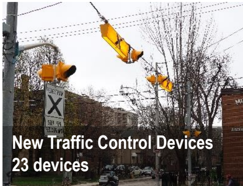
New Traffic Control Devices 23 devices