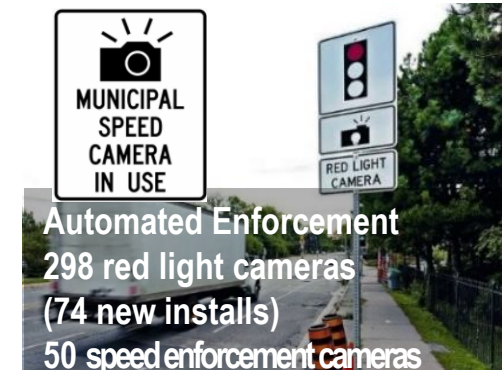
Automated Enforcement 298 red light cameras (74 new installs) 50 speed enforcement cameras