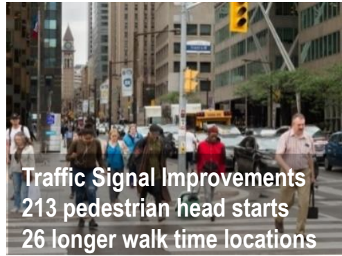
Traffic Signal Improvements 213 pedestrian head starts 26 longer walk time locations