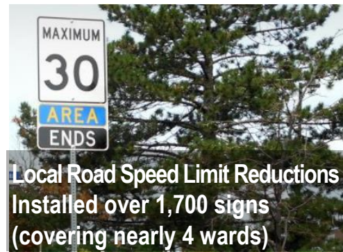
Local Road Speed Limit Reductions Installed over 1,700 signs (covering nearly 4 wards)