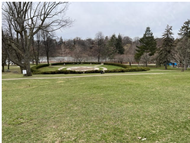
The Maple Leaf Gardens