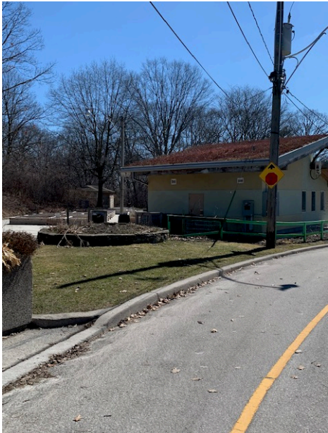
The Children's Teaching Kitchen just north of Colborne Lodge