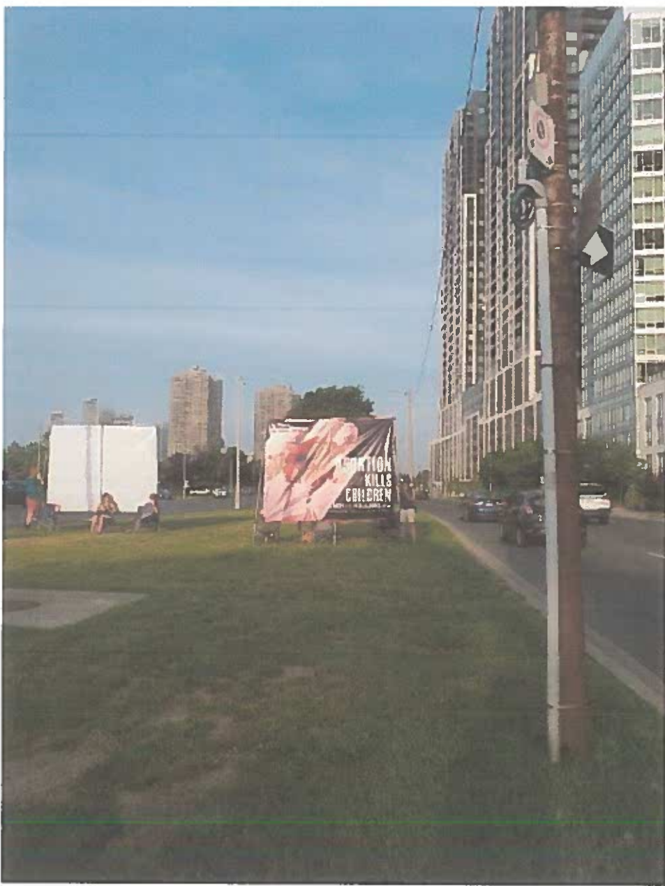
July 6, 2023 7:30am Lakeshore Blvd West to Ellis Ave.