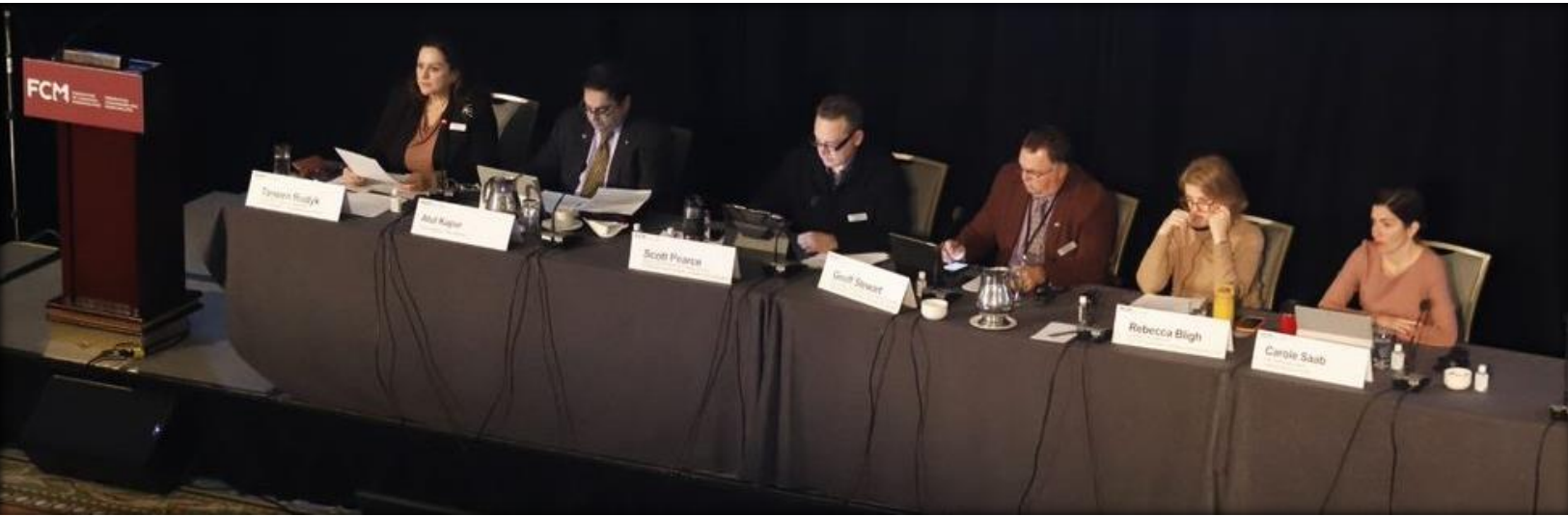
FCM's Board of Directors meets in the Chateau Laurier ballroom in Ottawa, On on December 8, 2022

FCM's member-elected Board of Directors met December 8 in Ottawa, ON, with municipal leaders from coast to coast to coast gathered to discuss collective municipal priorities ahead of the end-of-year parliamentary break.