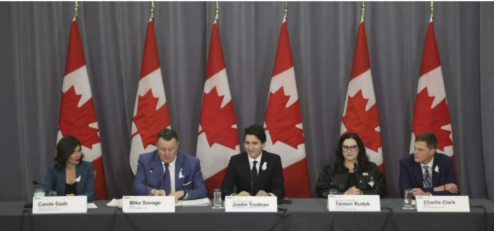
FCM's leadership and Big City Mayors' Caucus met with PM Justin Trudeau in Ottawa, ON on December 6, 2022

December's combined Advocacy Days, BCMC meeting, and our Board of Directors meeting took place amid important developments and a changing political and economic context.