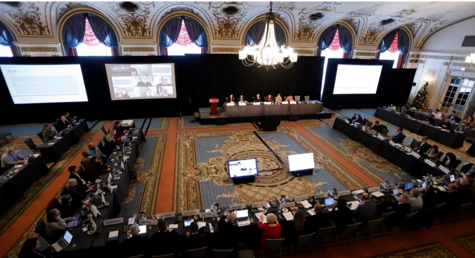
FCM’s Board of Directors met in Ottawa, ON (December 8, 2022).