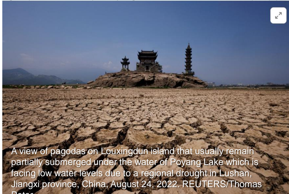
A view of pagodas on Louxingdun island that usually remain partially submerged under the water of Poyang Lake which is facing low water levels due to a regional drought in Lushan, Jiangxi province, China, August 24, 2022.