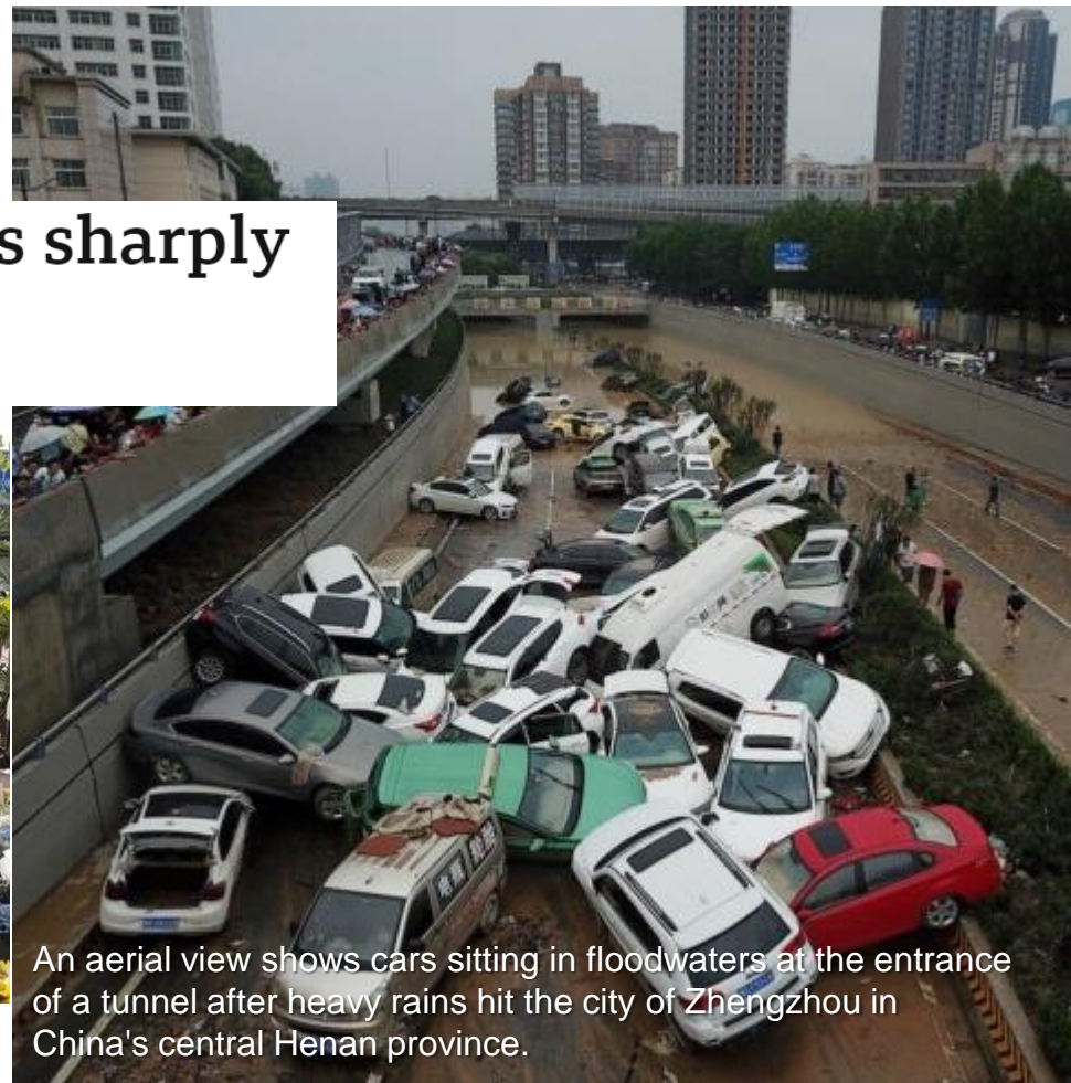
An aerial view shows cars sitting in floodwaters at the entrance of a tunnel after heavy rains hit the city of Zhengzhou in China's central Henan province.